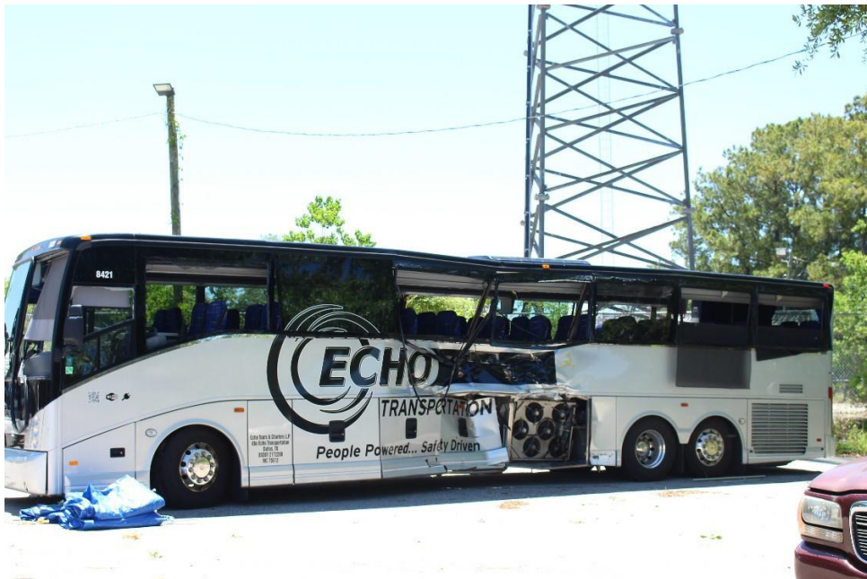
Photo #2: The exterior left side of motorcoach showing impact damage