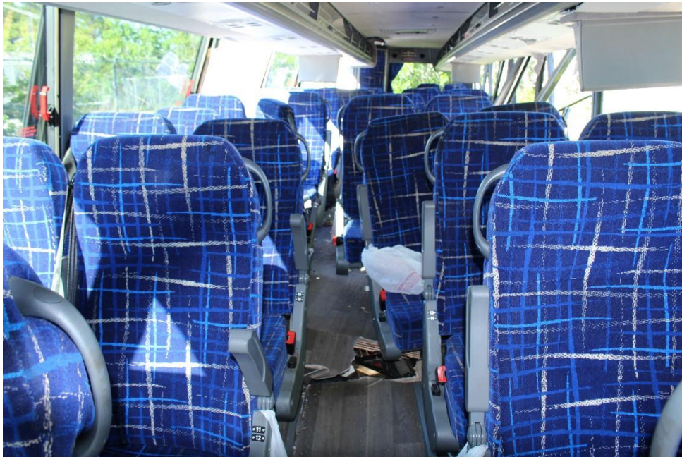
Photo #4: Interior of motorcoach at point of impact with the train