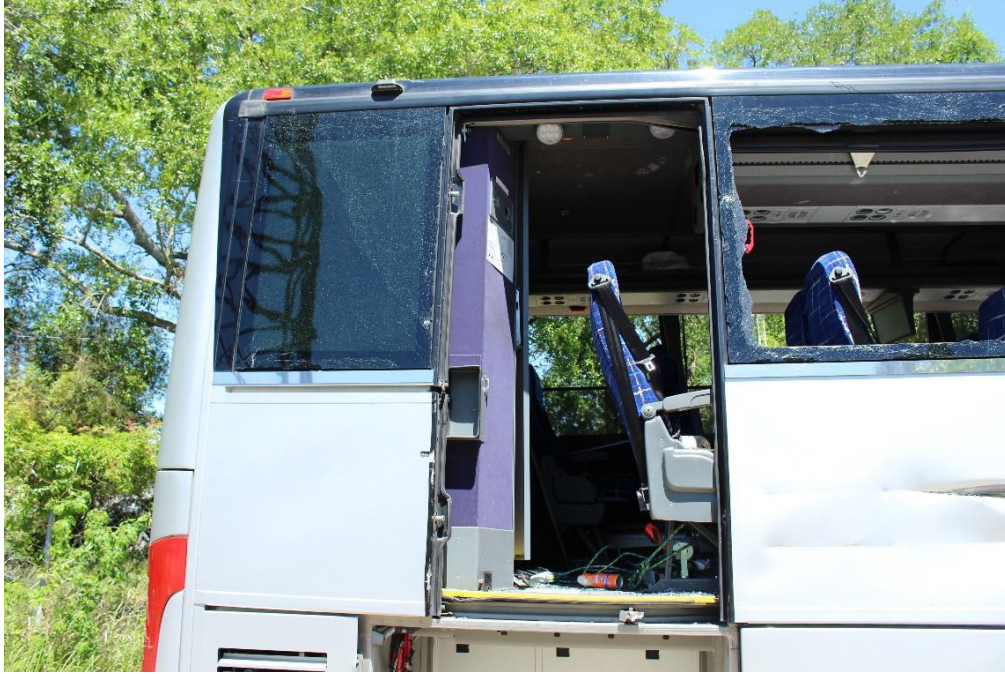
Photo #5: Exterior close-up view of cut away rear door of motorcoach