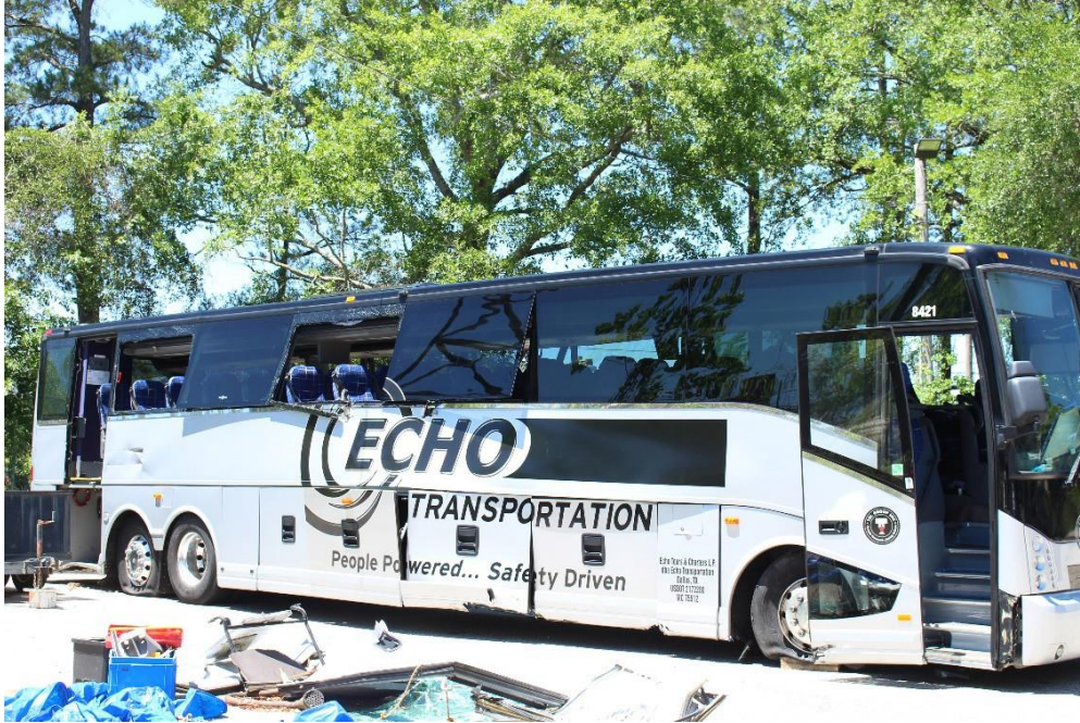
Photo #3: Exterior right side of motorcoach showing the cut away rear door