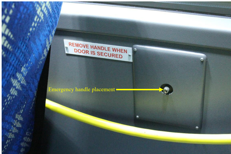
Photo #8: Interior close-up view of emergency door handle placement