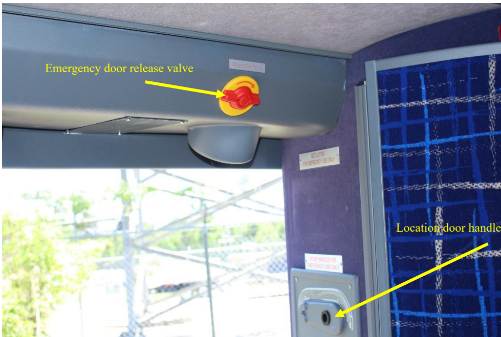
Photo #6: Interior view of rear door emergency release valve and handle location