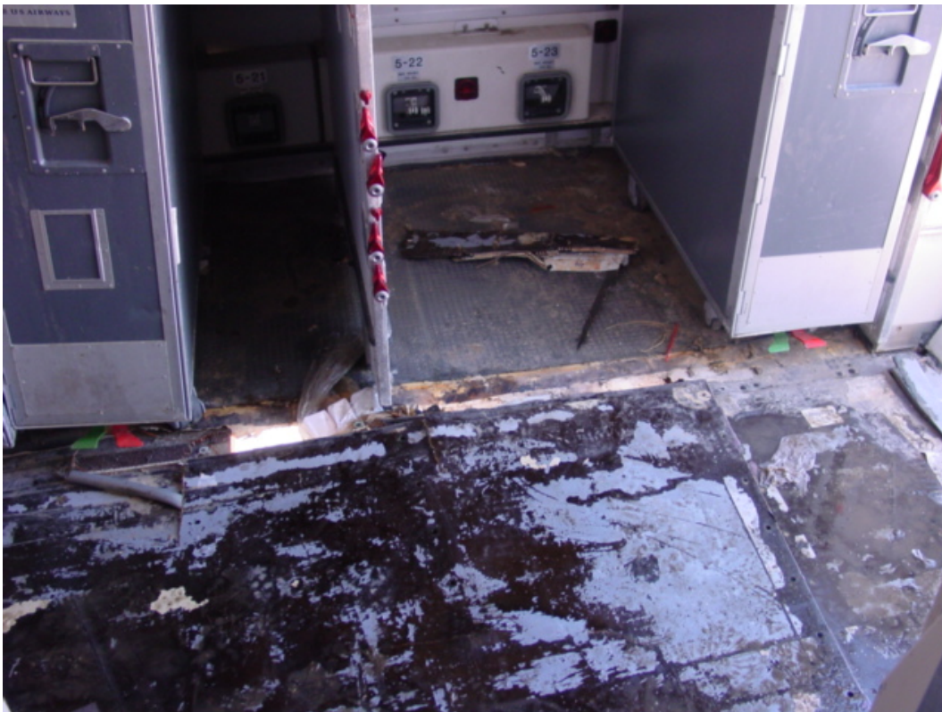
Photo 50. Similar view after removal of galley carts and NTF material