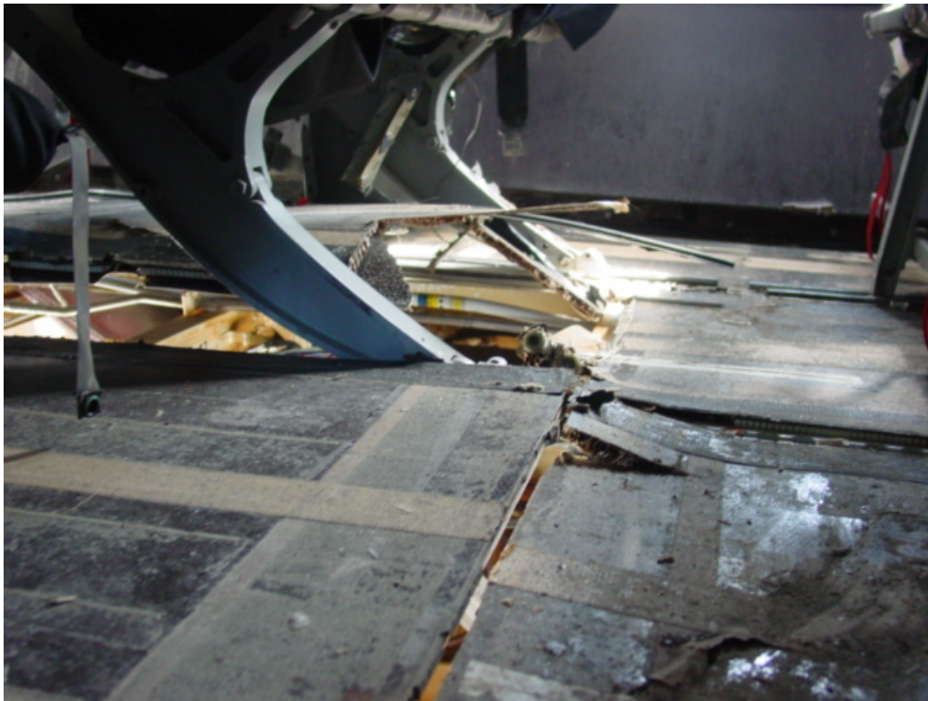
Photo 36. Similar view of the damage beneath seat 22E with baggage and carpet removed