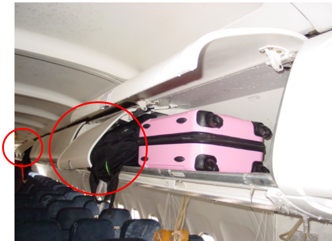
Photo 37. Forward-facing view of the two overhead bins with fractured hinges (18/19 DEF and 23/24 DEF)