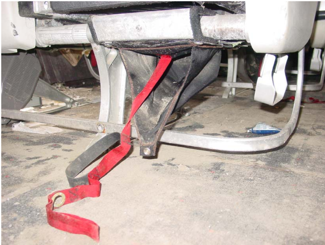
Photo 55. Life vest storage pouch beneath a first class passenger seat