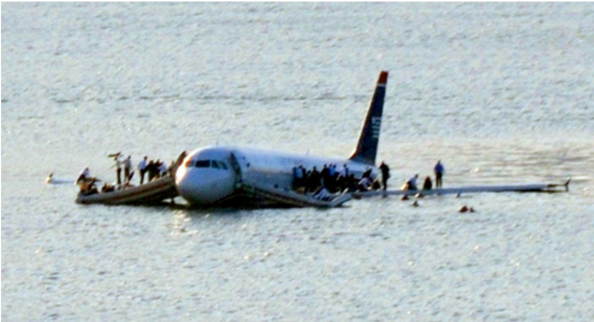
Photo 2. Photograph taken shortly after the 1L slide/raft was deployed (Note: numerous passengers in the water forward of the left wing)