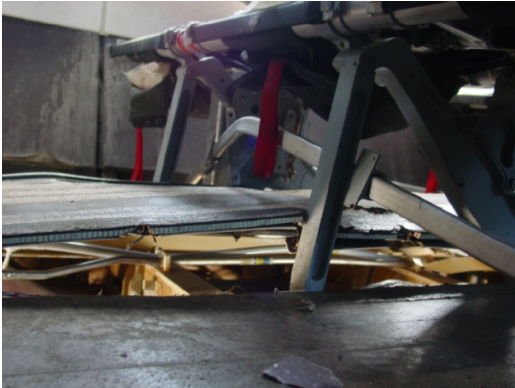
Photo 34. Similar view of row 22 DEF with baggage and carpet removed