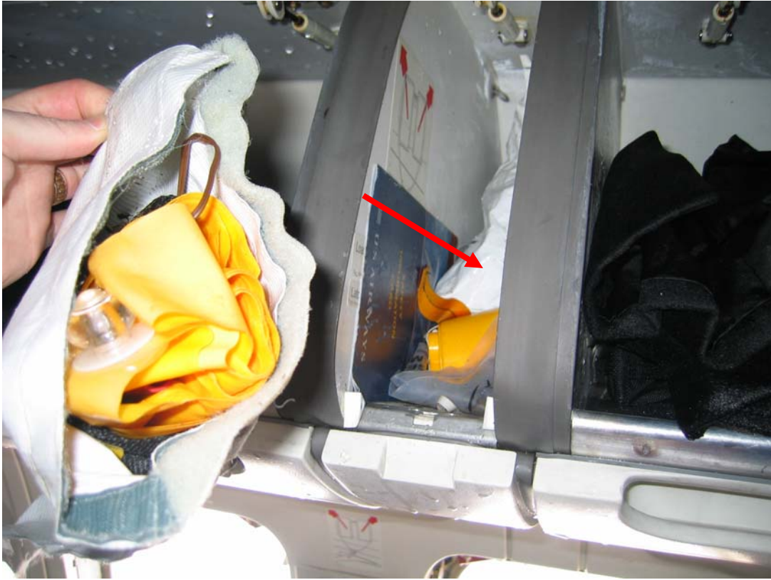
Photo 61. One life line (in plastic pouch) visible after removal of the demo kit