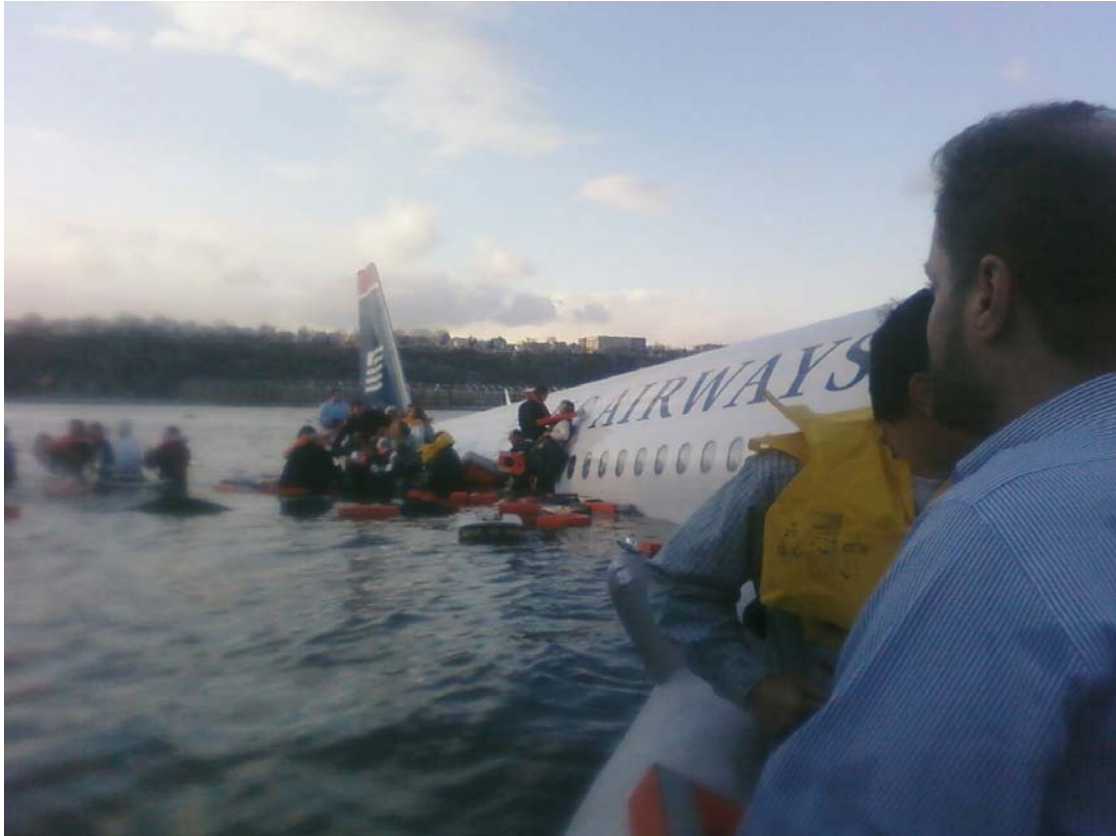
Photo 11. Passengers exiting onto the right wing