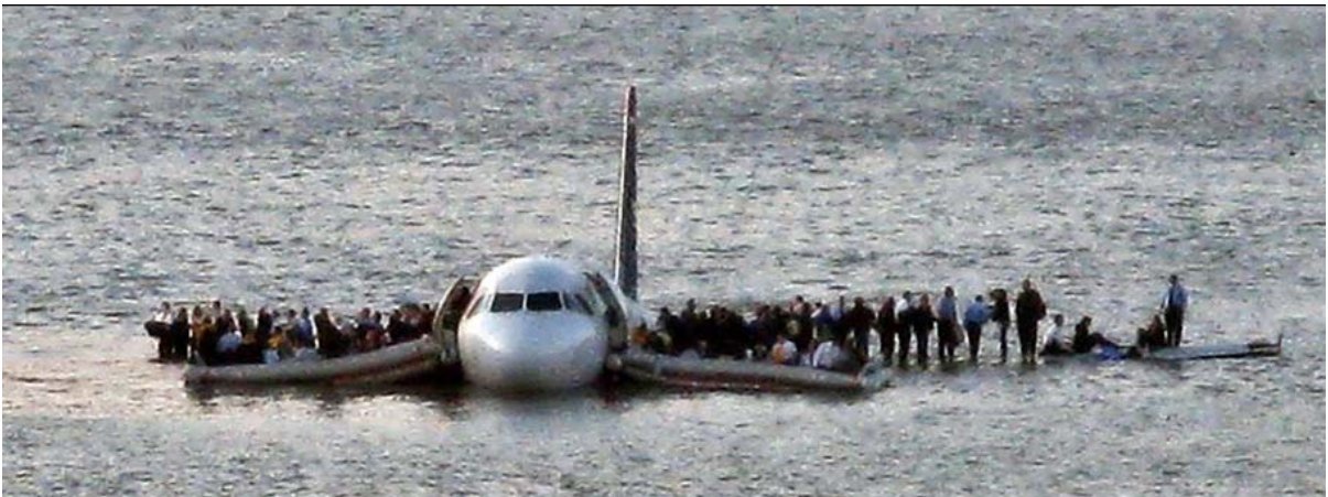
Photo 6. Passengers on the wings and in the slide/rafts prior to arrival of the ferries