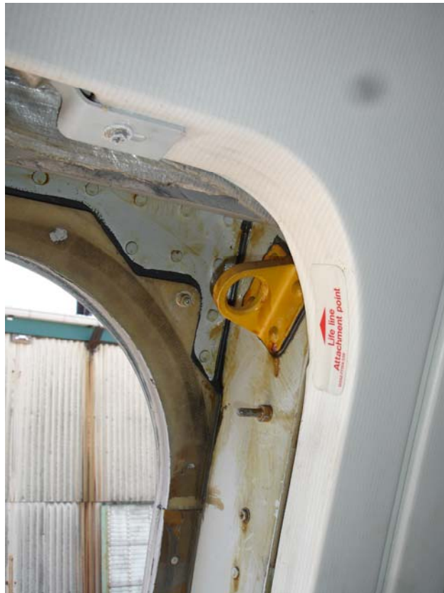
Photo 64. Life line attachment point at the top of overwing exit door frame