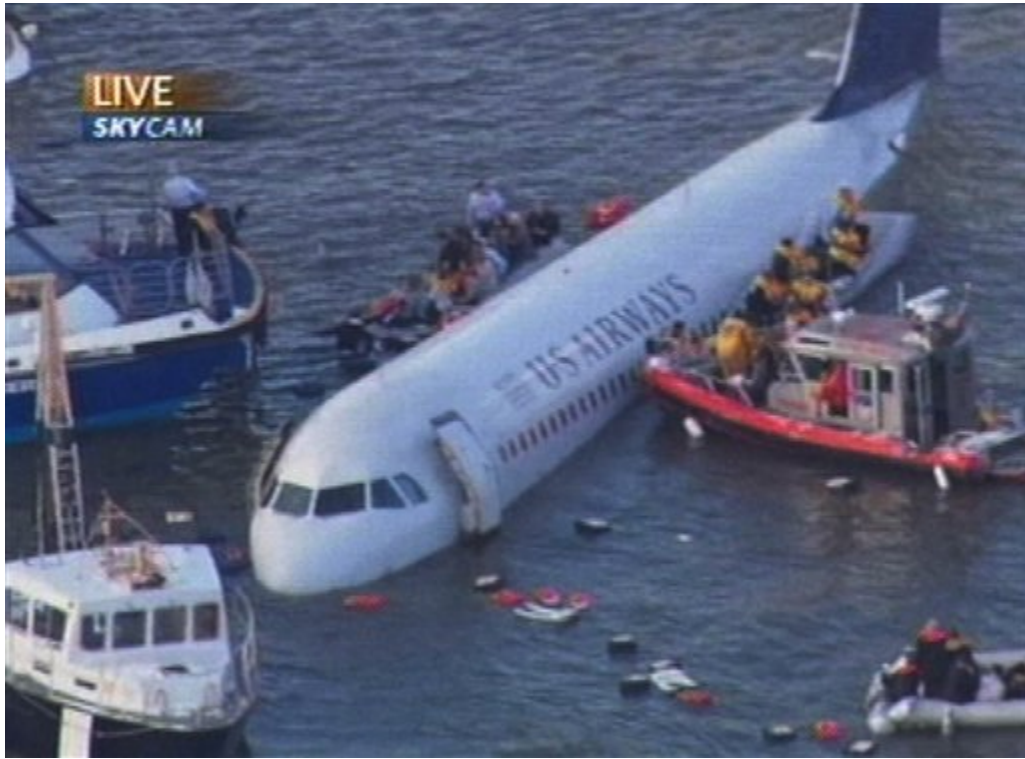
Photo 17. Passengers being rescued from the left and right offwing slides