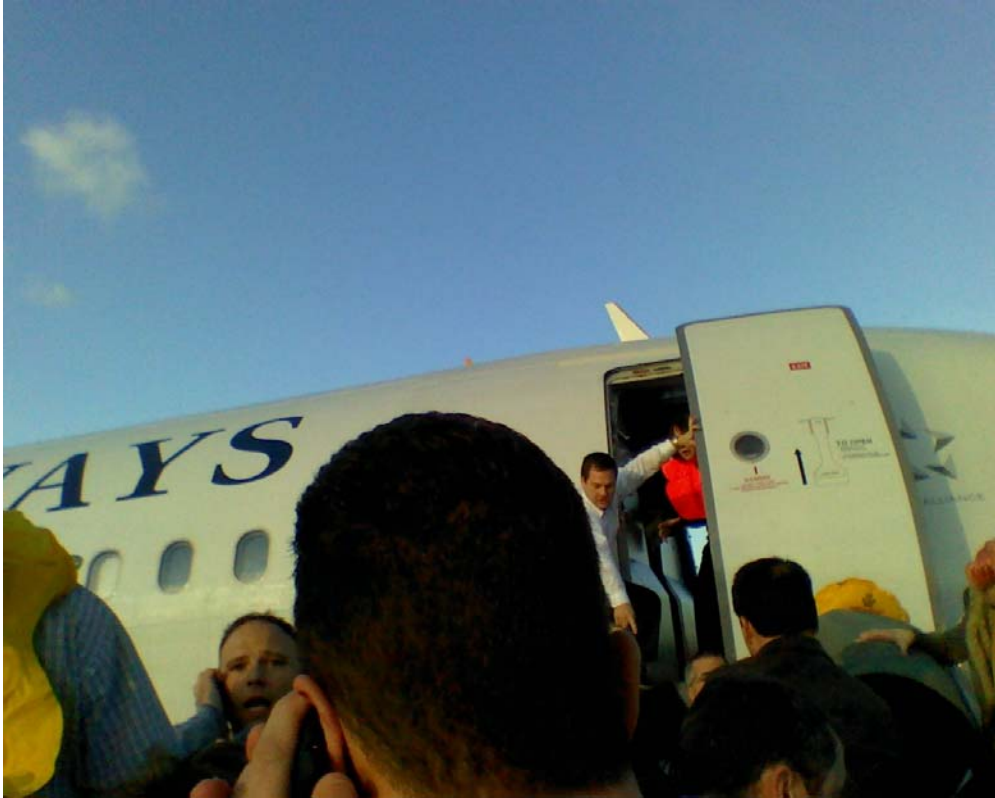
Photo 3. Passenger 6D holding open door 1R