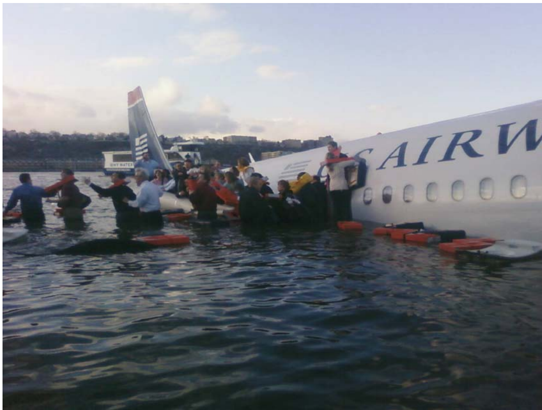
Photo 9. Passengers exiting onto the right wing