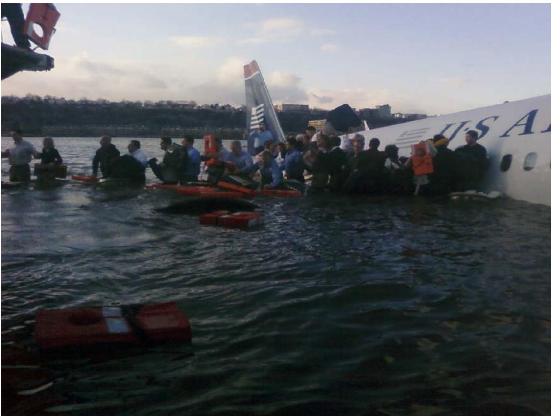
Photo 8. Passengers on the right wing after the arrival of the Thomas Jefferson