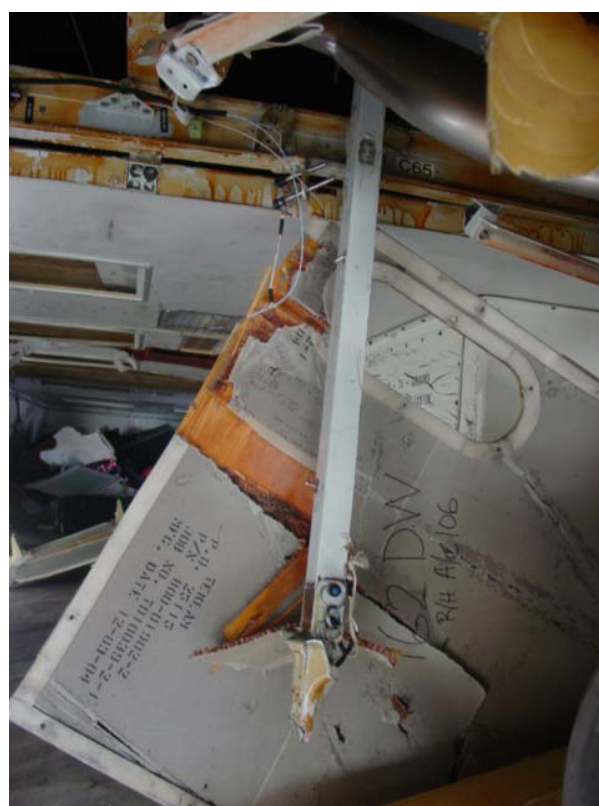
Photo 44. Forward-facing view of the aft cargo liner and vertical beam 65