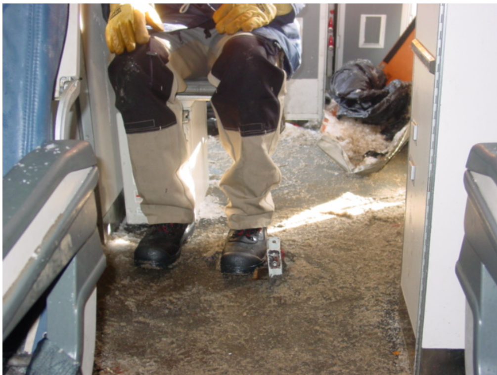
Photo 43. Relationship of vertical beam 65 to an individual seated in the “direct view” jumpseat