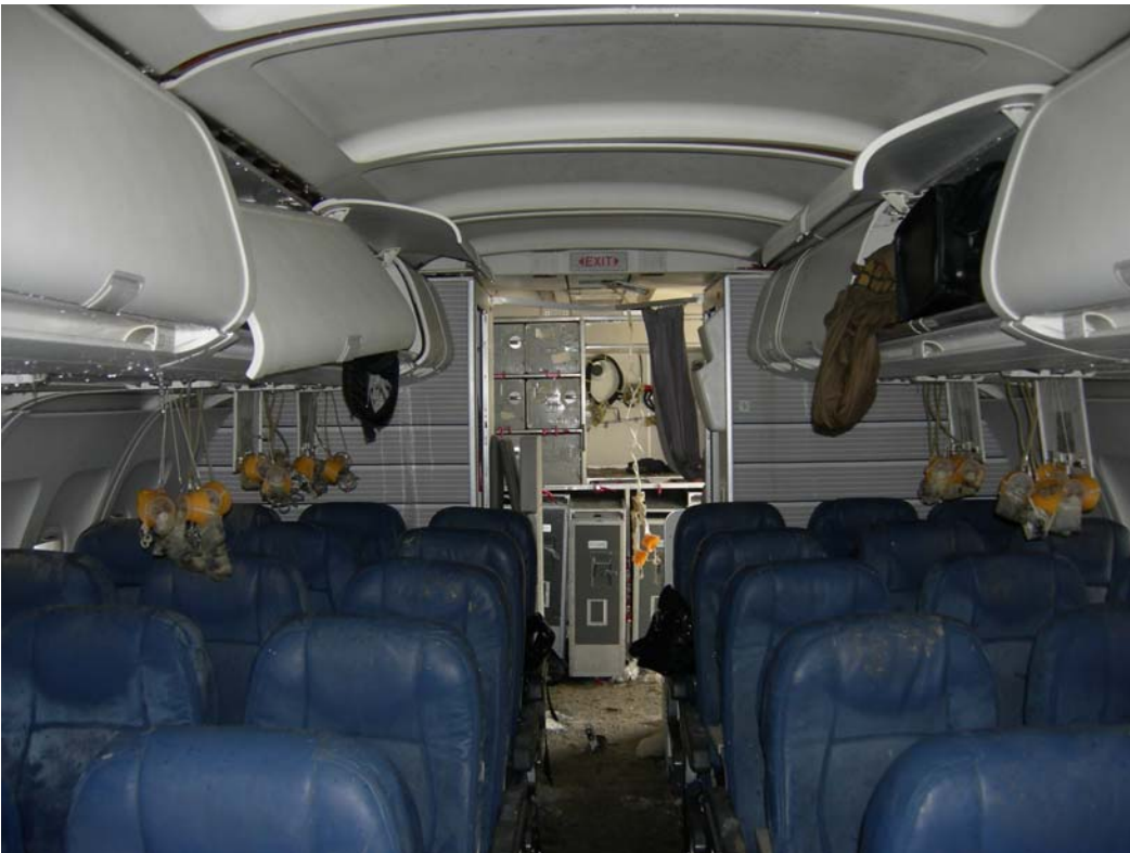
Photo 40. Aft cabin and galley (Note: "direct view" jumpseat had been stowed by investigators prior to this picture)