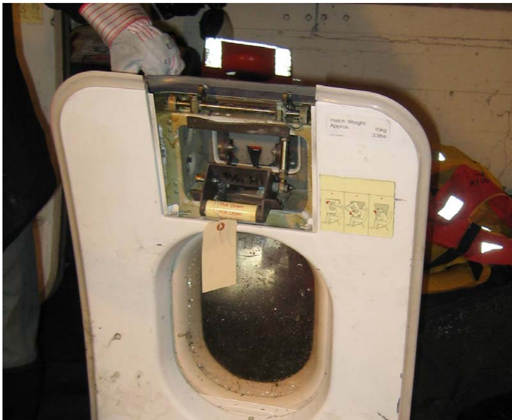
Photo 66. One of the right side over wing exits and instruction placard