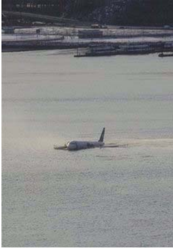
Photo 1. Photograph taken shortly after the exits had been opened (Note: Door 1L is open but the slide/raft is not yet deployed)