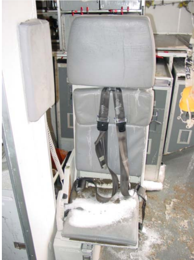
Photo 41. Position of “direct view” jumpseat as found by investigators