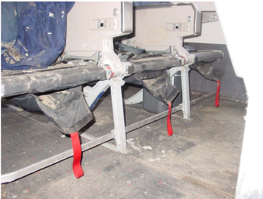
Photo 54. Life vest storage pouches beneath economy class passenger seats