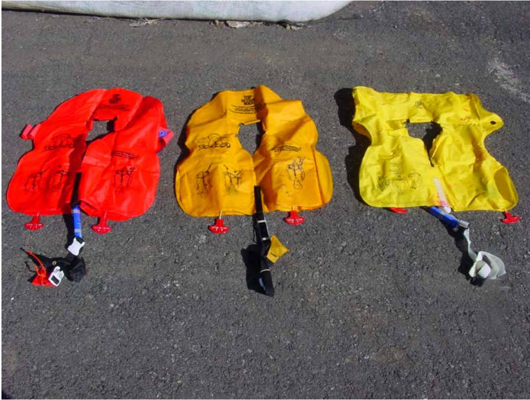
Photo 53. Crew life vest (left) and the two models of passenger life vests from N106US