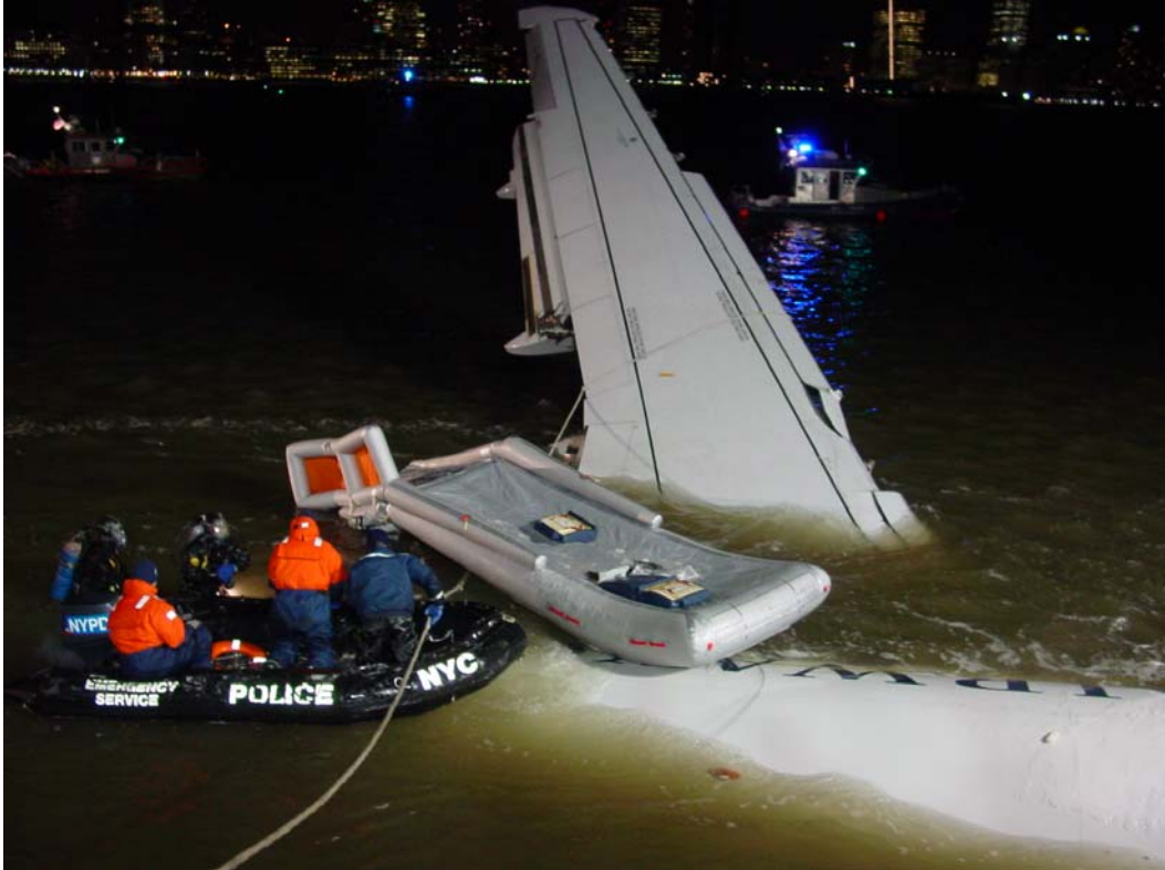
Photo 18. Condition of the airplane and left offwing slide when NTSB investigators arrived on the evening of January 15th