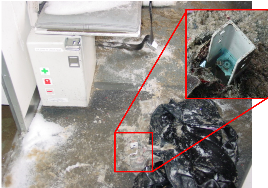
Photo 42. Location where vertical beam 65 penetrated the floor of the cabin