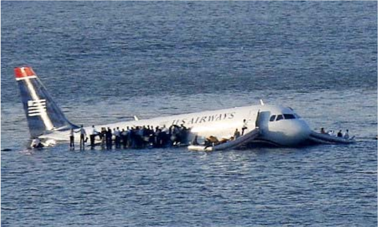
Photo 5. Passengers on the right wing and in the slide/rafts prior to arrival of the ferries