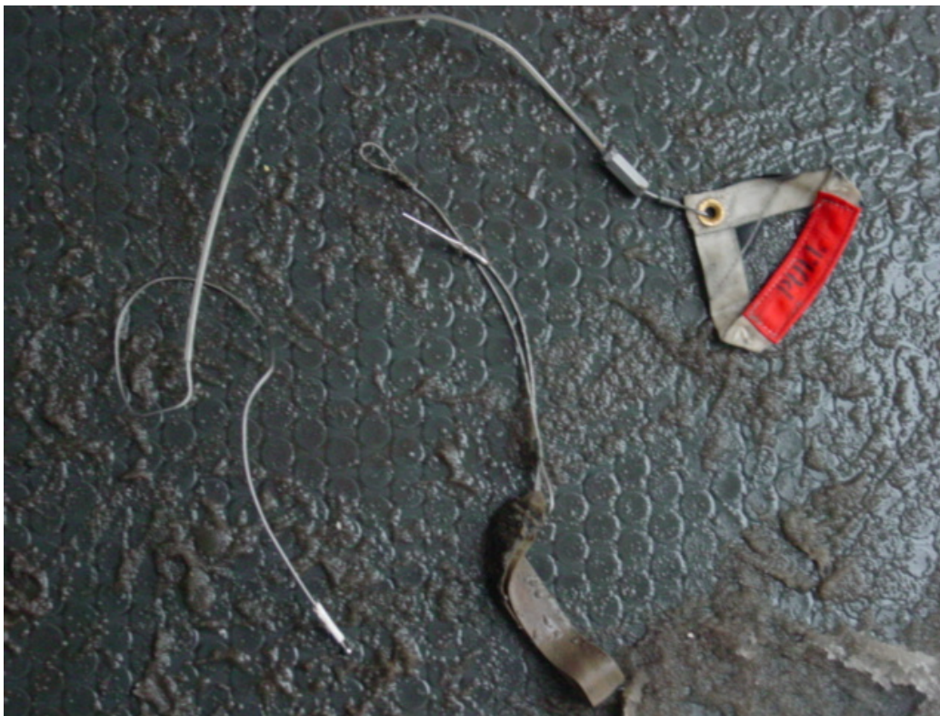
Photo 25. Manual inflation lanyard and ditching release handle found on the floor in the forward galley