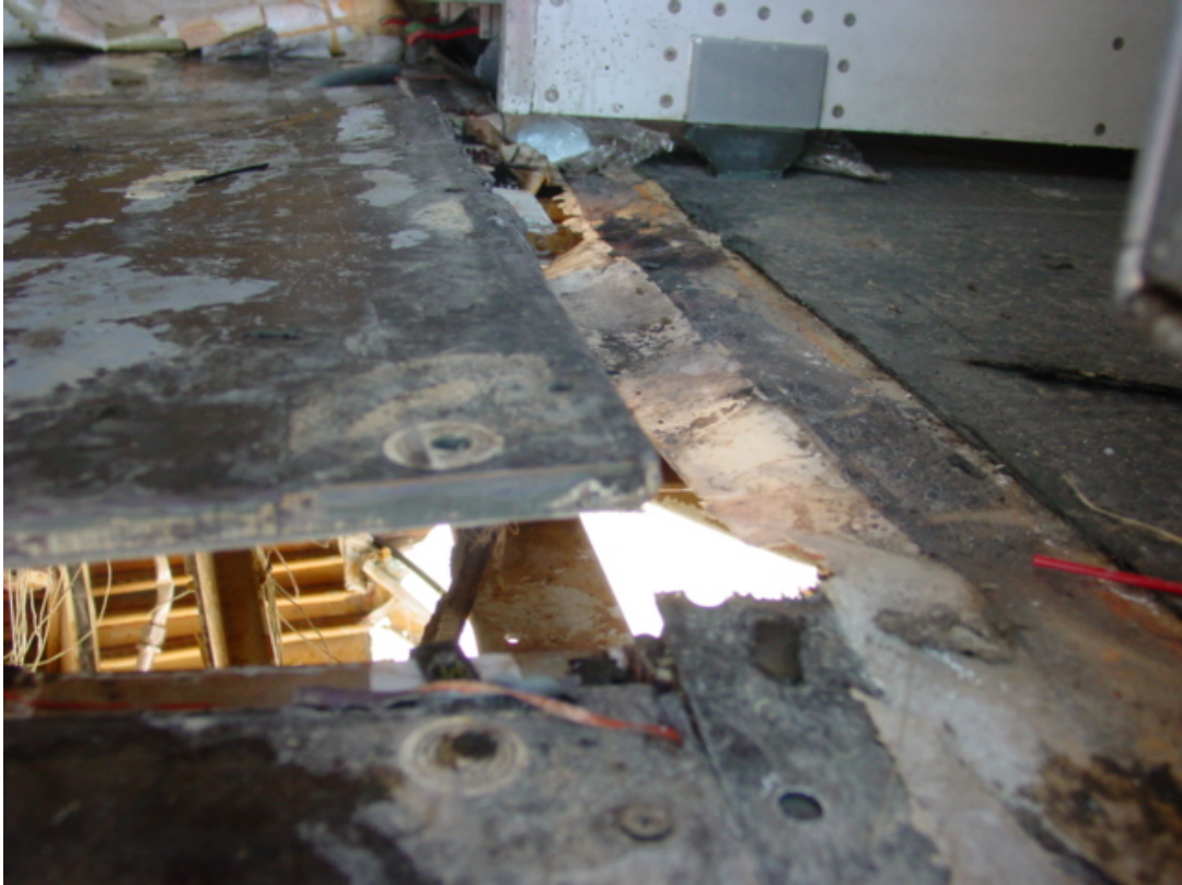
Photo 51. Damage to the center floor panel of the aft galley and surrounding area