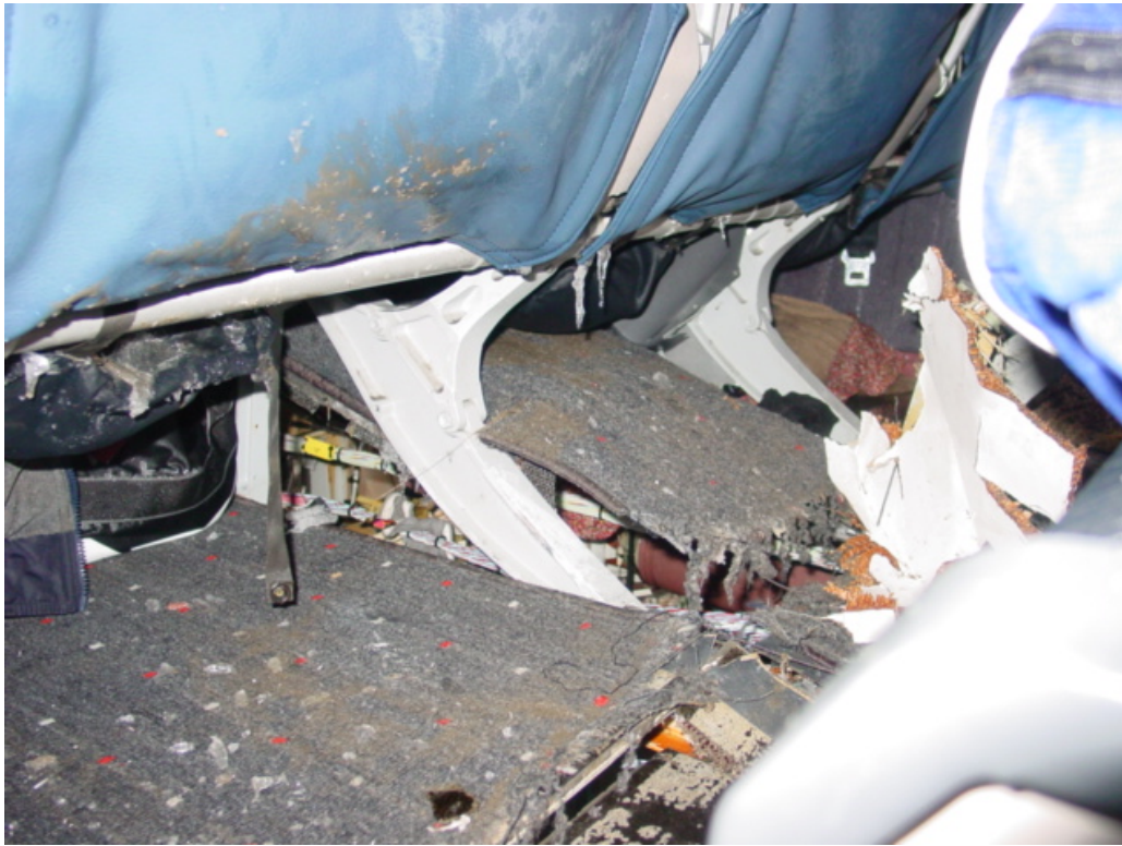
Photo 35. View of the floor damage beneath seat 22E (viewed from row 23 DEF)