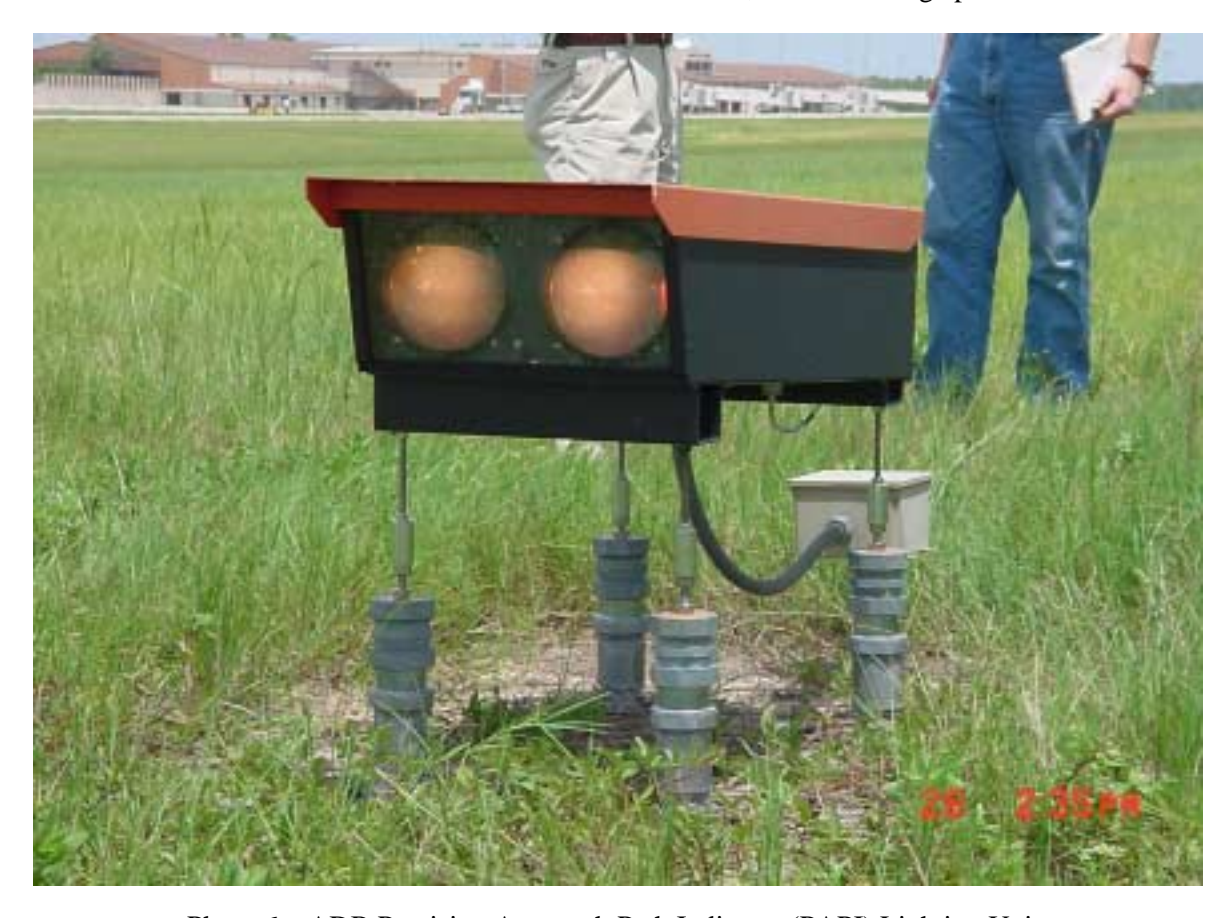
Photo 6: ADB Precision Approach Path Indicator (PAPI) Lighting Unit.