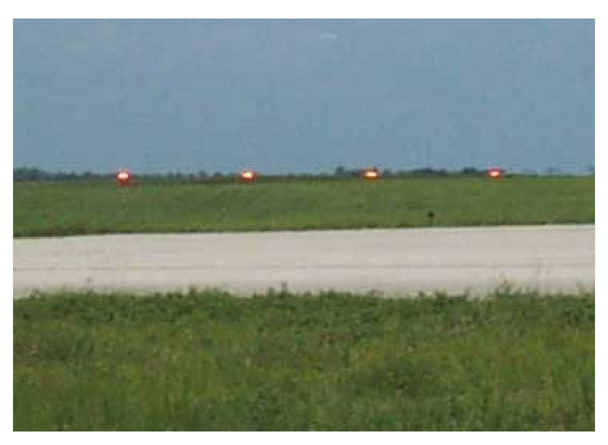
Photo 7: Four-unit ADB PAPI lighting system for runway 9, as viewed from taxiway 'M', looking east.