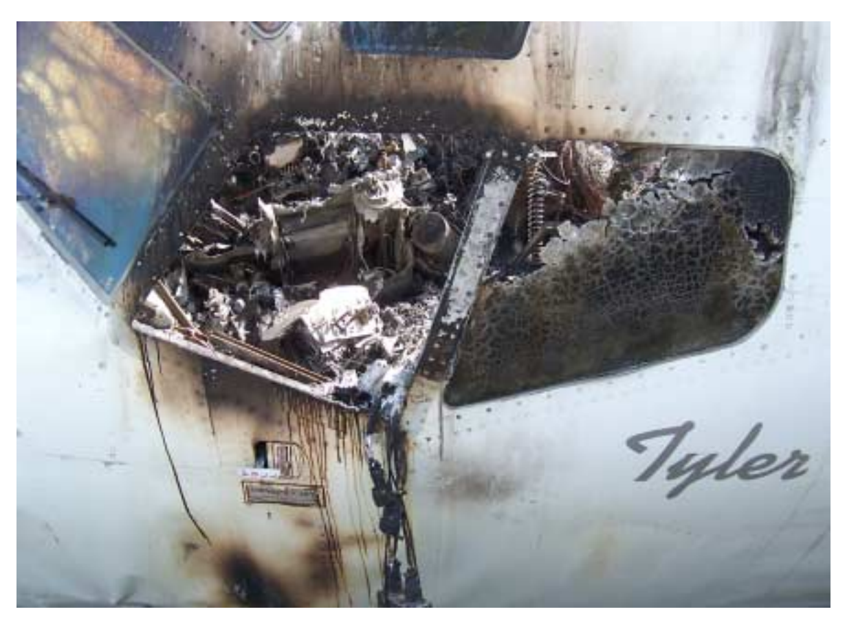
Photo 1: Left cockpit sliding window and exterior operation handle.