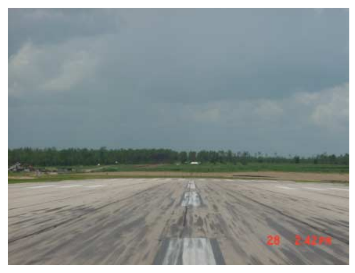
Photo 8: Approach to runway 9, as viewed from intersection point of runway 9 centerline and PAPI lighting system, looking east (accident wreckage at left-center of picture).