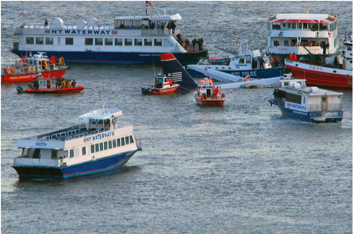
2. Close up photograph of the ferries and marine vessels that responded to US Airways flight 1549 on January 15, 2009.