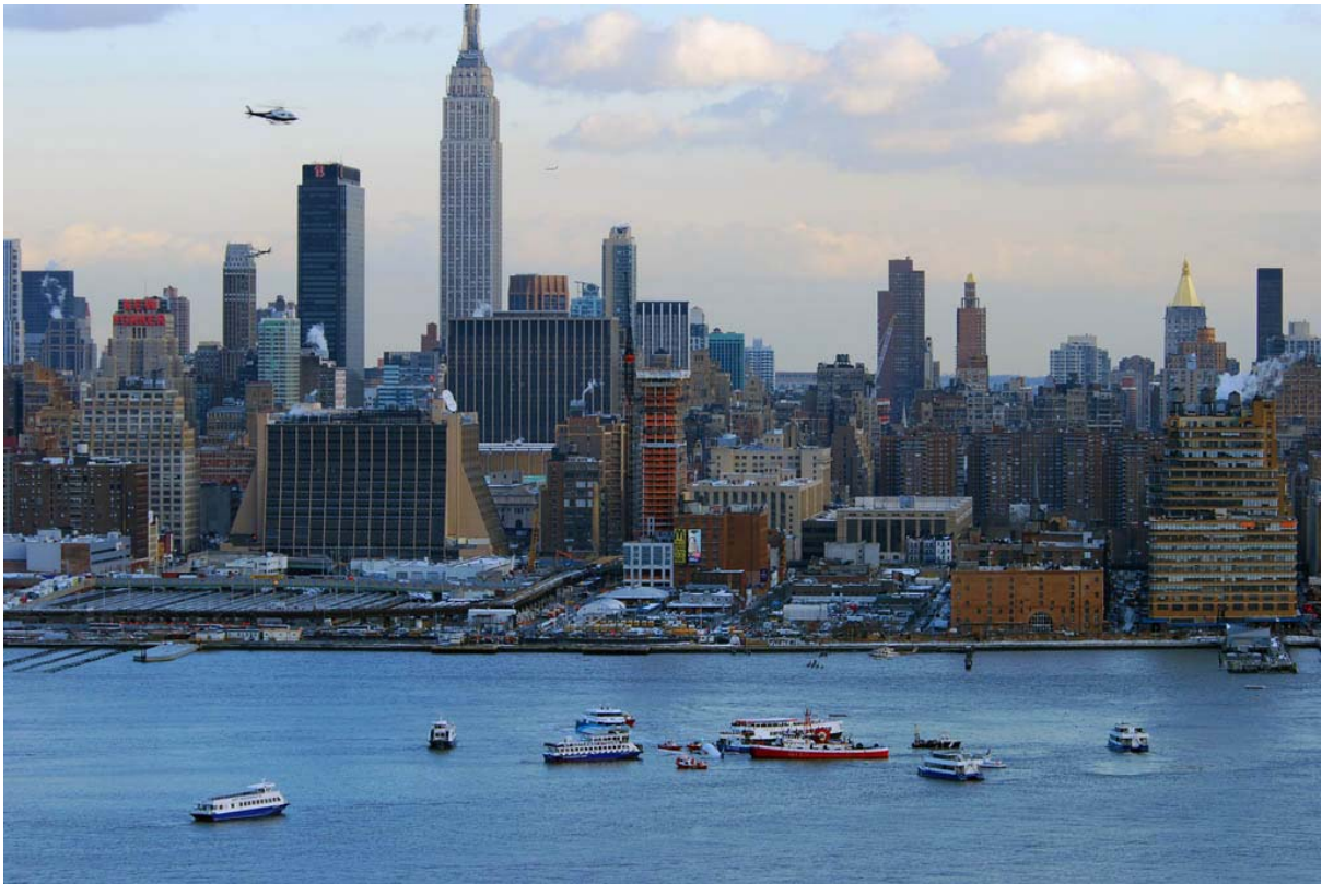
1. Photograph of the New York Water Ways (NY WW) ferries and Fire Department New York (FDNY) responding to US Airways flight 1549.