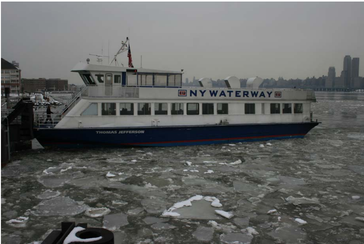
3. Photograph of NY WW's ferry vessel, Thomas Jefferson , taken on January 17, 2009, at a NY WW Port Imperial terminal pier.