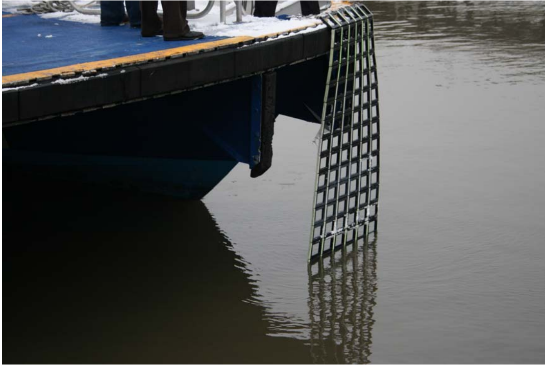
5. Photograph of a Jacob's ladder extended from a NY WW ferry vessel. Note: This ladder is the same as was used by the crew on the Moira Smith and Athena to rescue the occupants from US Airways flight 1549.