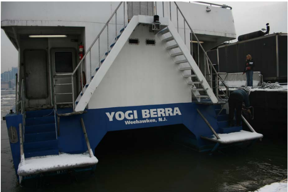
4. View of the Stern of NYWW ferry " Yogi Berra "