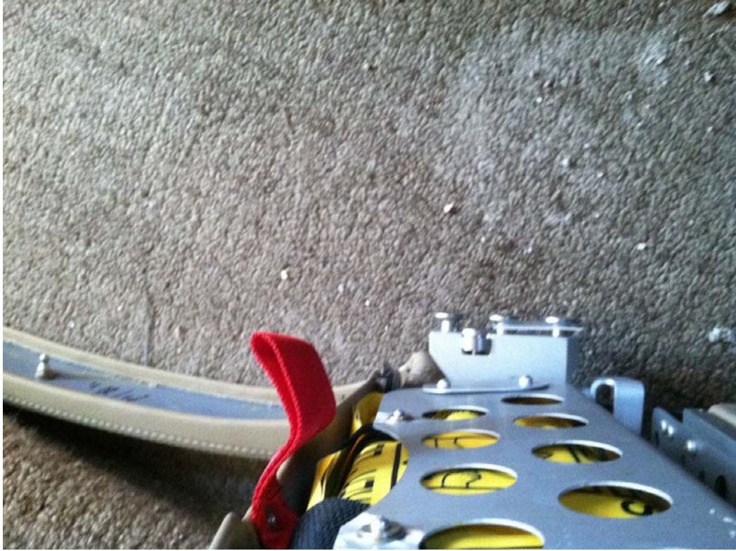
Photo 20: Seat L/H #2 seat fitting (photo taken by HMS staff during on scene investigation).