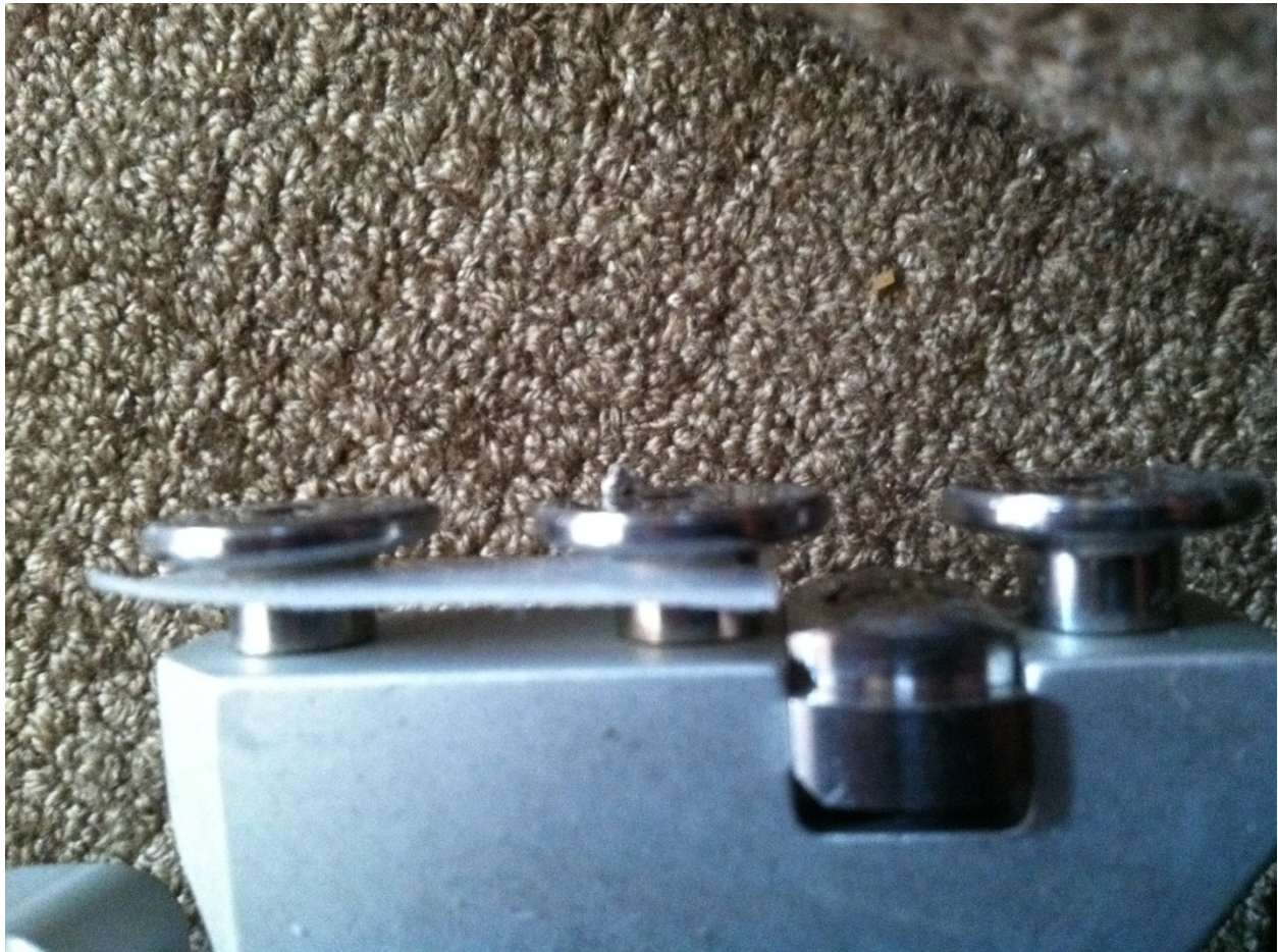
Photo 19: Seat L/H #2 seat fitting.