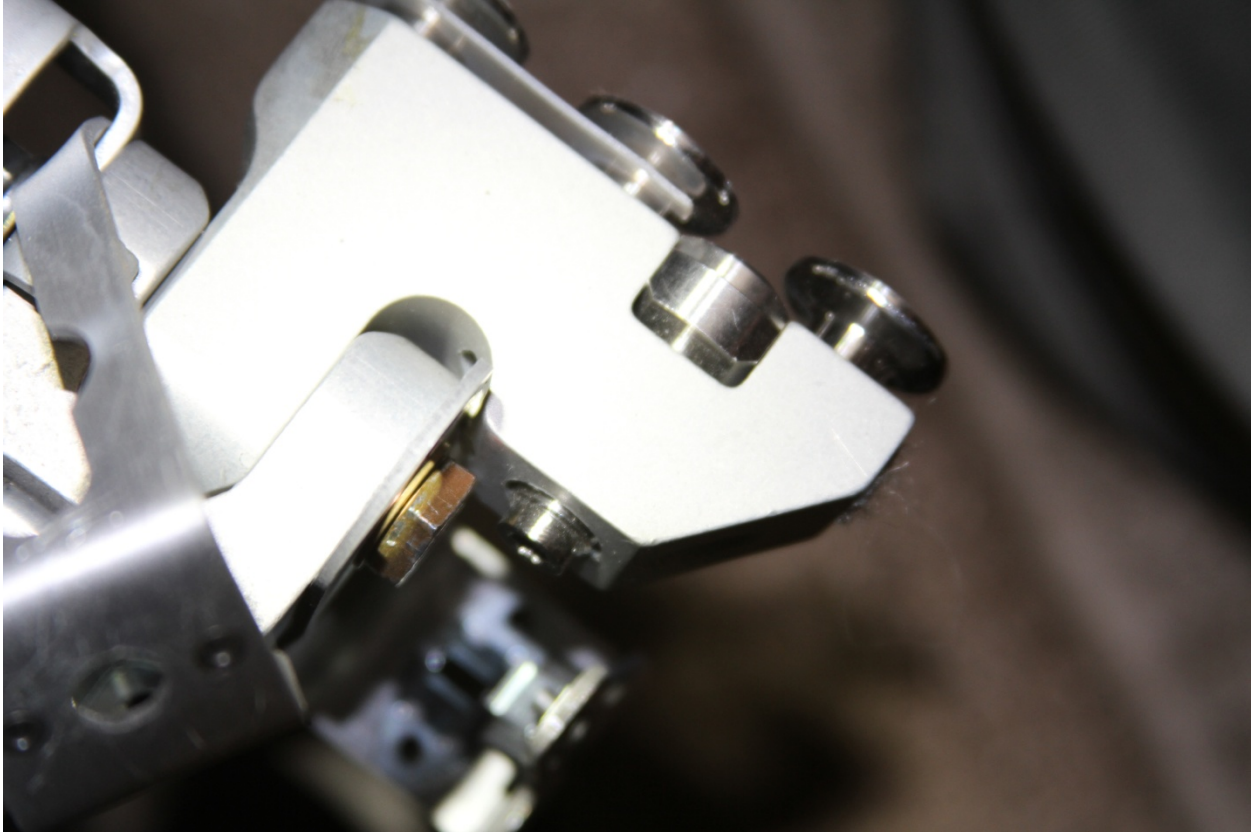
Photo 5: L/H #2 seat fitting (photo taken by NTSB investigator during on scene investigation).