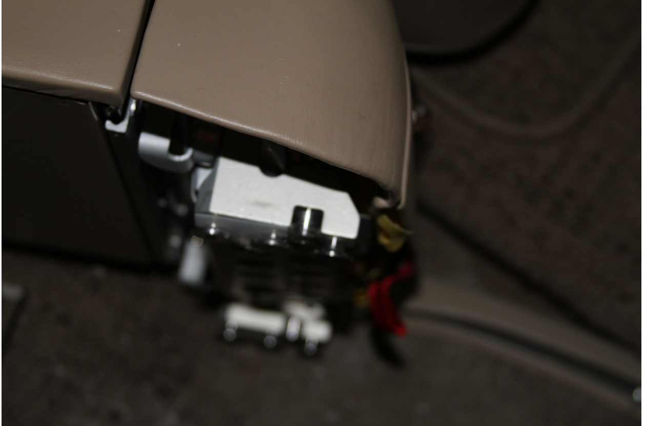
Photo 4: L/H #2 seat fitting (photo taken by NTSB investigator during on scene investigation).