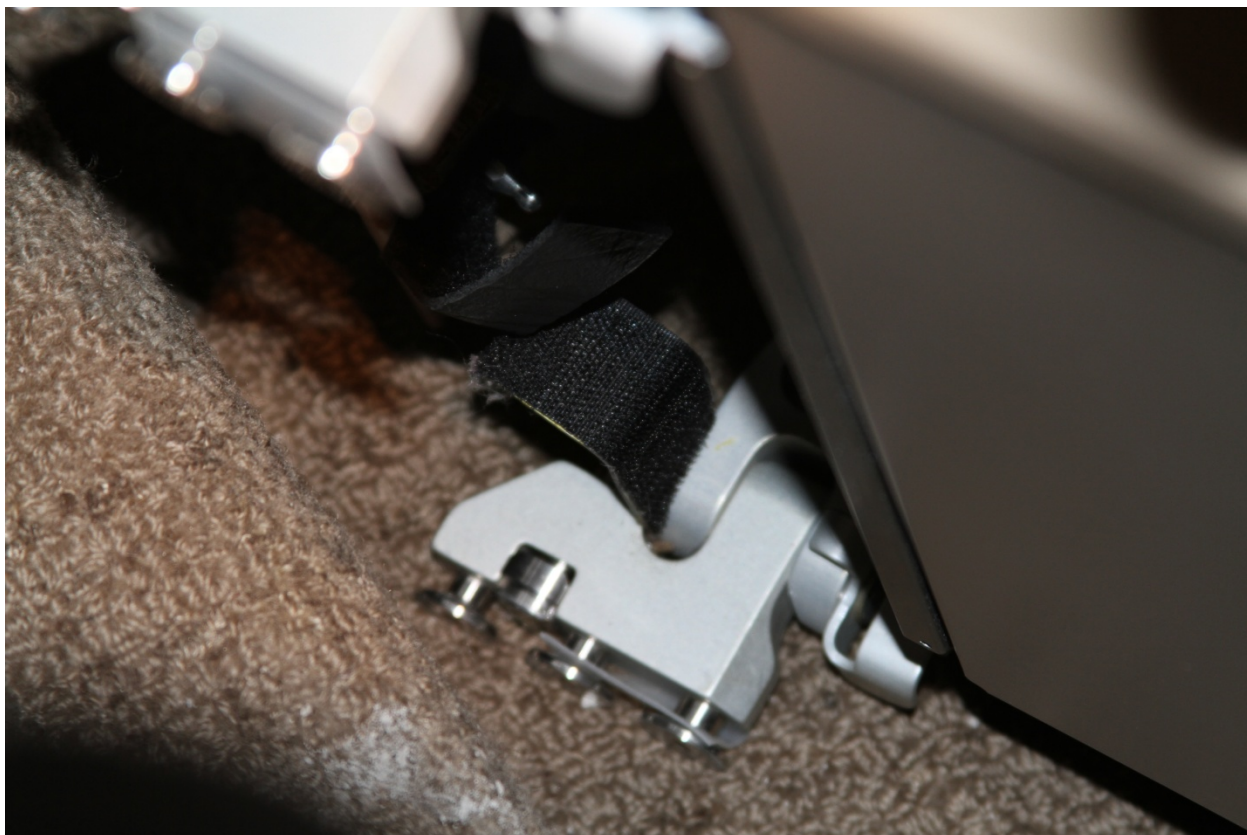
Photo 2: L/H #2 seat fitting (photo taken by NTSB investigator during on scene investigation).