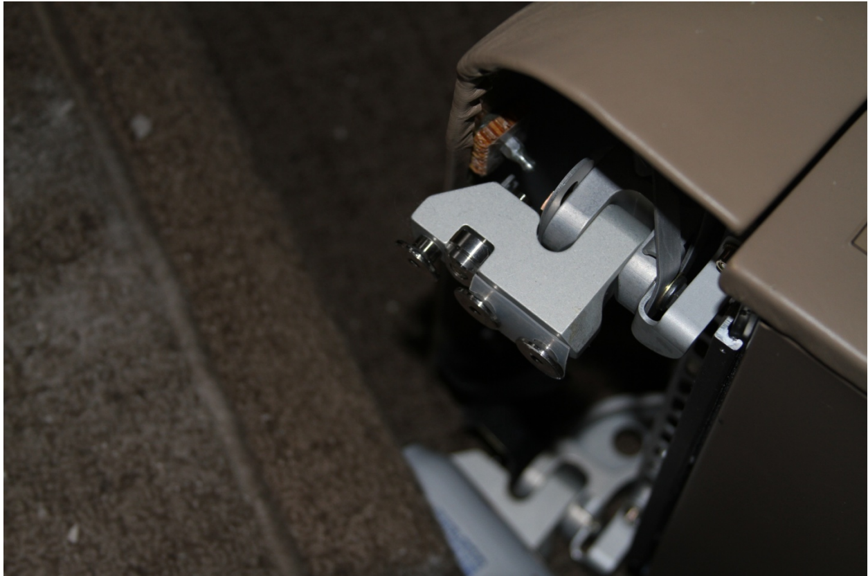
Photo 3: L/H #2 seat fitting.