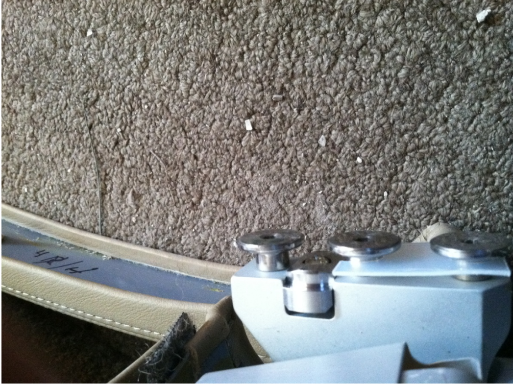
Photo 21: Seat L/H #2 seat fitting (photo taken by HMS staff during on scene investigation).