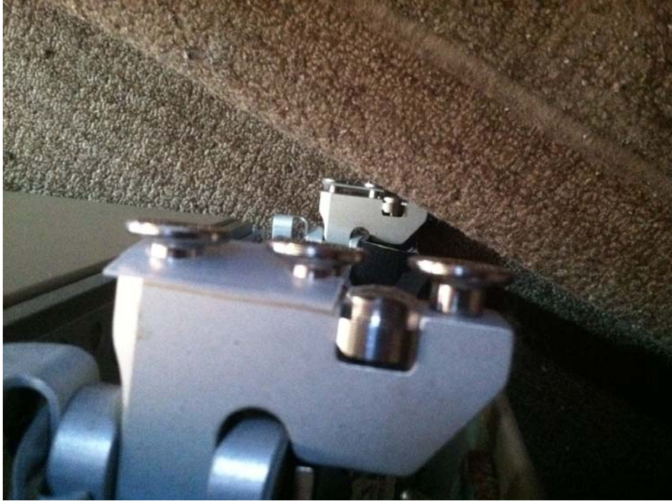
Photo 18: Seat L/H #2 seat fitting.