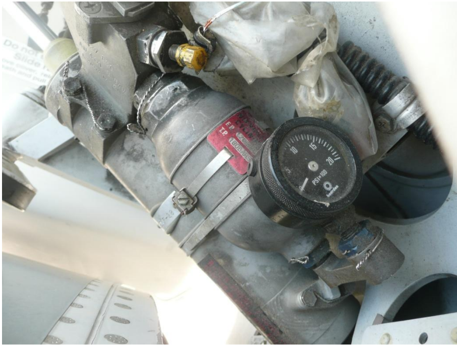
8. Photograph of the 1R power assist actuator gauge.