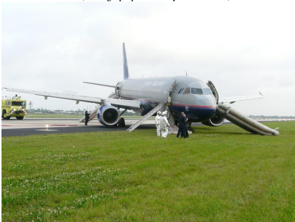
2. Photograph looking at the right side of N409UA. Note: The 1R slide/raft is hanging limp at the 1R exit, and an ARFF ladder is placed at the exit to provide access to the airplane.