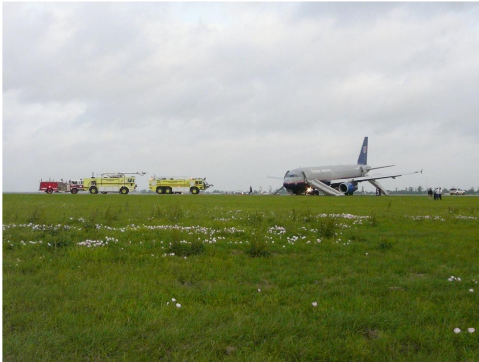
1. Photograph of UAL flight 497 in the grass on the left side of MSY Runway 19. Note: Slide/rafts 1L and 2L are deployed.