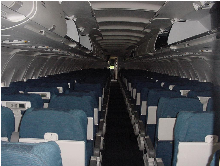
9. View of N409UA's cabin from the aft cabin looking forward.