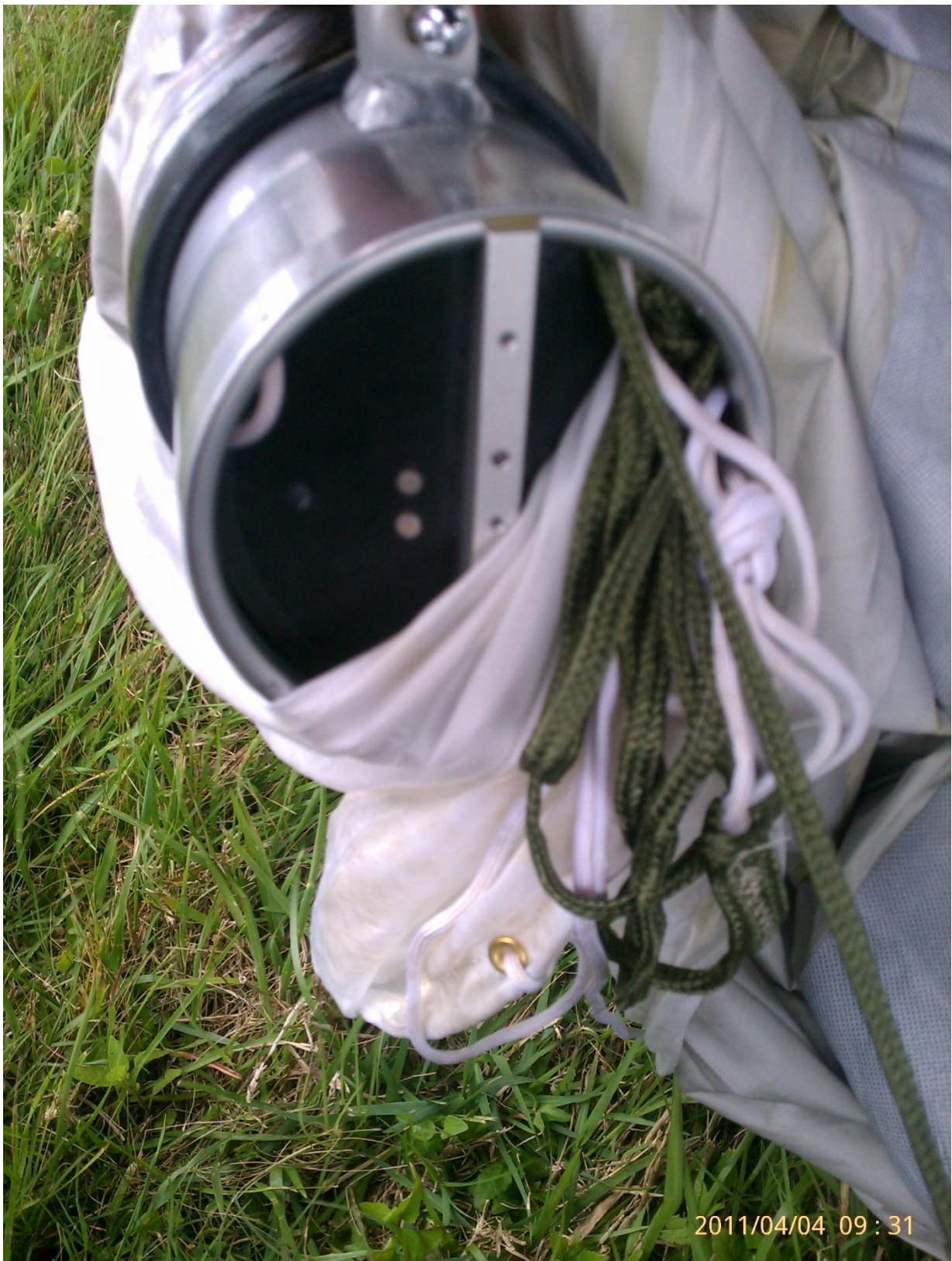
6. View of the 1R slide/raft's aft aspirator with the ingested sea anchor and sea anchor line