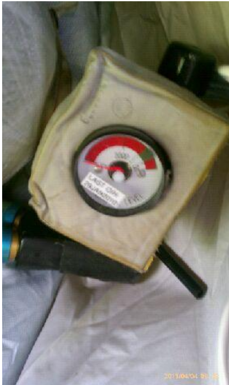
7. View of the 1R evacuation slide/raft inflation bottle pressure gauge.