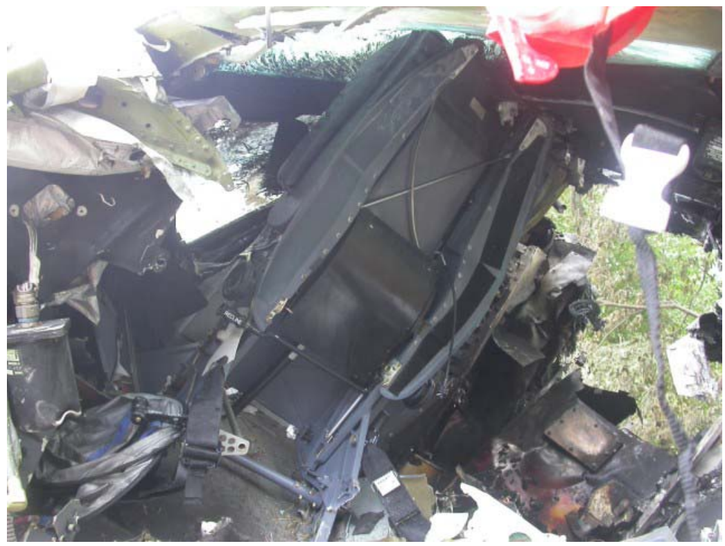
Photo 11. Portion of first officer's seat still attached to the cockpit floor structure