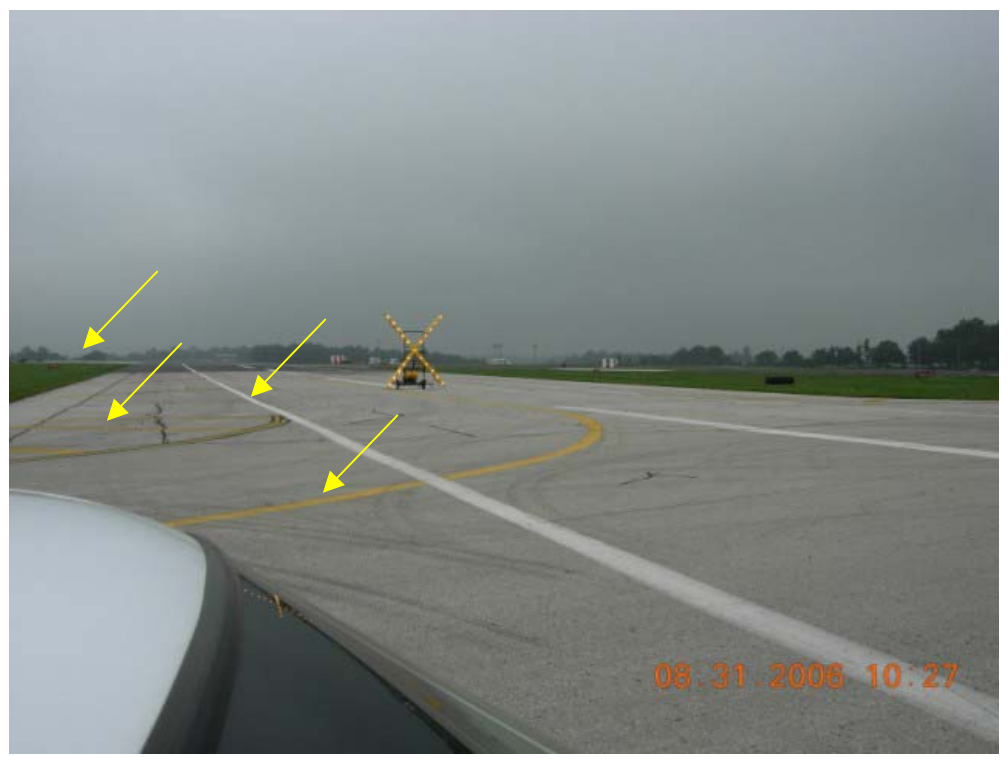
Photo 34. Runway 26 with the runway 4/22 intersection sign, lead-off line, white edge line, and yellow shoulder markings