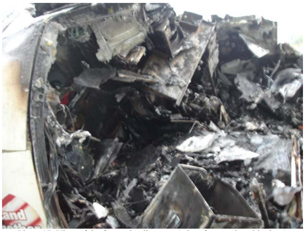
Photo 17. View of the forward galley area (taken from main cabin door)