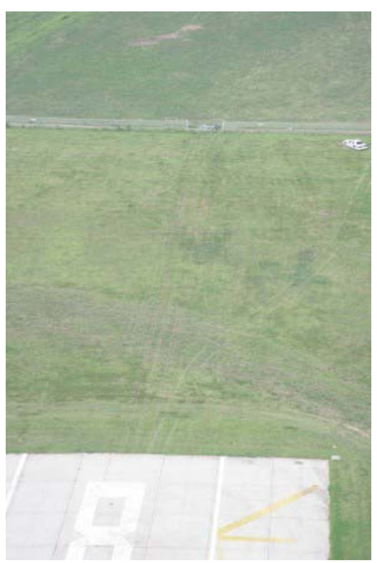
Photo 5. Aerial photo of the end of runway 26 and the damaged airport perimeter fence