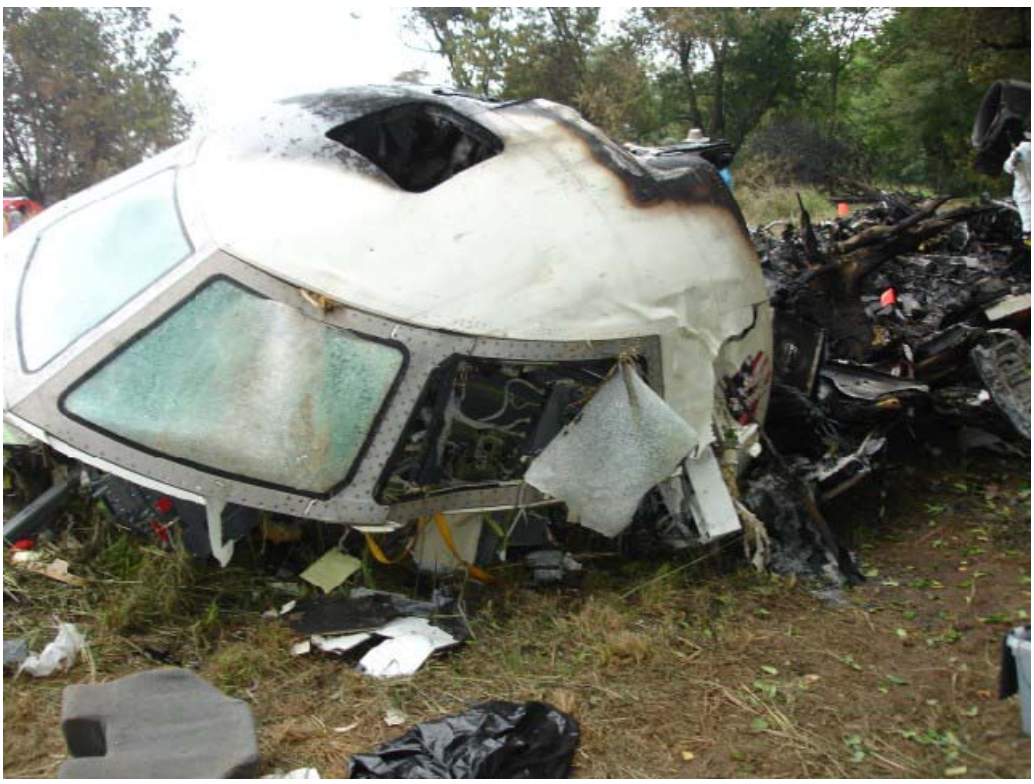
Photo 16. Cockpit damage and left side of the fuselage (note: main cabin door has been removed)