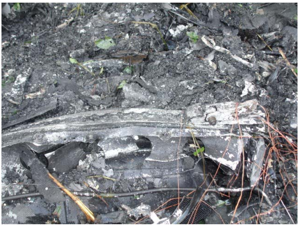
Photo 22. A section of floor track with a fractured aft seat attachment fitting