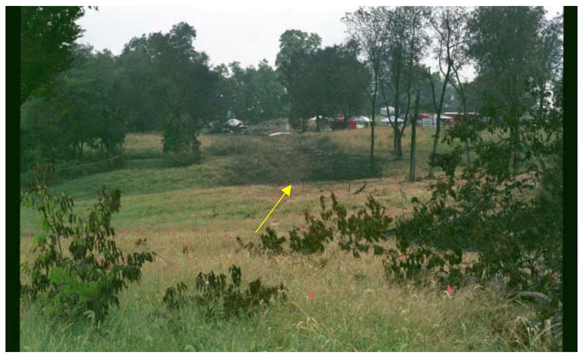
Photo 7. Area of initial impact with the ground