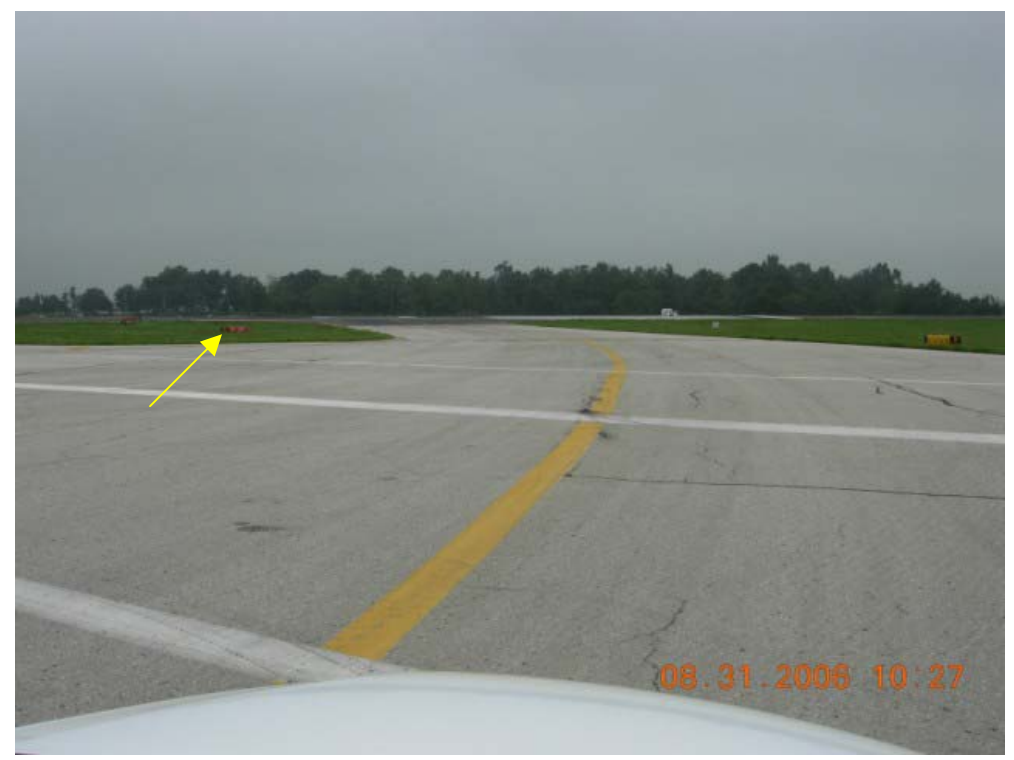
Photo 31. T/W A and T/W A holding position sign for runway 22 as viewed from the taxiway lead-in line prior to crossing runway 26