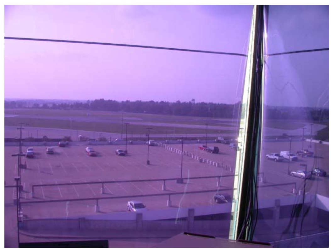
Photo 25. View from the ATCT of the runway 8/26 intersection with old T/Ws A and A5