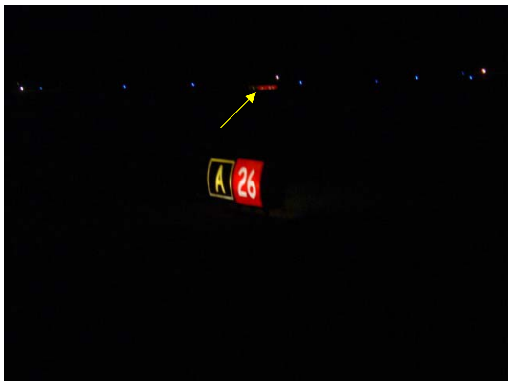
Photo 29. T/W A holding position sign for runway 26 as viewed from a 15-passenger van during the night taxi examination (Note: in the distance is the T/W A holding position sign for runway 22)