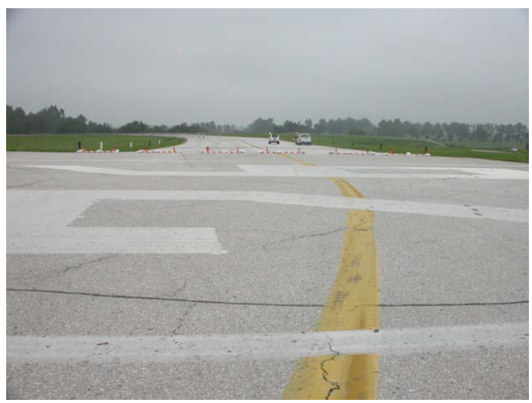
Photo 30. Old T/W A with lead-in line and low-profile lighted barricades