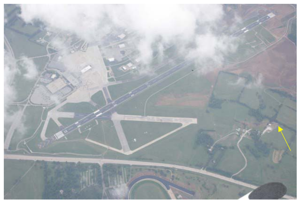
Photo 1. High altitude photograph of LEX and the crash site