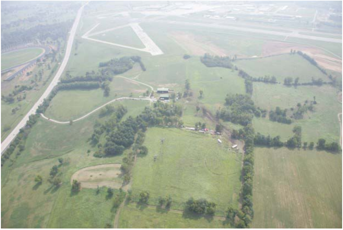
Photo 2. Aerial photograph of runway 8/26 and the crash site