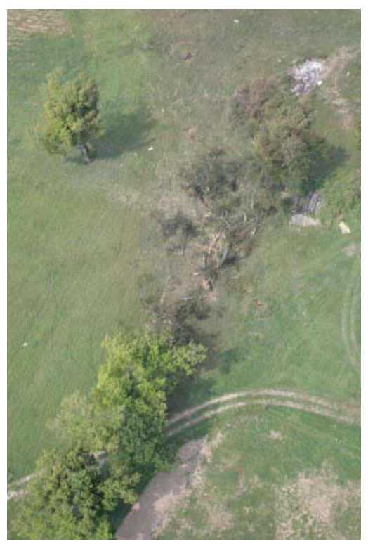
Photo 6. Area of initial tree strikes beyond airport perimeter fence