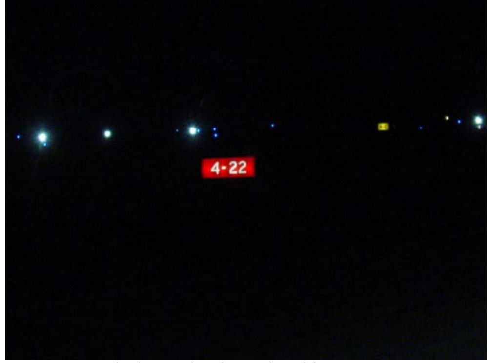
Photo 36. Runway 4/22 intersection sign as viewed from a 15-passenger van on the runway 26 centerline during the night taxi examination