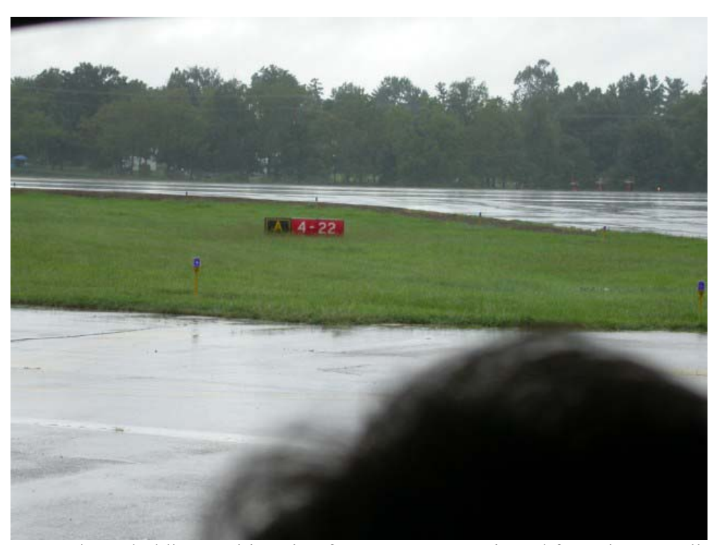
Photo 32. T/W A holding position sign for runway 22 as viewed from the centerline of runway 26