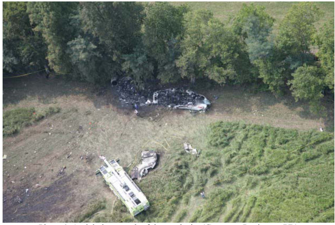
Photo 4. Aerial photograph of the crash site