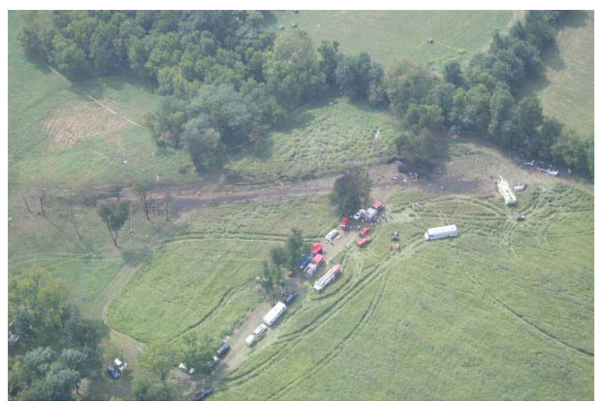
Photo 3. Aerial photograph of the crash site