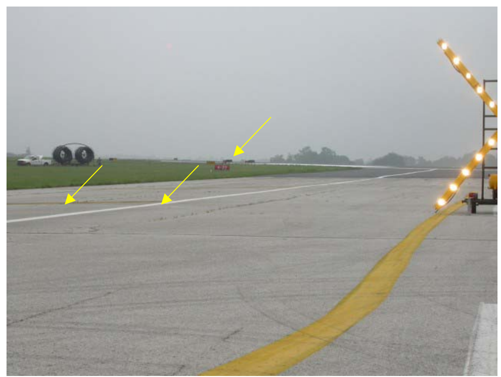
Photo 35. Runway 26 with the runway 4/22 intersection sign, lead-off line, white edge line, and yellow shoulder markings