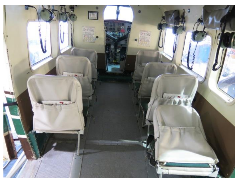
Photograph 3 - Photograph of interior cabin standing aft looking forward toward the cockpit. R4 seat bent forward. Headsets stowed.