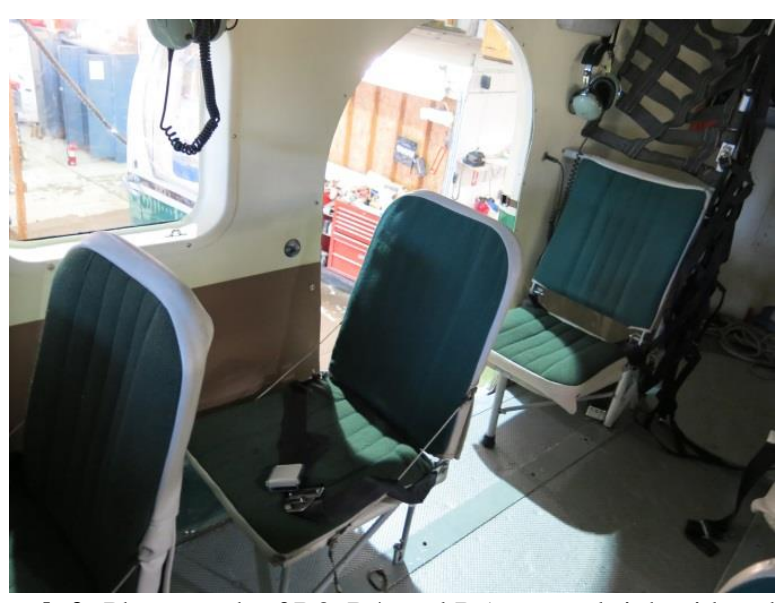
Photograph 2- Photograph of R3, R4, and R5 seat and right side cabin door.