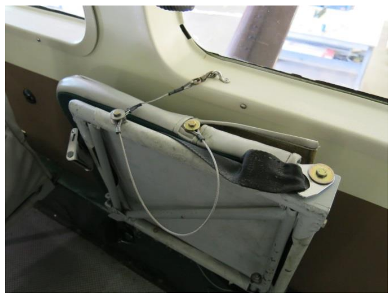
Photograph 9- Photograph of stowed cabin interior seat with wired cable.