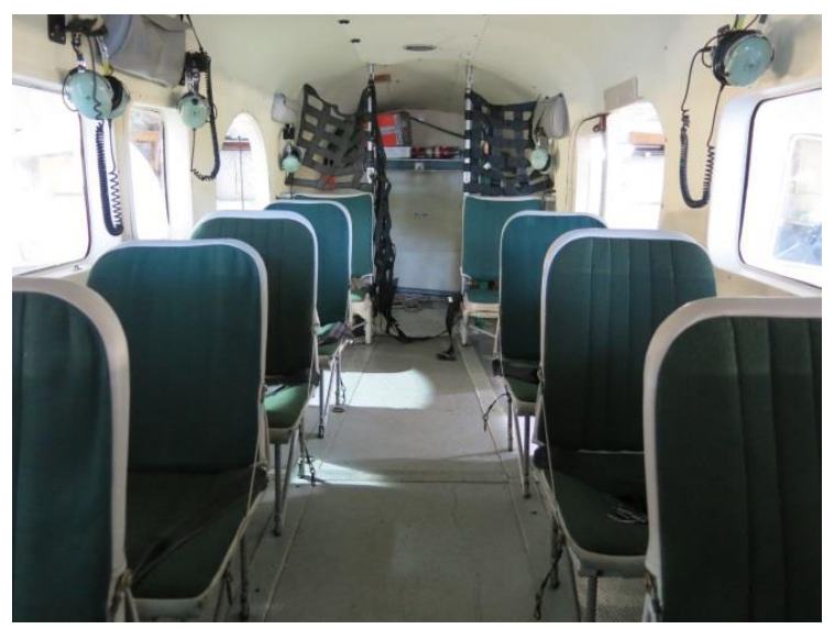
Photograph 1- Photograph of interior cabin standing at the cockpit looking aft.

Promech Air, LLC was conducting routine maintenance on an airplane similar to the accident airplane. The group visited their facility on August 18, 2015. The following are photographs taken from the exemplar airplane.