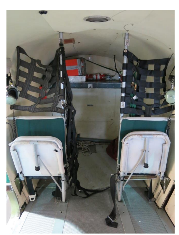
Photograph 4- Photograph of stowed seats R5 and L5 and cargo stowage.