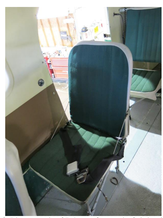
Photograph 6 - Photograph of R4 seat forward of right side cabin door.