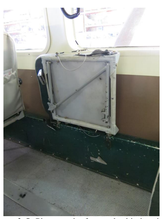
Photograph 8- Photograph of stowed cabin interior seat.