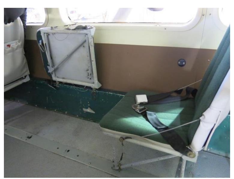
Photograph 10 - Photograph of stowed cabin interior seat and a cabin interior seat in its downward and locked position.