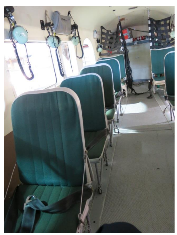
Photograph 7 - Photograph of right side cabin interior seats standing forward looking aft toward cargo stowage.