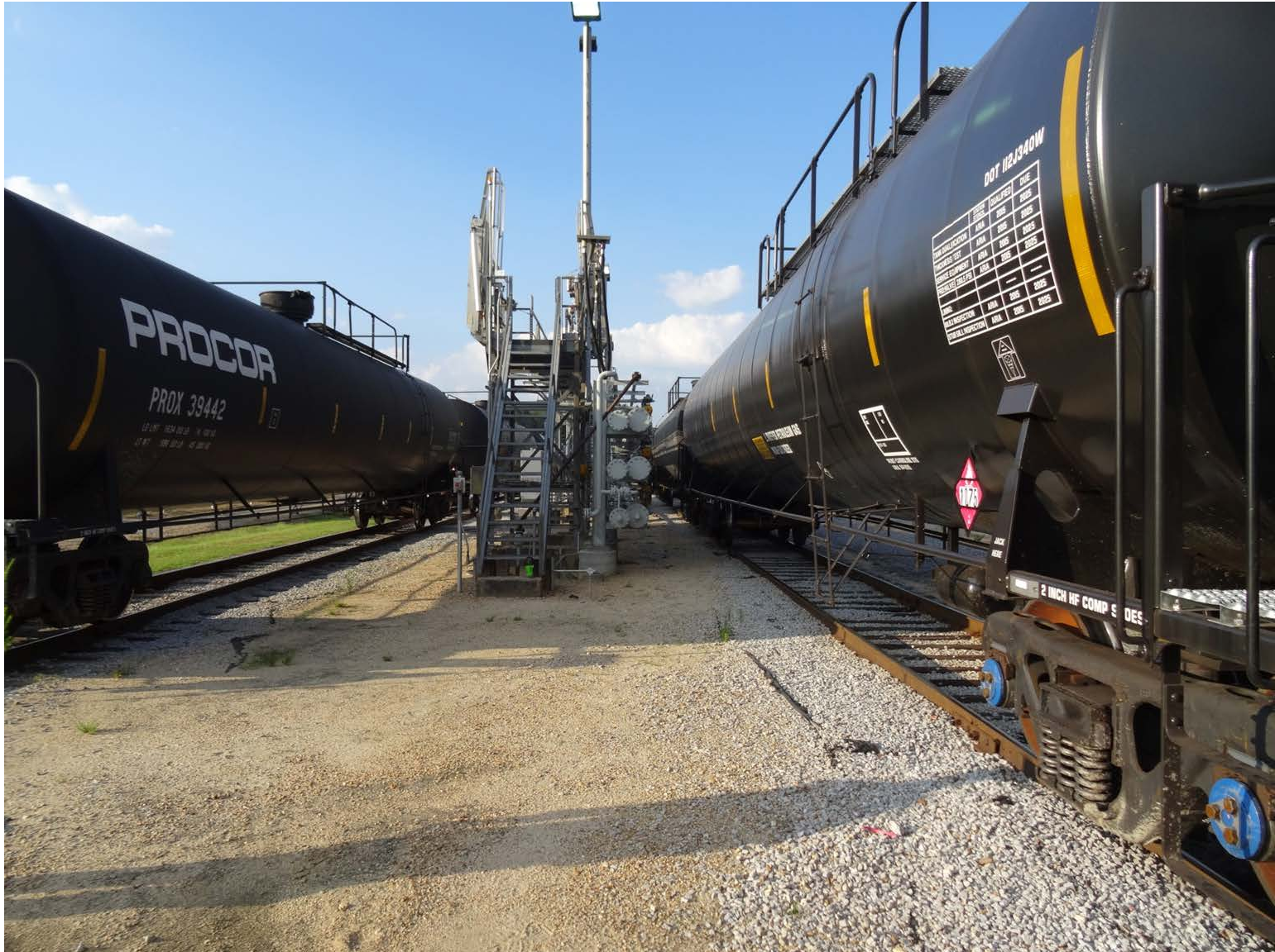
Photo facing south, showing two tracks separated by pipe rack