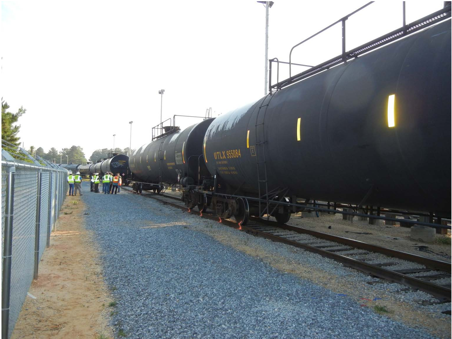
Photo facing north, accident occurred where the cars are separated, adjacent to group of people in photo. Note location of wheels are marked where they came to rest following the accident.