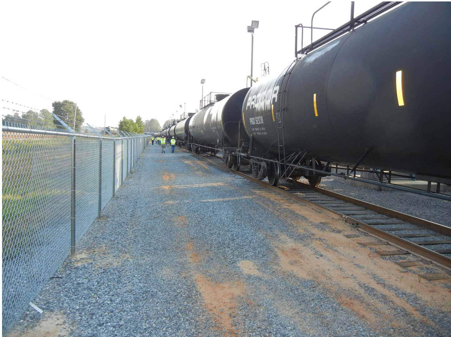
Photo facing north approaching the accident location from the roadbed, east of the east track.