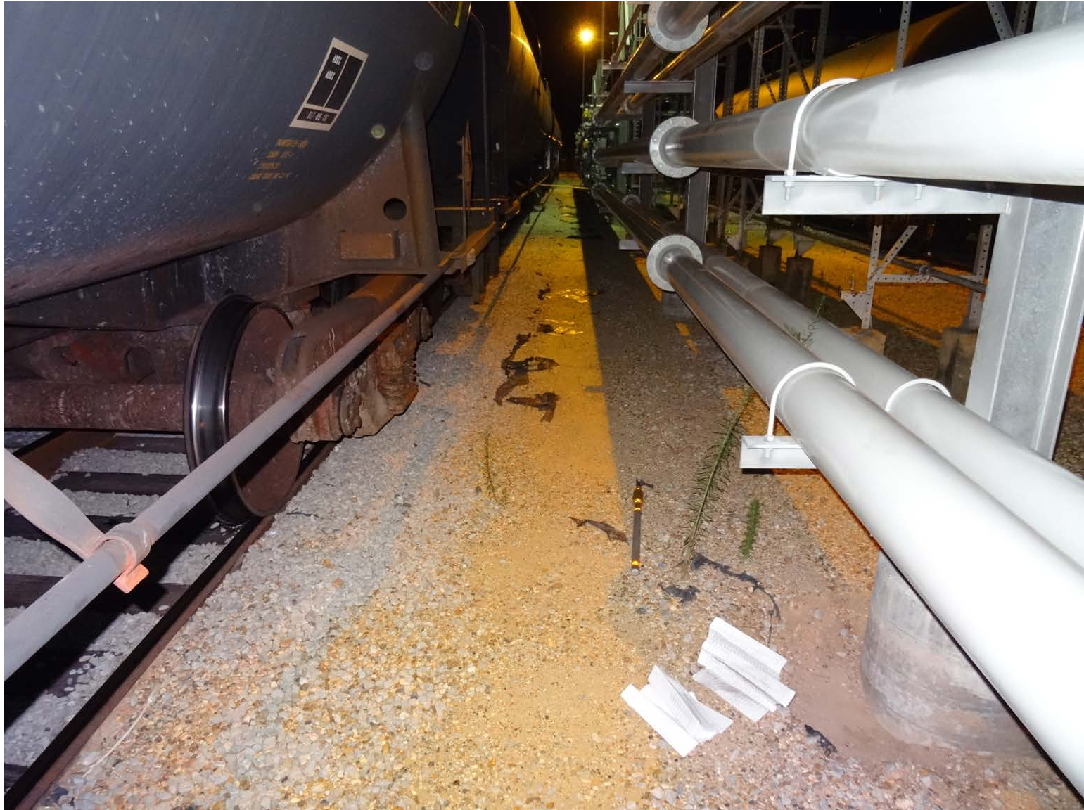
Photo facing north between the east track and the pipe rack. Note a brake stick and train documentation on the ground.