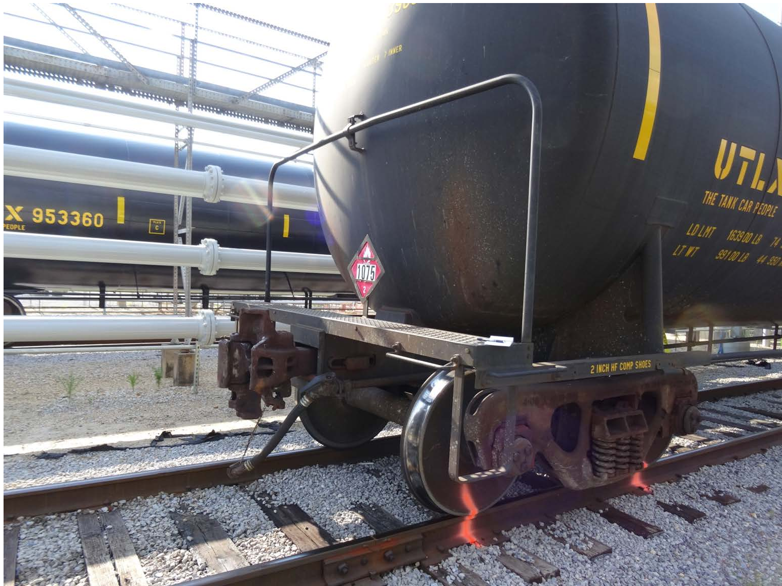
A-end of Car Number UTLX-953966, employee was found in this location.