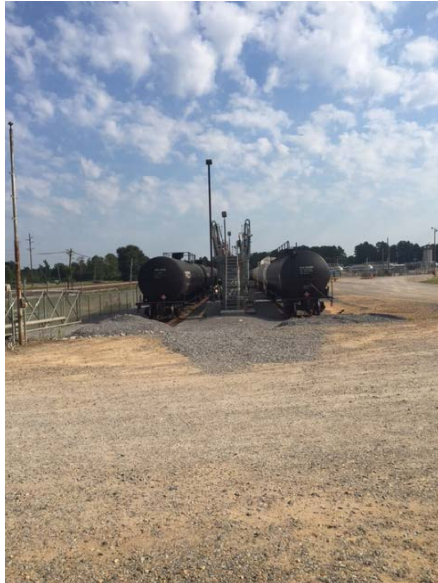
Photo facing north toward the end of the tracks.