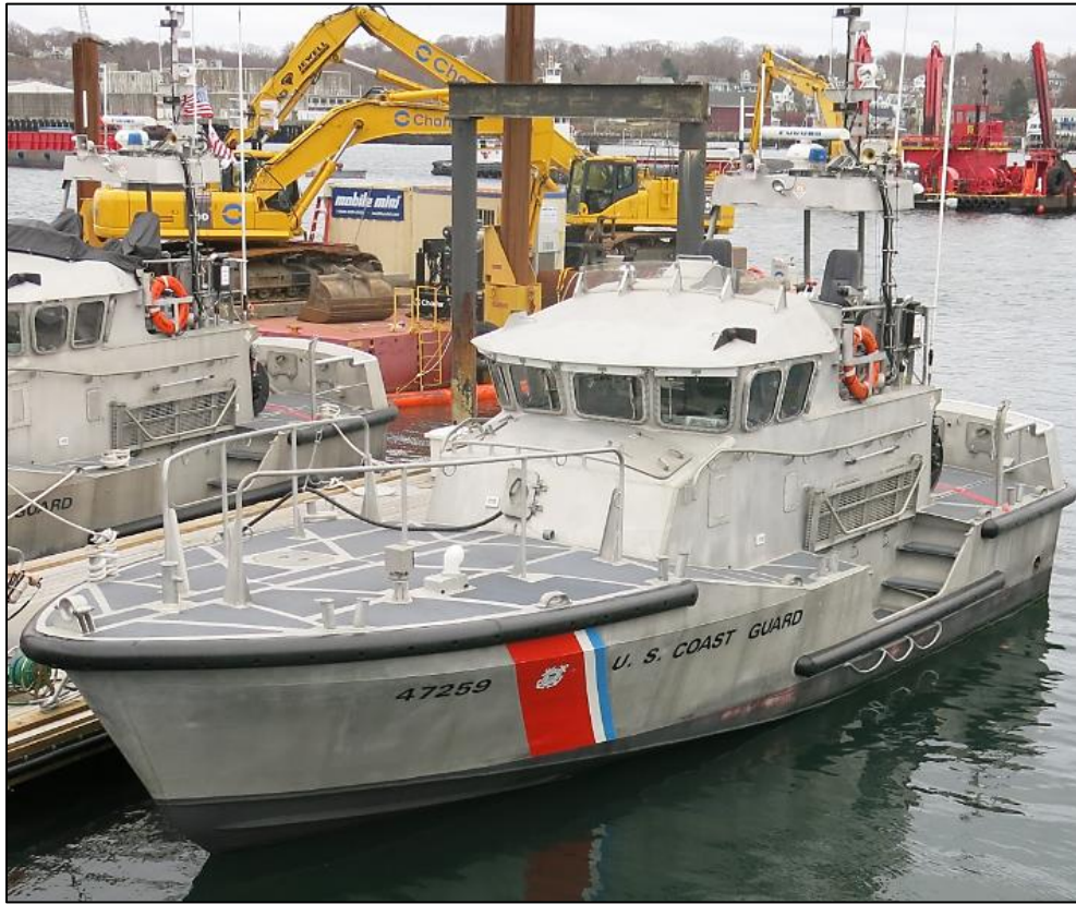
Motor lifeboat 47259 in Gloucester Harbor.

The Foxy Lady continued to keep the Orin C under tow while the motor lifeboat stood by providing instructions for operating the dewatering pump. However, because the Orin C was getting heavier with flooding water and the tow line rigged between the fishing vessels was ineffective, the motor lifeboat made preparations to take over the tow. The Foxy Lady tow line was disconnected from the Orin C , and the Coast Guard vessel moved in to pass a tow line to the stricken fishing boat. At 1810, Coast Guard Sector Boston was informed that the motor lifeboat had the Orin C under tow in 10-foot seas and south-southwesterly winds above 30 knots. Once freed from towing, the Foxy Lady was cleared to depart and headed back to Gloucester.