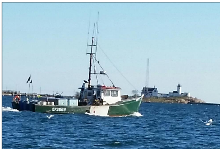
Orin C on the day the vessel departed Gloucester, Massachusetts, December 1, 2015.

On December 3, 2015, at 2018 local time, the commercial fishing vessel Orin C sank in the Atlantic Ocean about 13 miles east of Cape Ann, Massachusetts. All three crewmembers abandoned the vessel just prior to the sinking and were recovered by US Coast Guard motor lifeboat 47259. However, the captain of the Orin C became unconscious in the water before being pulled to the motor lifeboat by a Coast Guard crewman. When examined aboard the motor lifeboat, the captain had no pulse. In response, Coast Guard crewmembers performed CPR, but he could not be revived. There were no other injuries and no reports of pollution. The Orin C sank in about 300 feet of water and was not salvaged.