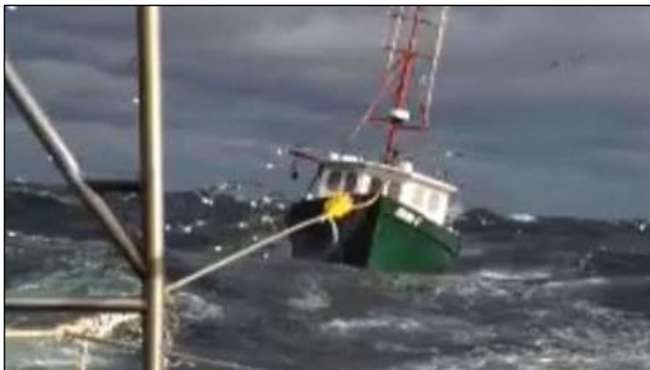
Photo of the Orin C taken at 1324 from the aft deck of the Foxy Lady .

With the Orin C on battery power, the vessel could communicate by VHF radio in low power only. Therefore, the Foxy Lady was tasked with relaying situation updates to the Coast Guard. As directed by Coast Guard Sector Boston, the Foxy Lady checked in every hour with a report on the status of the tow and the vessels' positions.