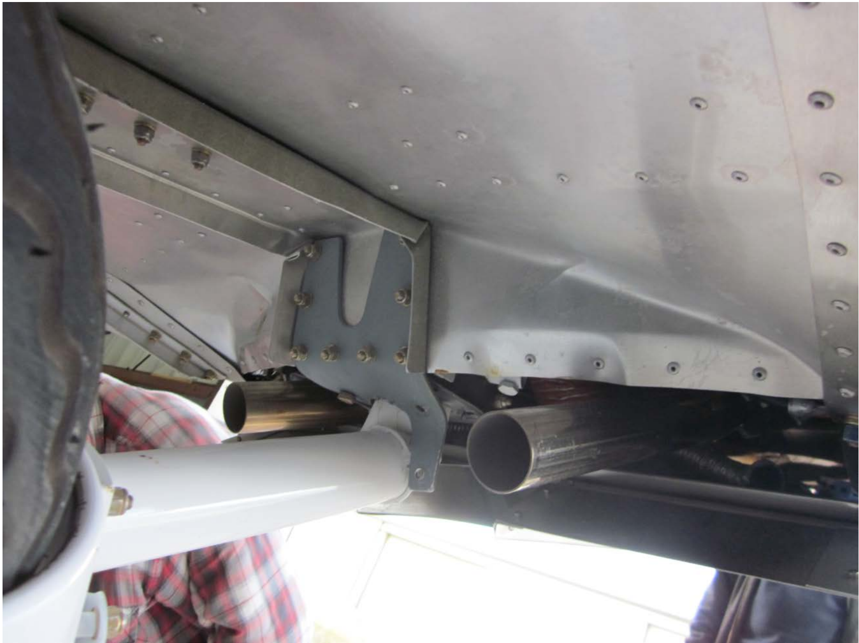
Photo 2 - Nose landing gear folded the “U” channel is supposed to be strait not a 90 degree bend