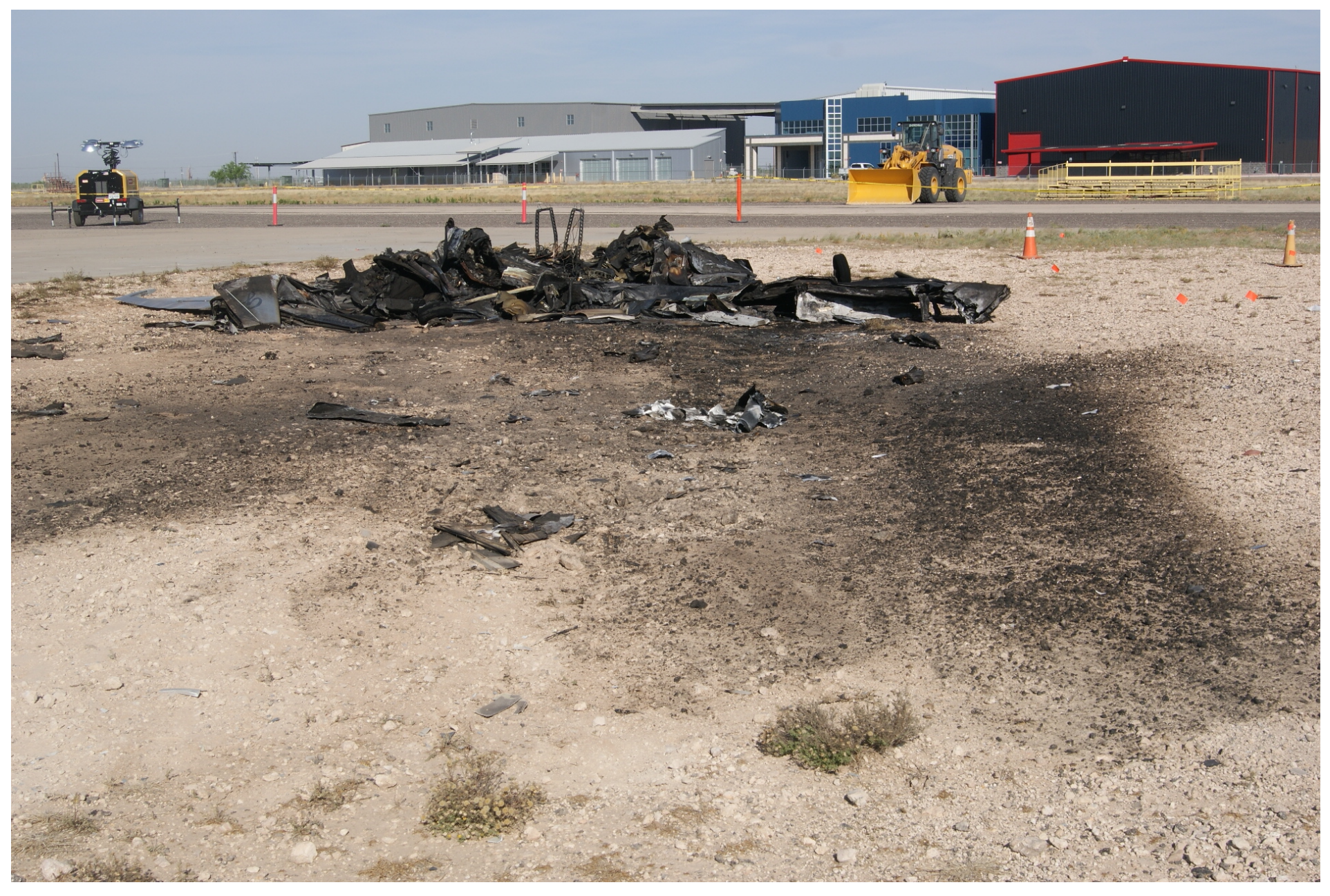
Photo 4 – The ground scar, leading to the wreckage, measured 53 feet in length and was aligned on a magnetic course of 270^{\circ} .