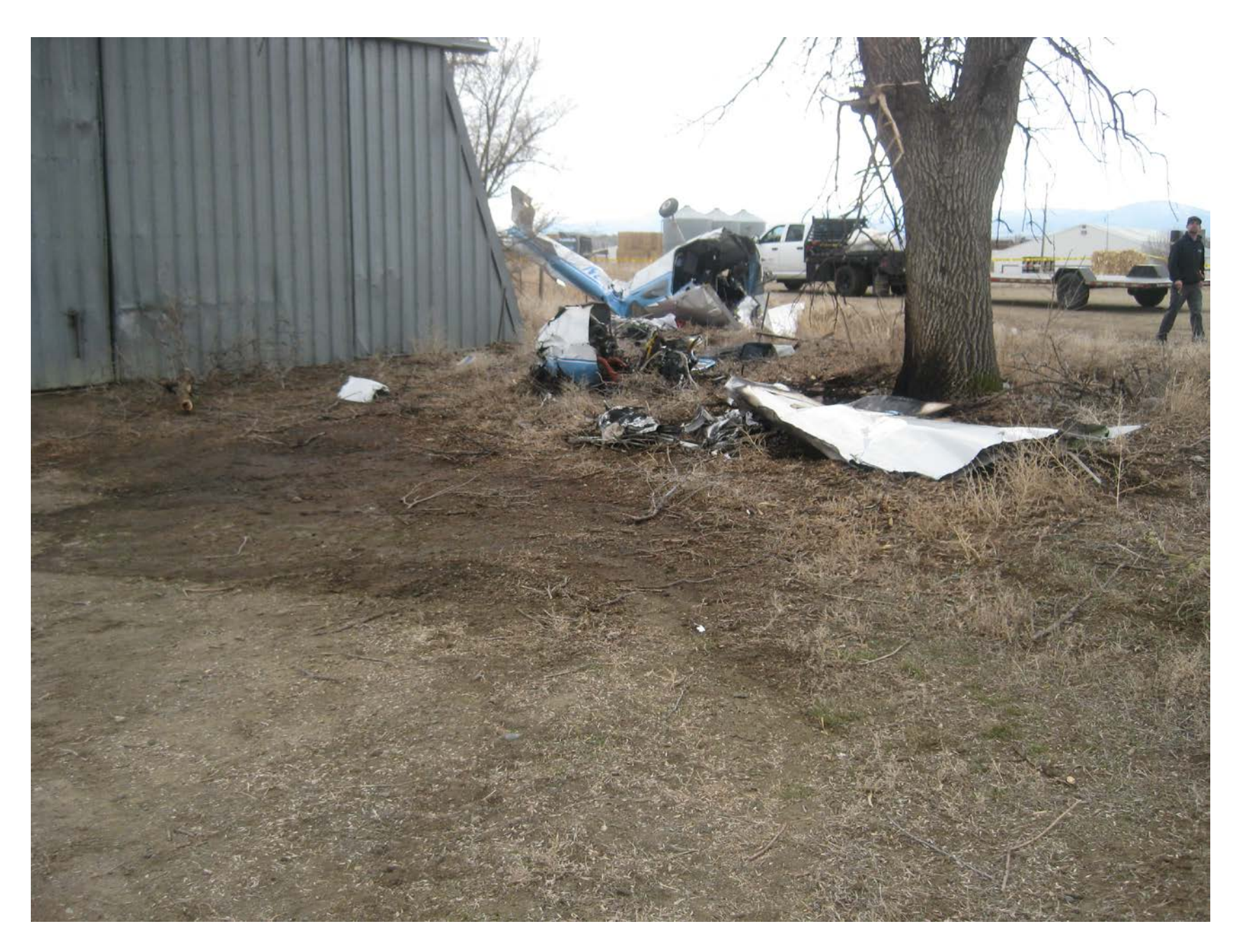
Photo 2 - N1095V at the crash site. Note burnt wing, grass, and tree trunk.