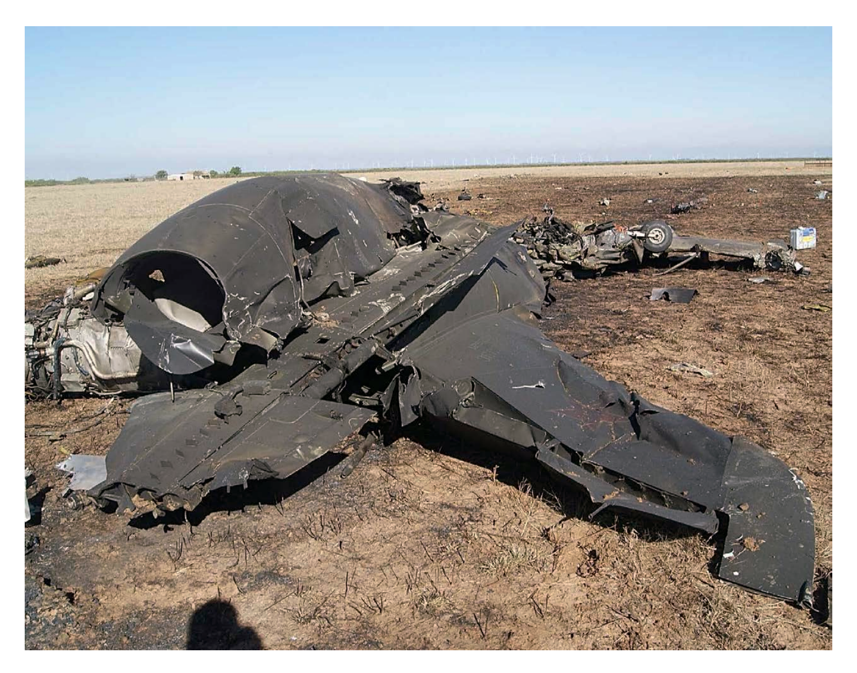
{\bf Photo}~{\bf 9-Empennage}~{\bf and}~{\bf vertical}~{\bf stabilizer.}