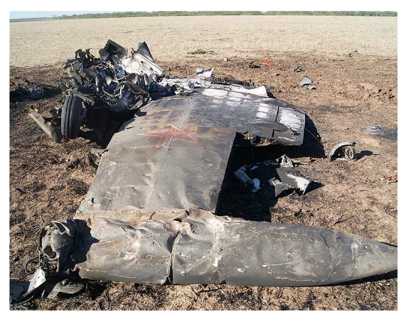
Photo 6 – Inverted right wing, remains of cockpit, and landing gear.