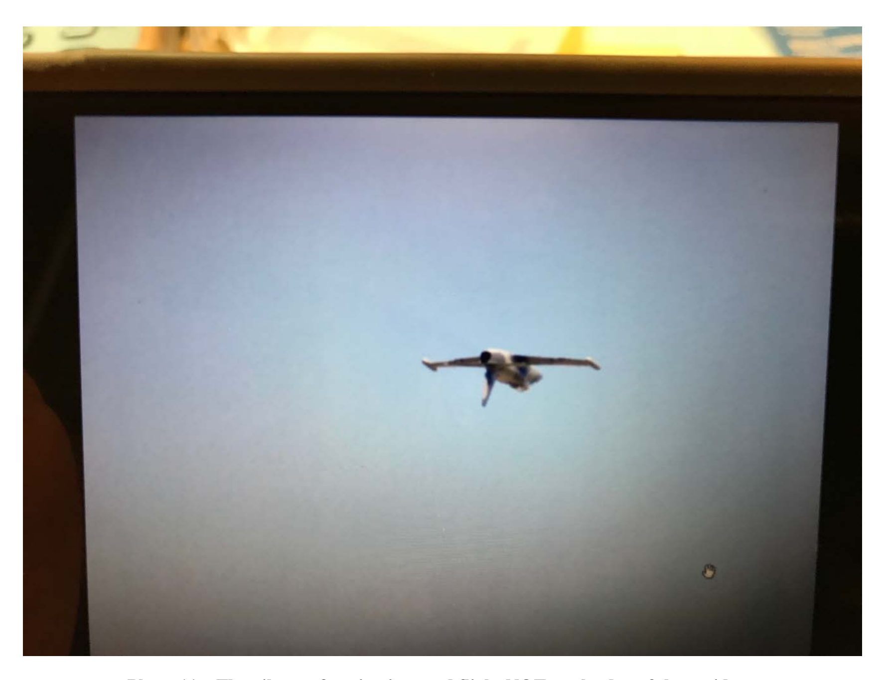
Photo 11 – The pilot performing inverted flight NOT on the day of the accident.