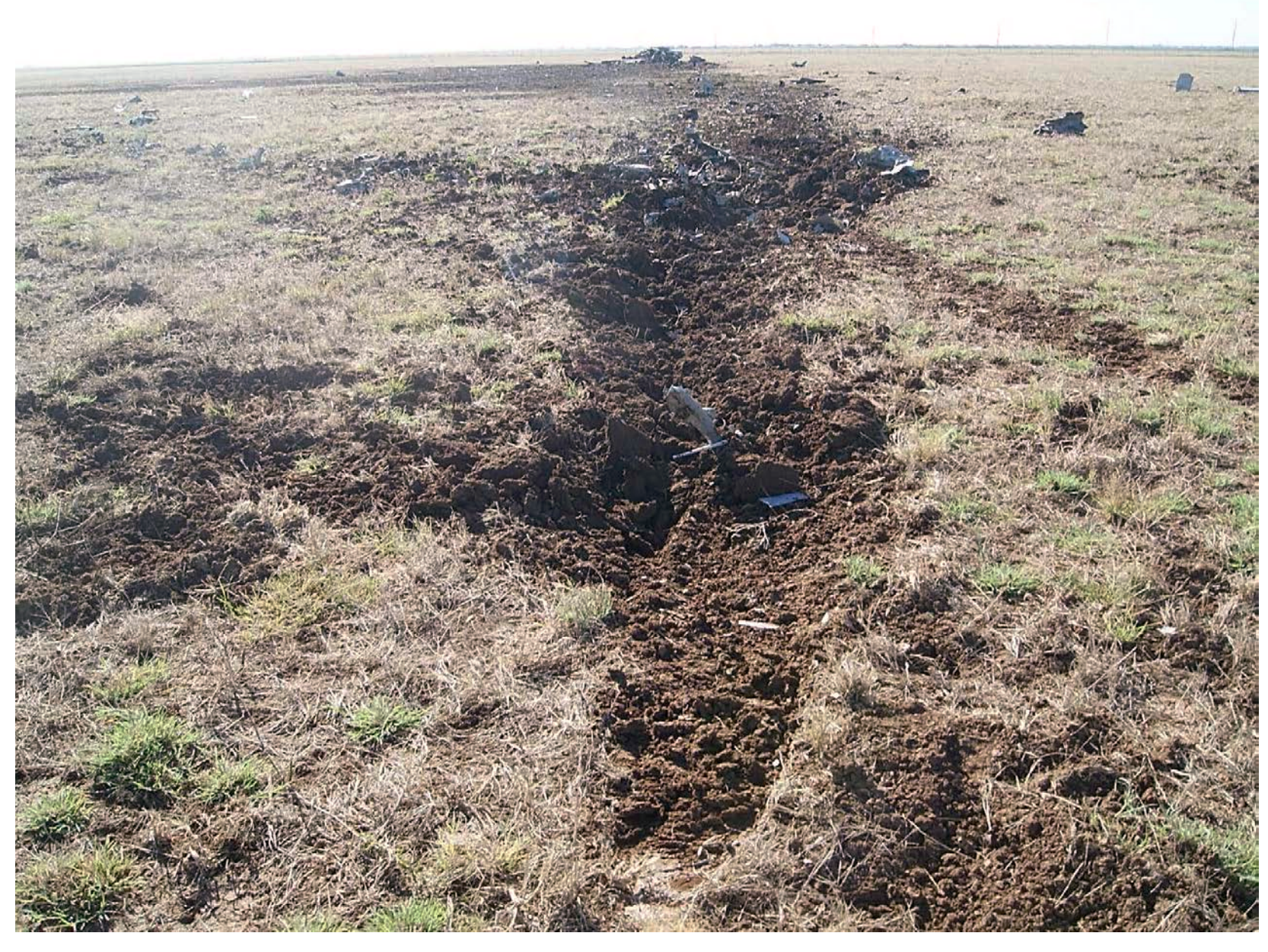
Photo 3 – The debris path was 580 feet long and aligned on a magnetic course about 170^{\circ} . Remains of the left wing are to the left of the crater.