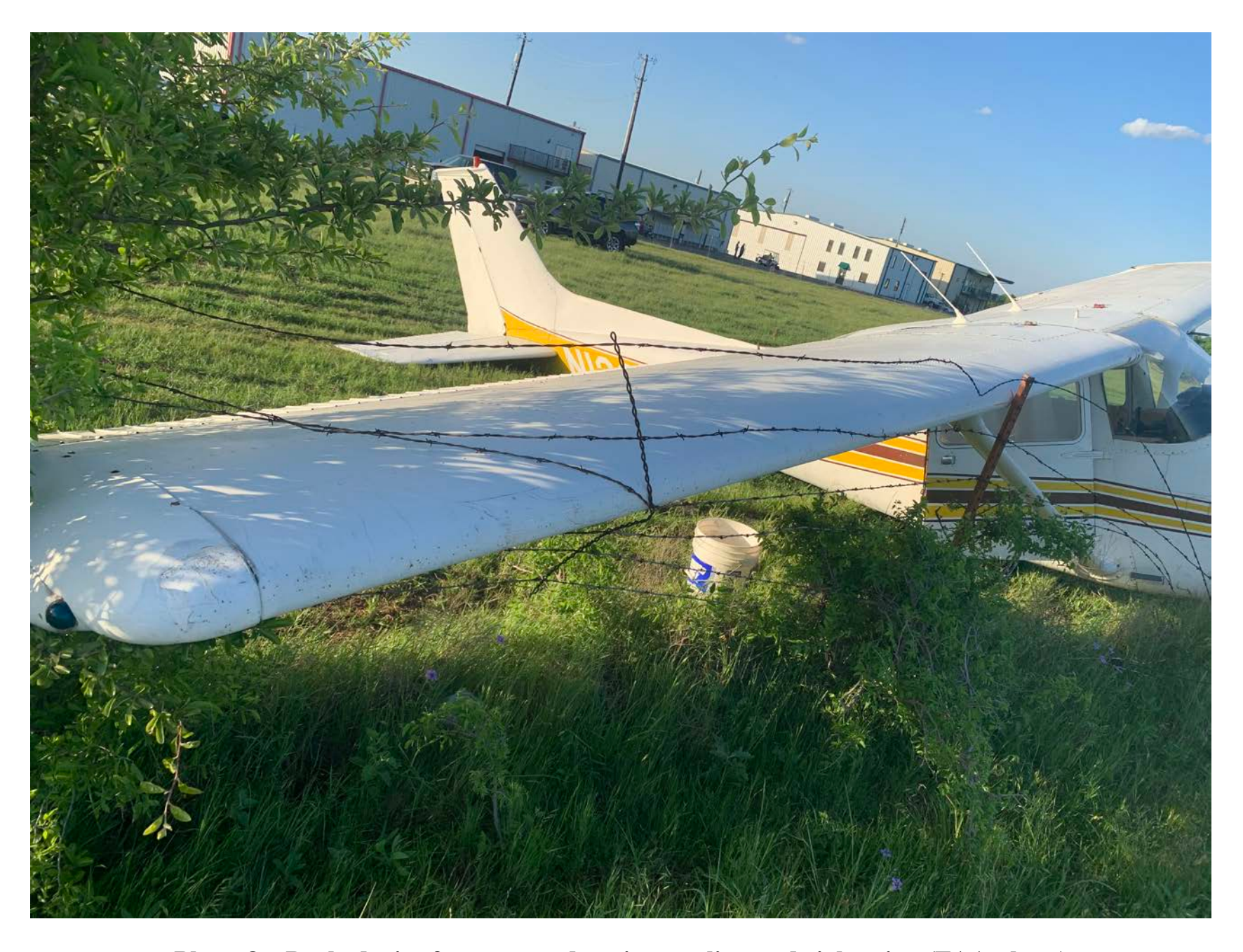
Photo\ 8-Barbed\ wire\ fence\ around\ engine\ cowling\ and\ right\ wing\ (FAA\ photo)