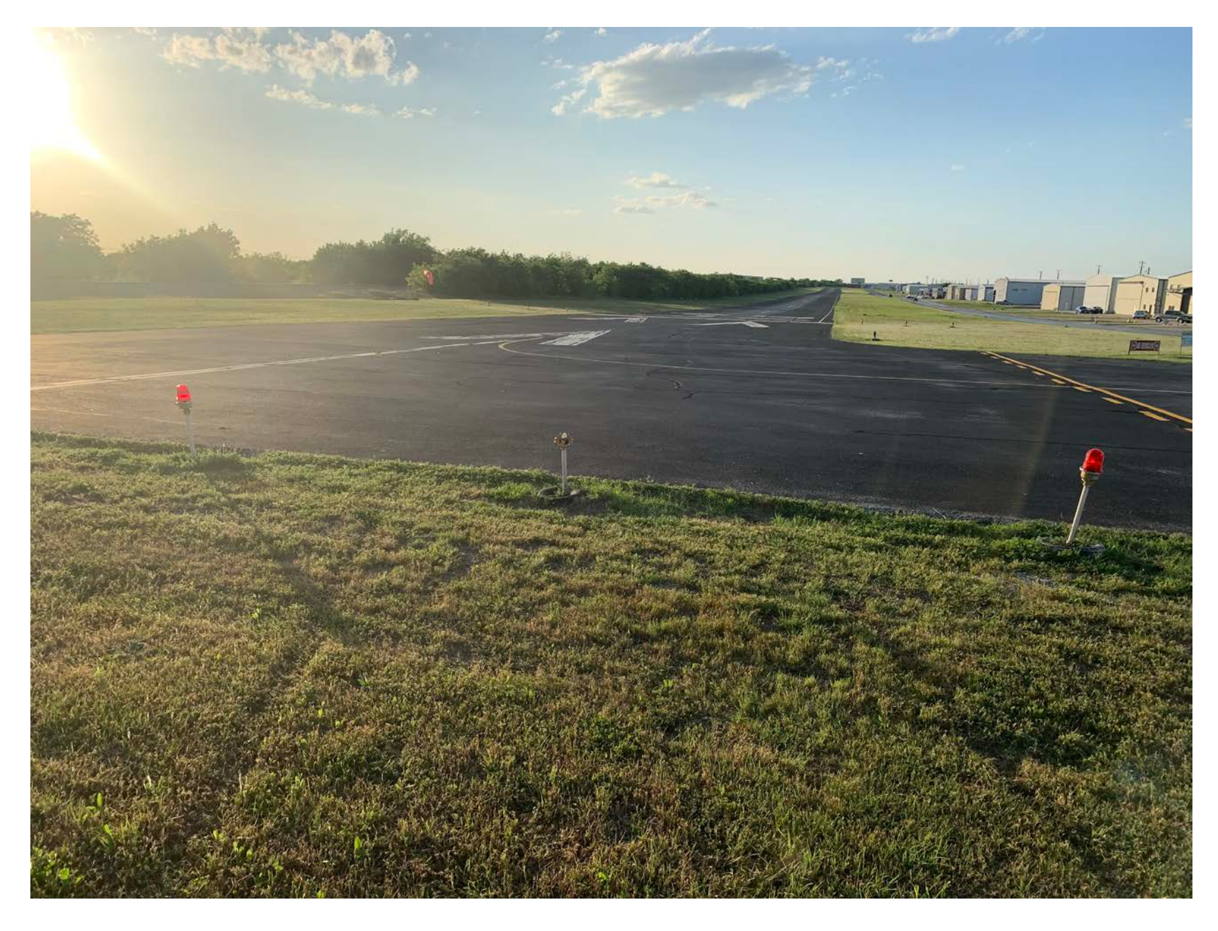
Photo 1 – View towards the departure end of runway 14. Note tire tracks and toppled airport lights