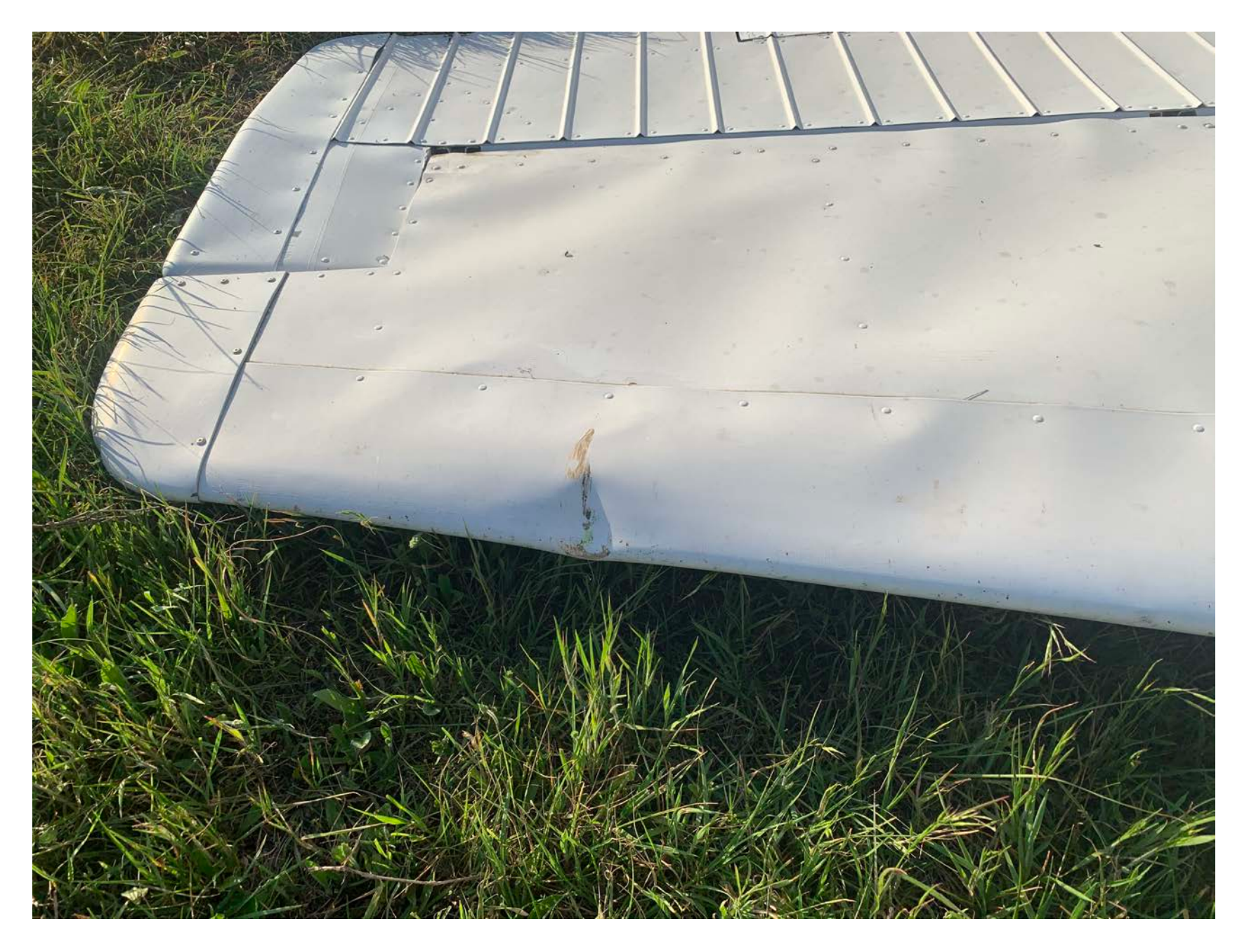
Photo 9 – Leading edge damage and skin wrinkles in right horizontal stabilizer