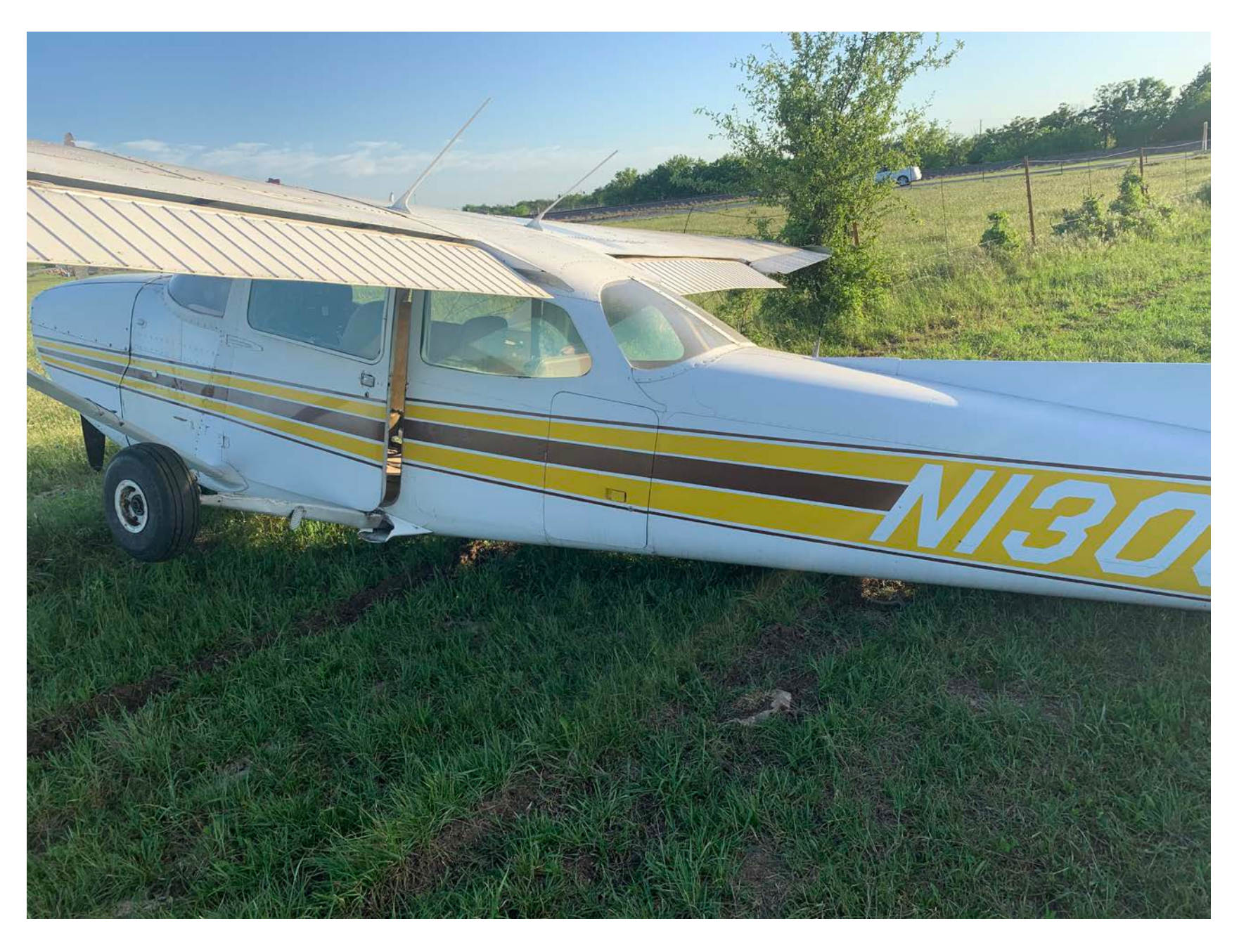
Photo 6 – Left main landing gear stayed attached but was bent forward