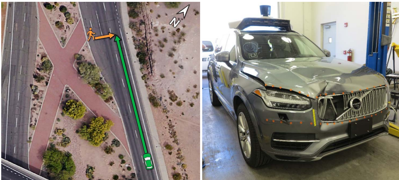
Figure 1. (Left) Location of the crash on northbound Mill Avenue, showing the paths of the pedestrian in orange and of the Uber test vehicle in green. (Right) Postcrash view of the Uber test vehicle, showing damage to the right front side.

In this area, northbound Mill Avenue is separated from southbound Mill Avenue by a center median containing trees, shrubs, and brick landscaping in the shape of an X. Four signs at the edges of the brick median, facing toward the roadway, warn pedestrians to use the crosswalk. The nearest crosswalk is at the intersection of Mill Avenue and Curry Road, about 360 feet north of where the crash occurred.