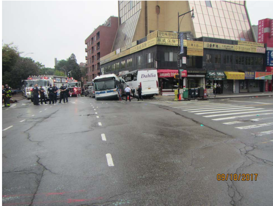
Figure 3. Eastbound view of the transit bus (on the left) and motorcoach (on the right) at final rest.

During the on-scene phase of the investigation, NTSB investigators conducted 3D laser scans of the damaged motorcoach, the transit bus, and the accident site. Investigators also interviewed the transit bus driver and some of the transit bus passengers, and inspected records maintained by both the MTA and the motor carrier. NTSB investigators will continue to collect and analyze data including all pertinent information in the areas of human performance, survival, highway, vehicle, and motor carrier operations.