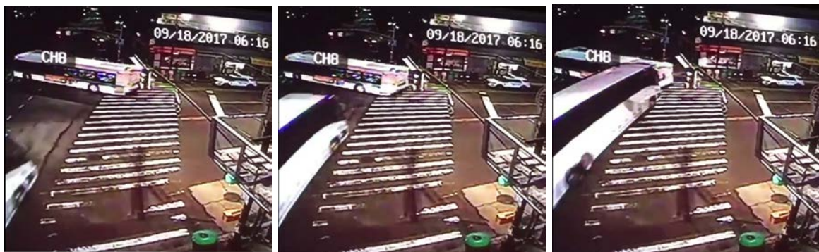
Figure 2. Still images from a surveillance camera mounted on the southwest corner of the intersection.