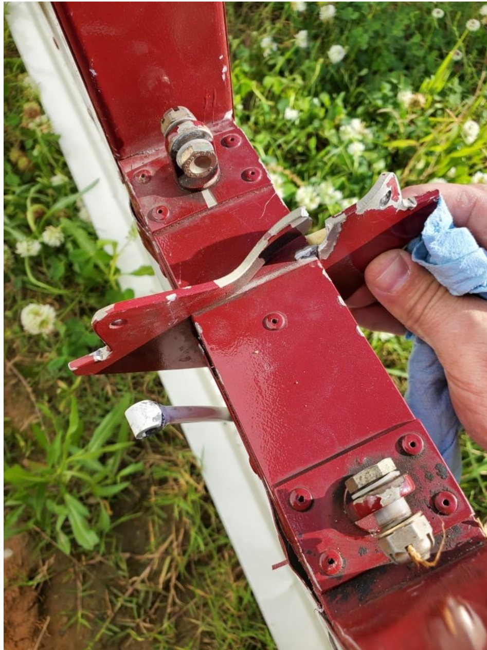
Photo 5 - Fractured stabilator control horn