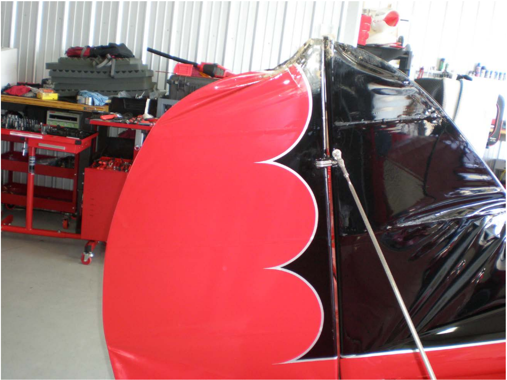
Photo 5 – View of the right side of the rudder.