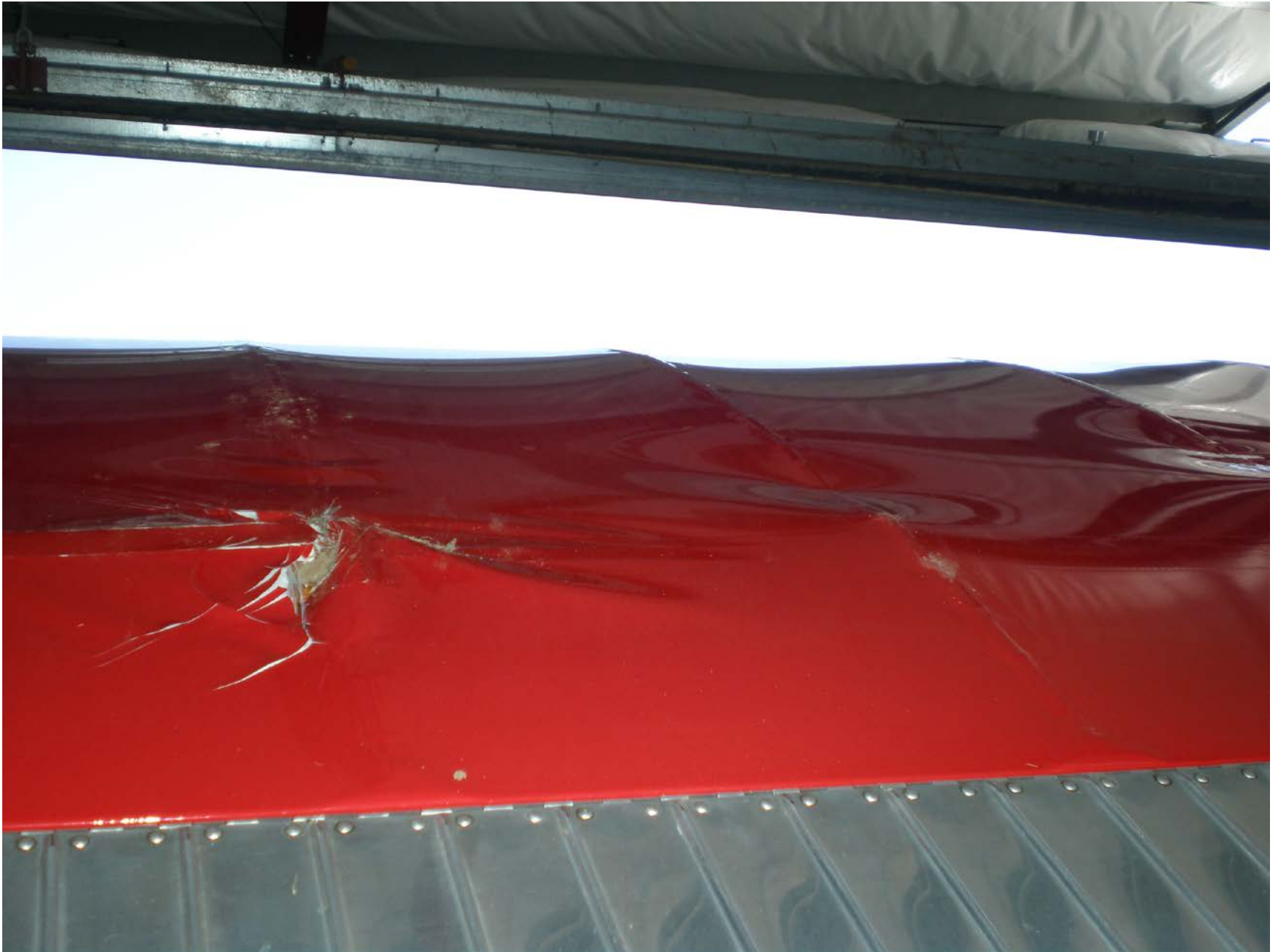
Photo 2 – View of the outboard portion of the right upper wing.