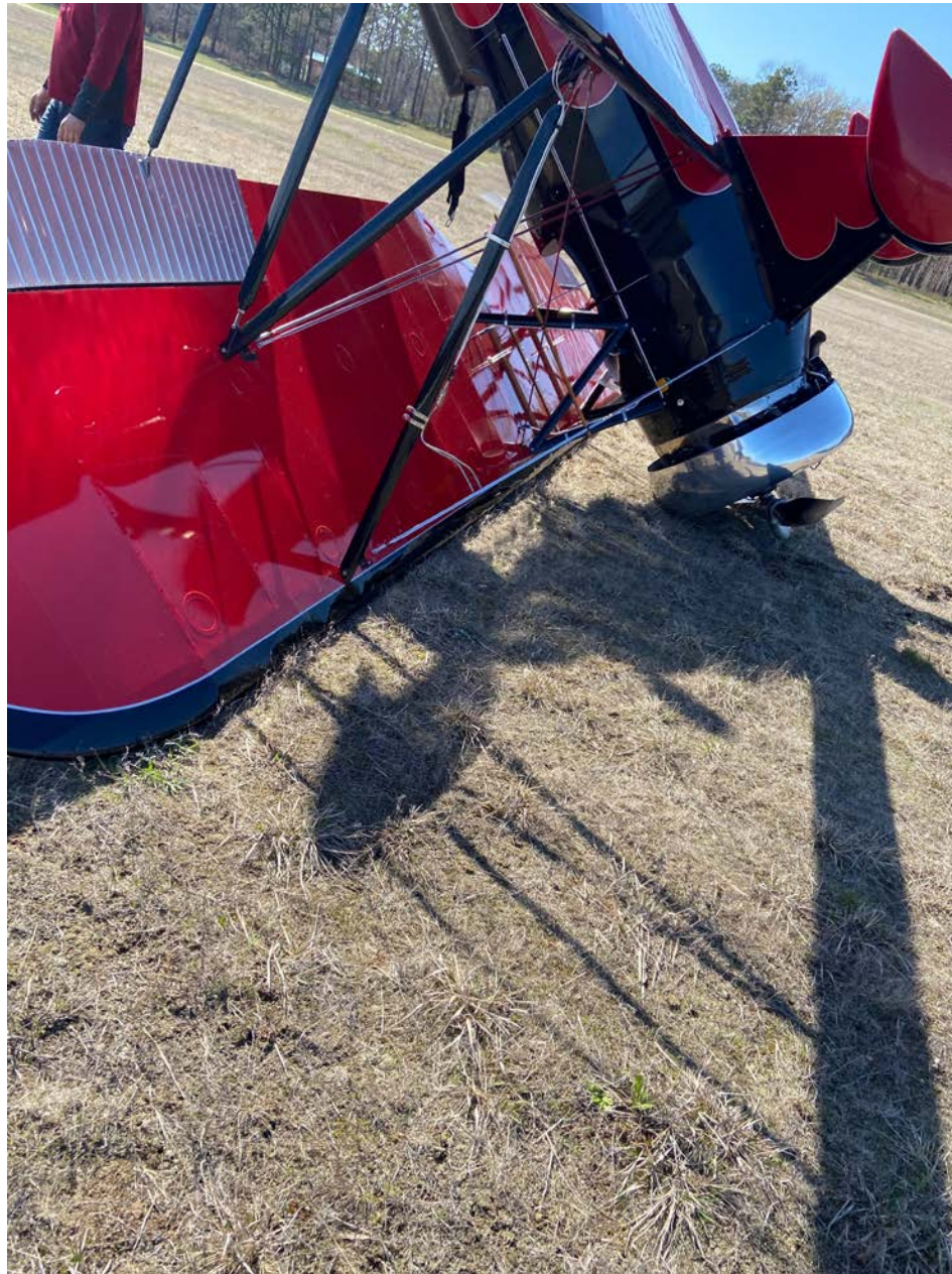
Photo 1 – View of the wreckage as it came to rest.