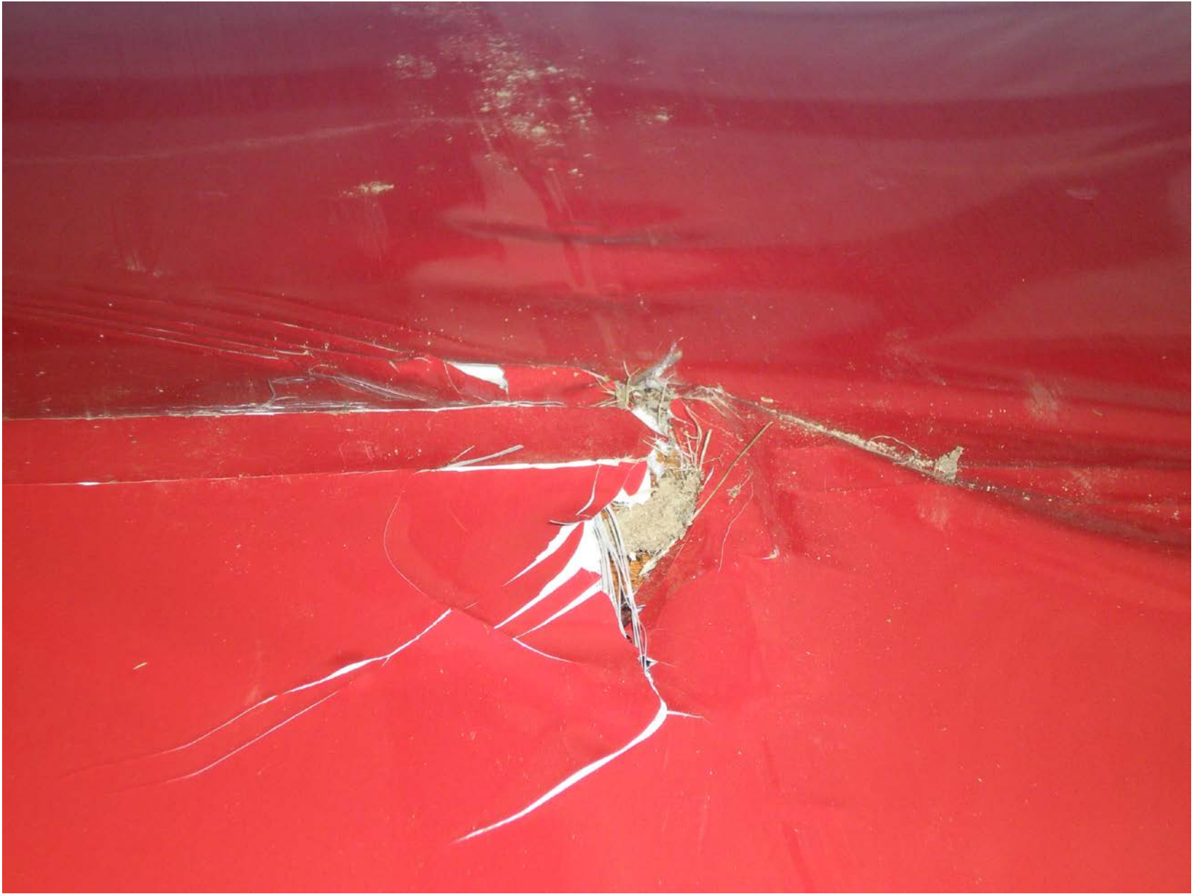
Photo 4 – View of the right upper rear spar damage.