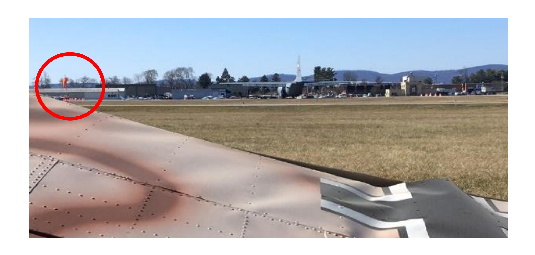
View of Windsock – Wind from the WNW