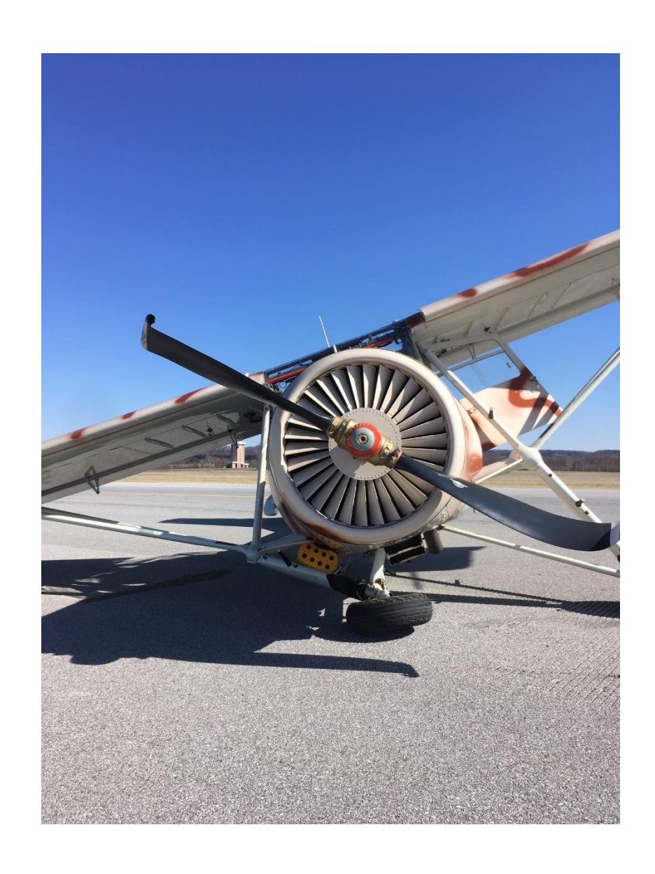
Airplane – View of Front