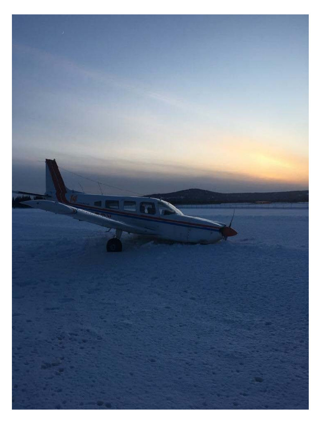
\label{eq:photon} Photo\ 1-Accident\ airplane\ at\ accident\ site.