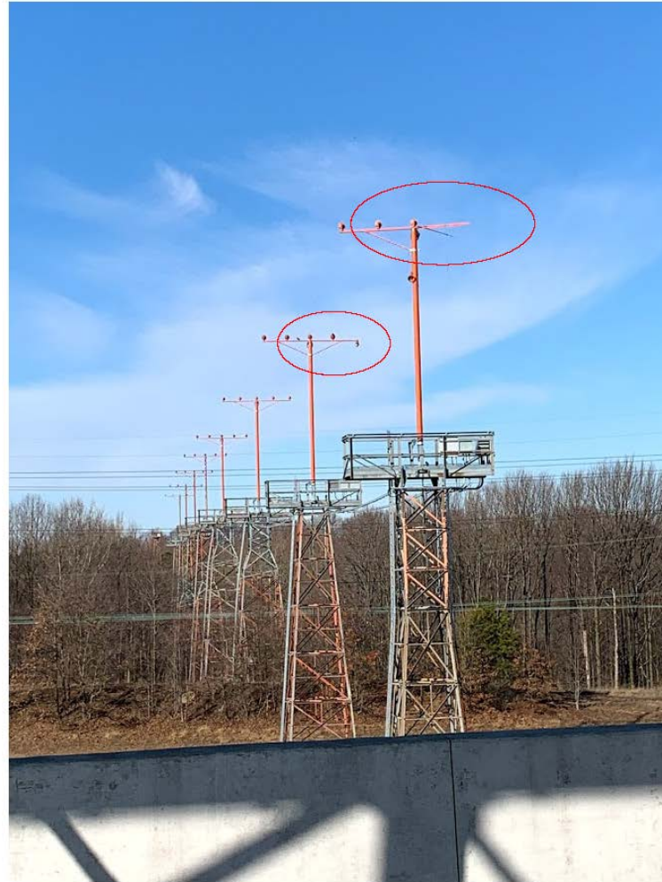
Approach light towers looking away from approach end of RWY 10