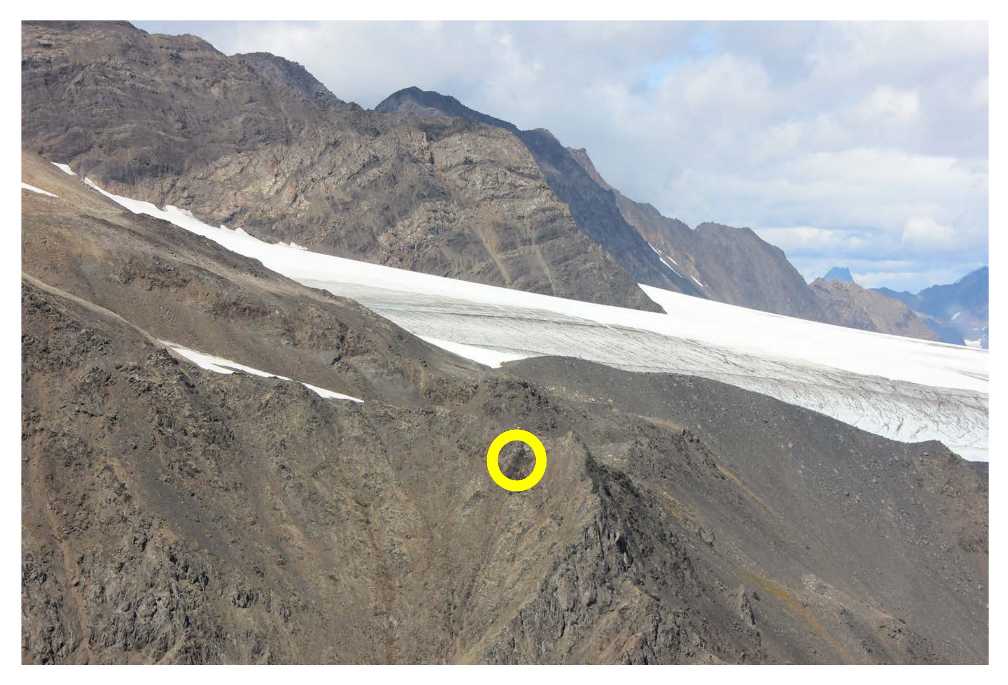
Photo 1 – Impact point (circled in yellow) on rock face near ridgeline on south face of Goat Mountain.