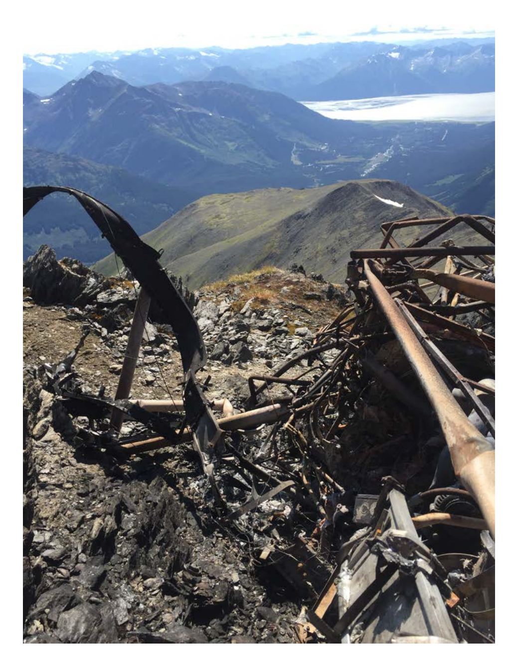
Photo 6 – Thermally damaged accident airplane at accident site looking south towards Girdwood, Alaska.