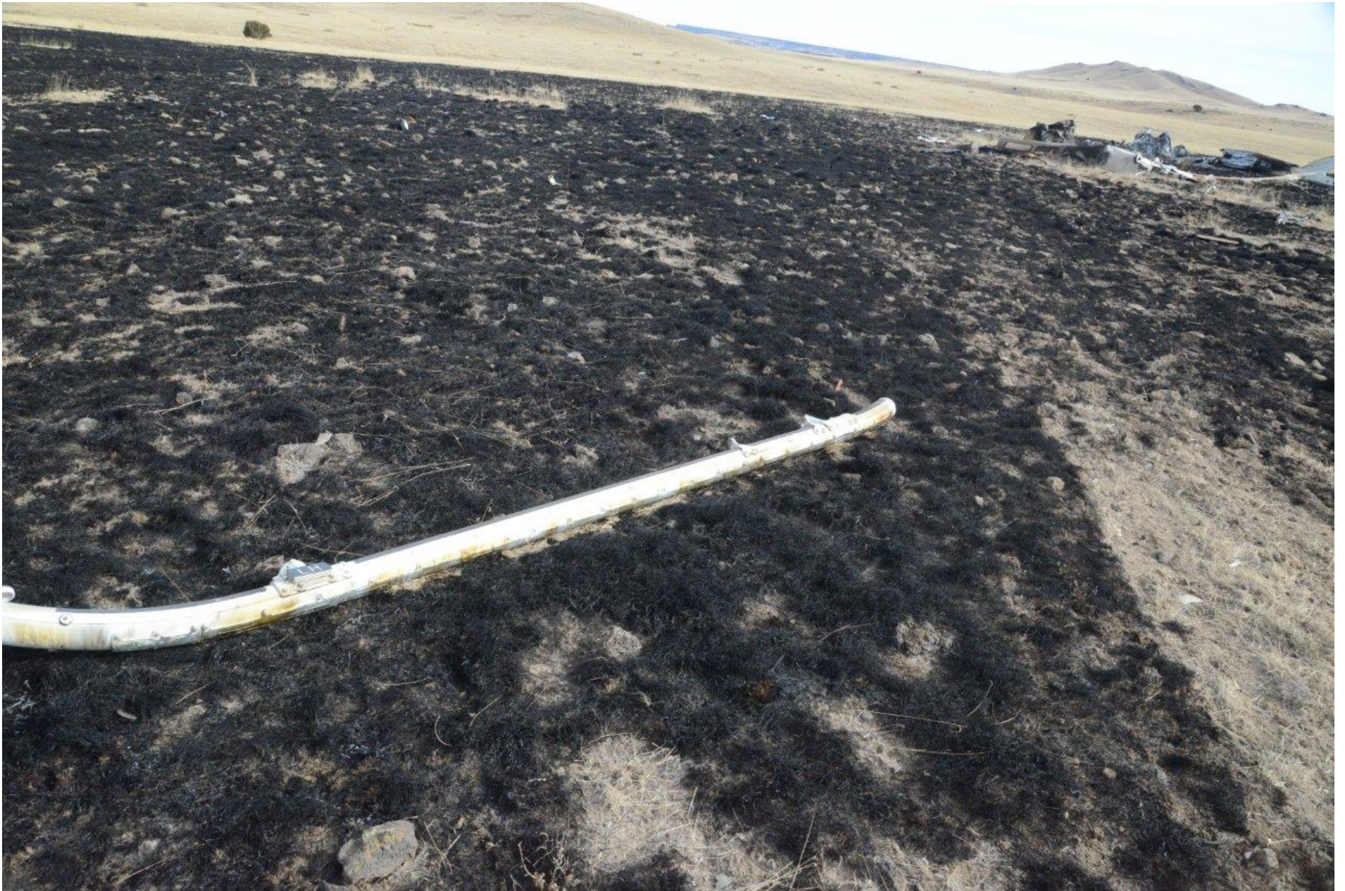
Photo 8 - View from the separated left skid looking towards the main wreckage.