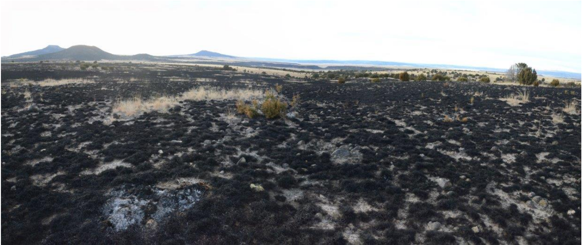
Photo 3 - View looking towards RTN from the initial impact site.