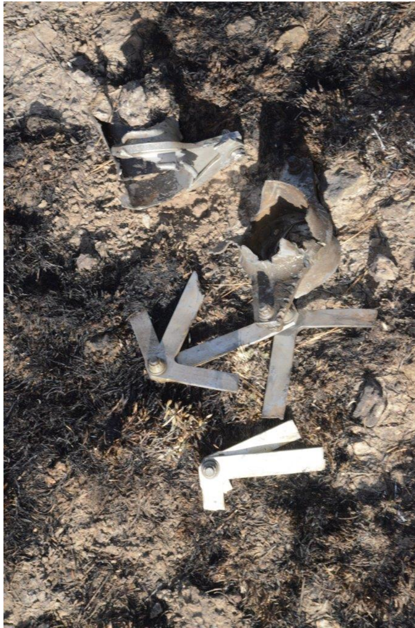
Photo 13 - View of liberated K-flex components.