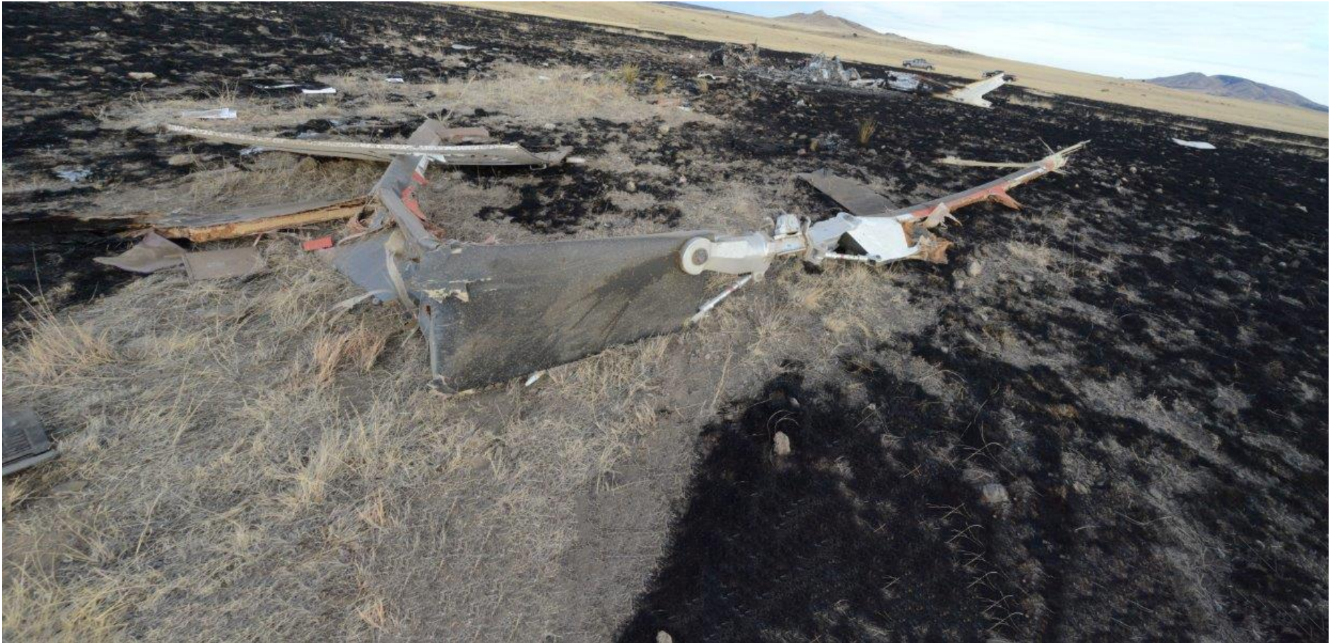
Photo 7 - View from the main rotor blades looking towards the main wreckage.