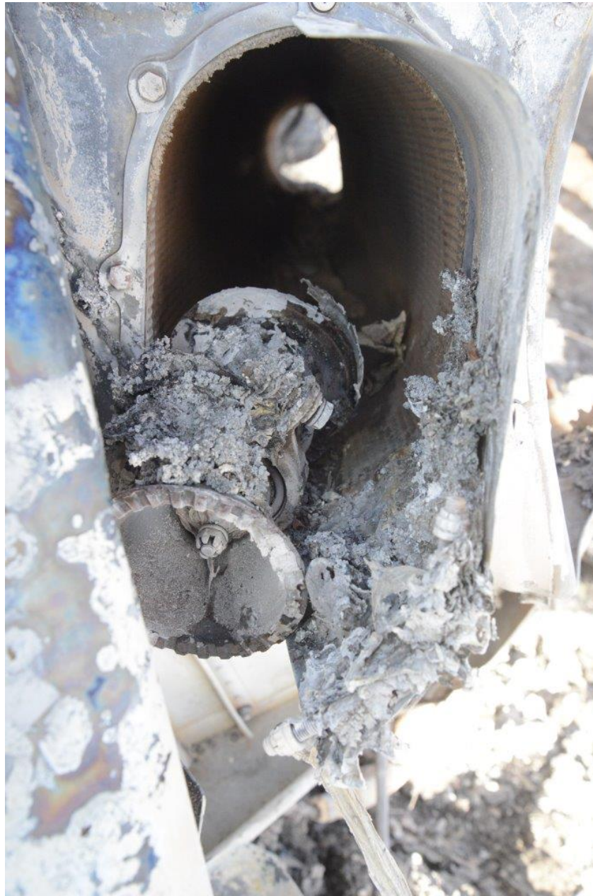
Photo 17 - Close-up view of a coupling in the tail rotor drive system.