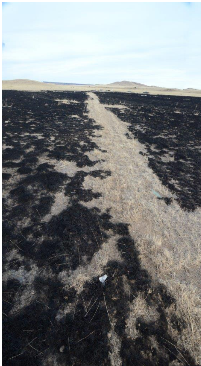
Photo 4 - View of the debris path looking towards the main wreckage.