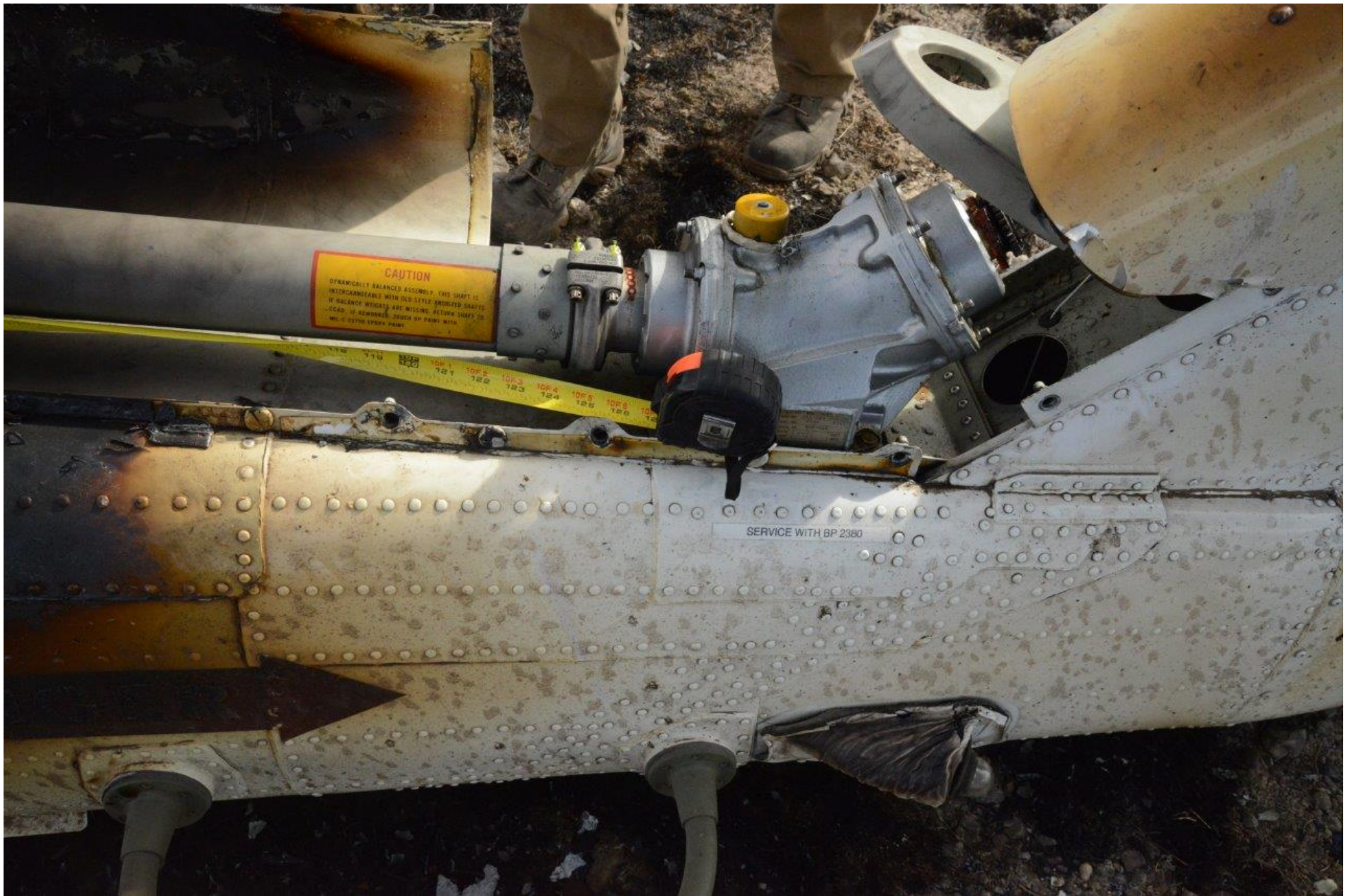
Photo 19 - View of the intermediate tail rotor gear box.