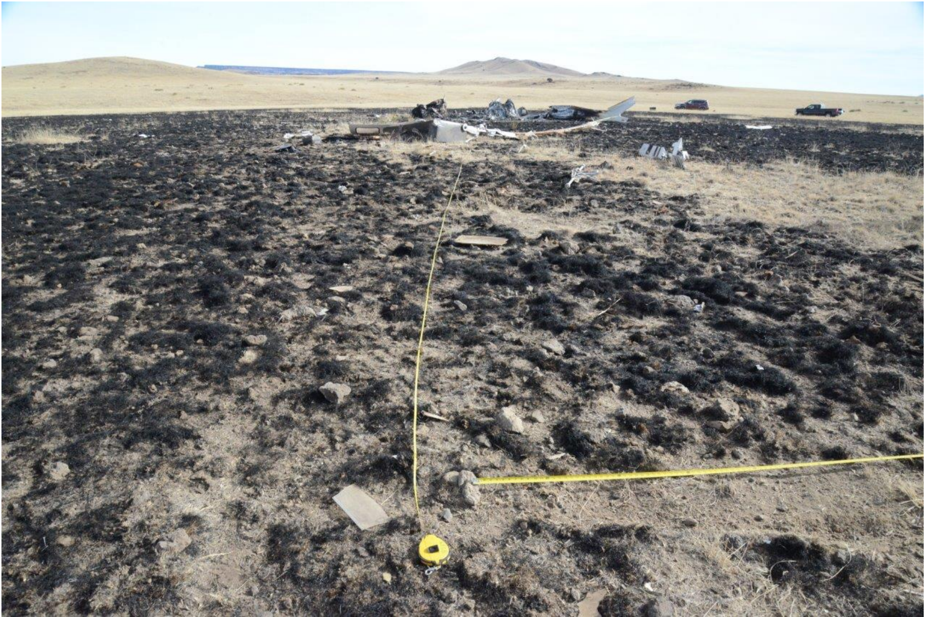
Photo 6 - View from the ground scar looking towards the main wreckage.