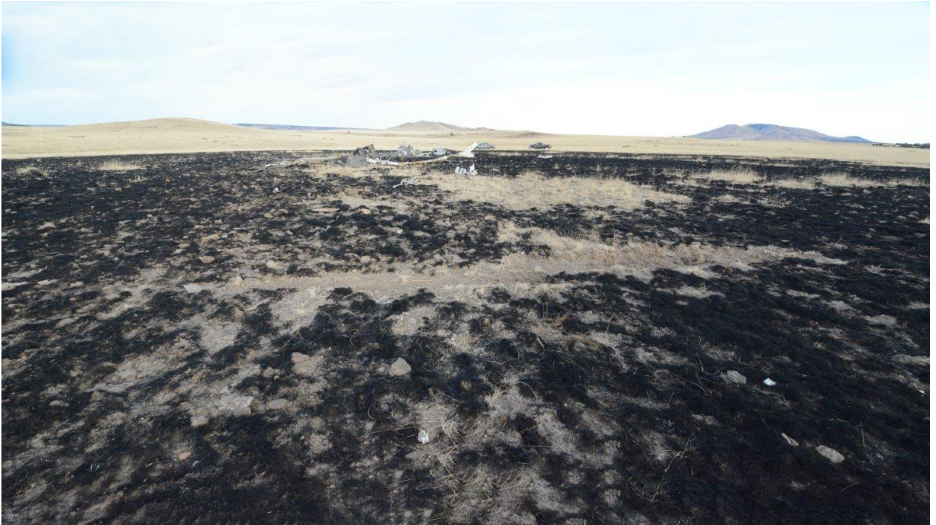
Photo 5 - View of a ground scar that is perpendicular to the debris path.