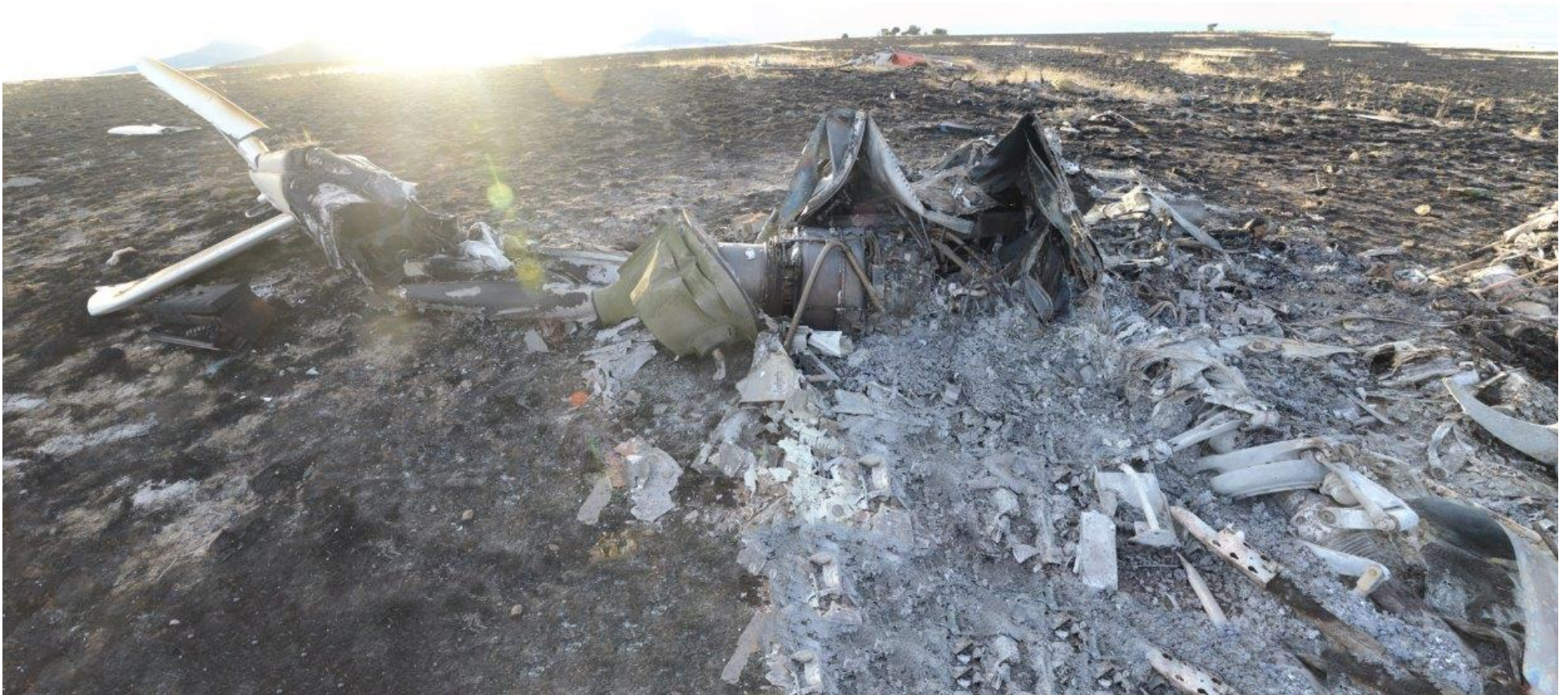
Photo 11 - View of the engine in the main wreckage.