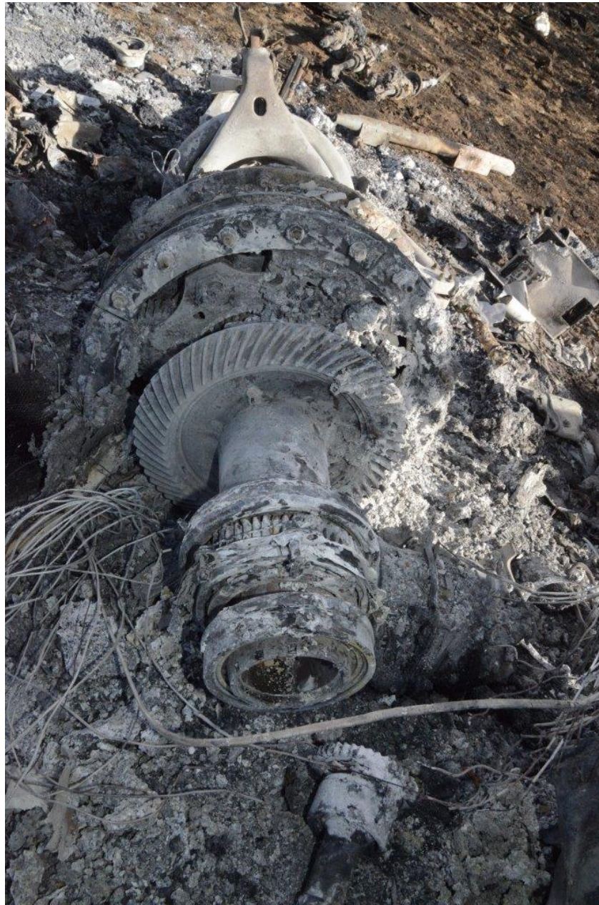
Photo 12 - View of transmission gears.