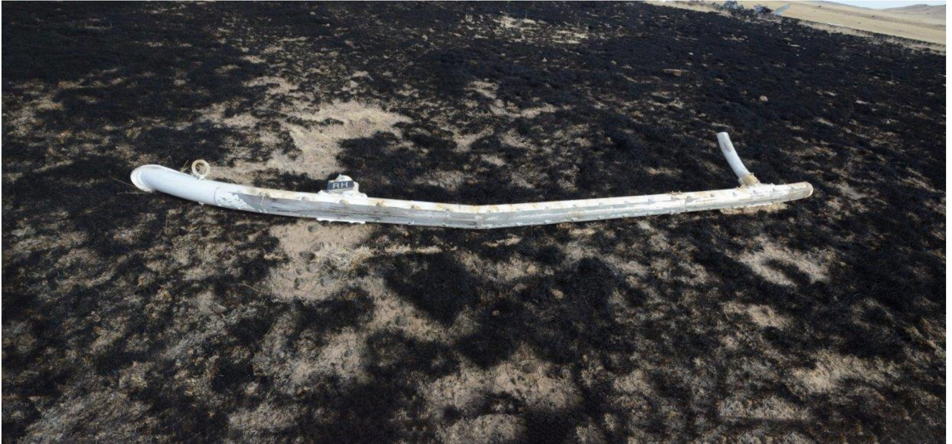
Photo 9 - View from the separated right skid looking towards the main wreckage.