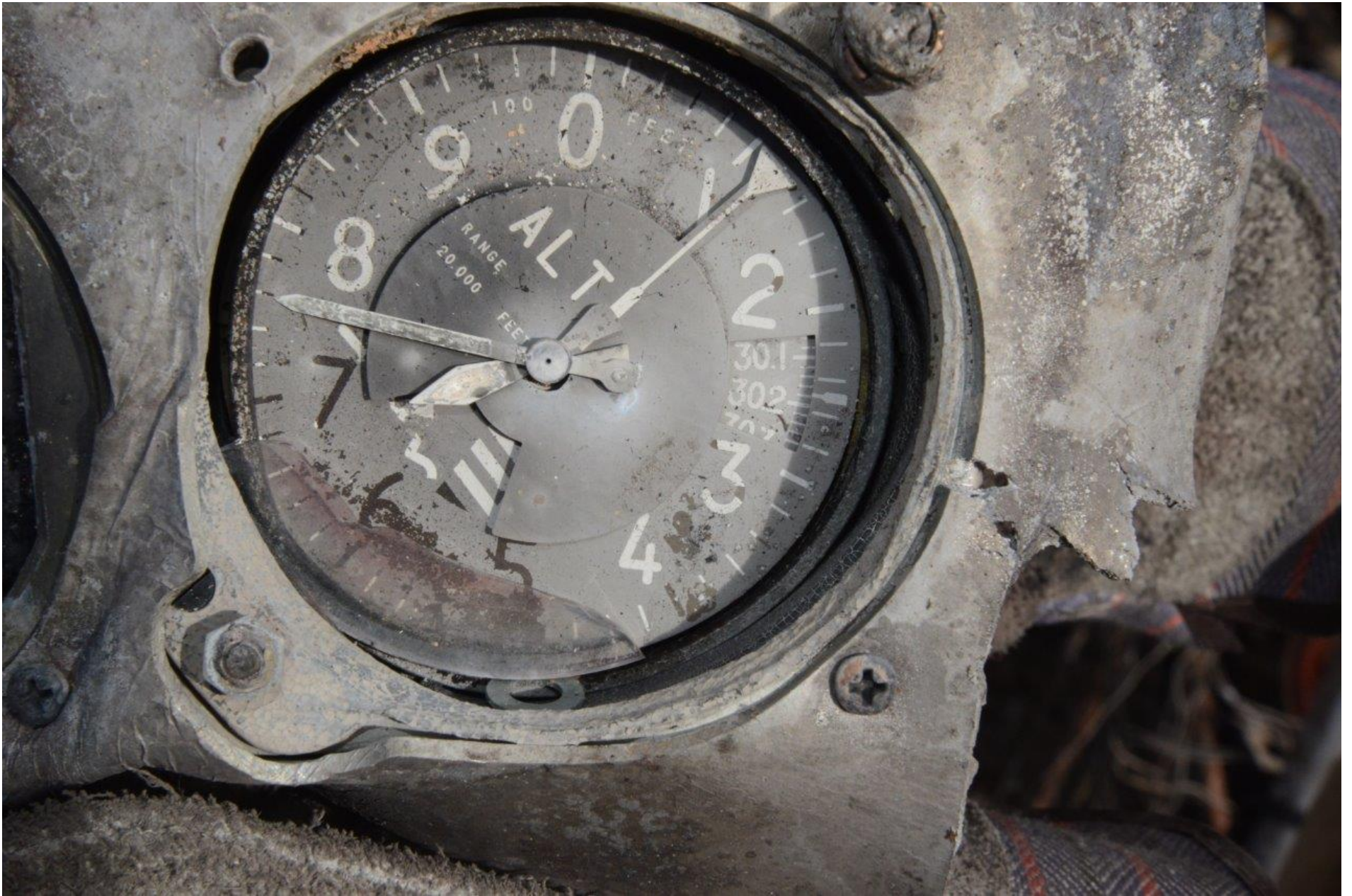
Photo 16 - Close-up view of an altimeter.