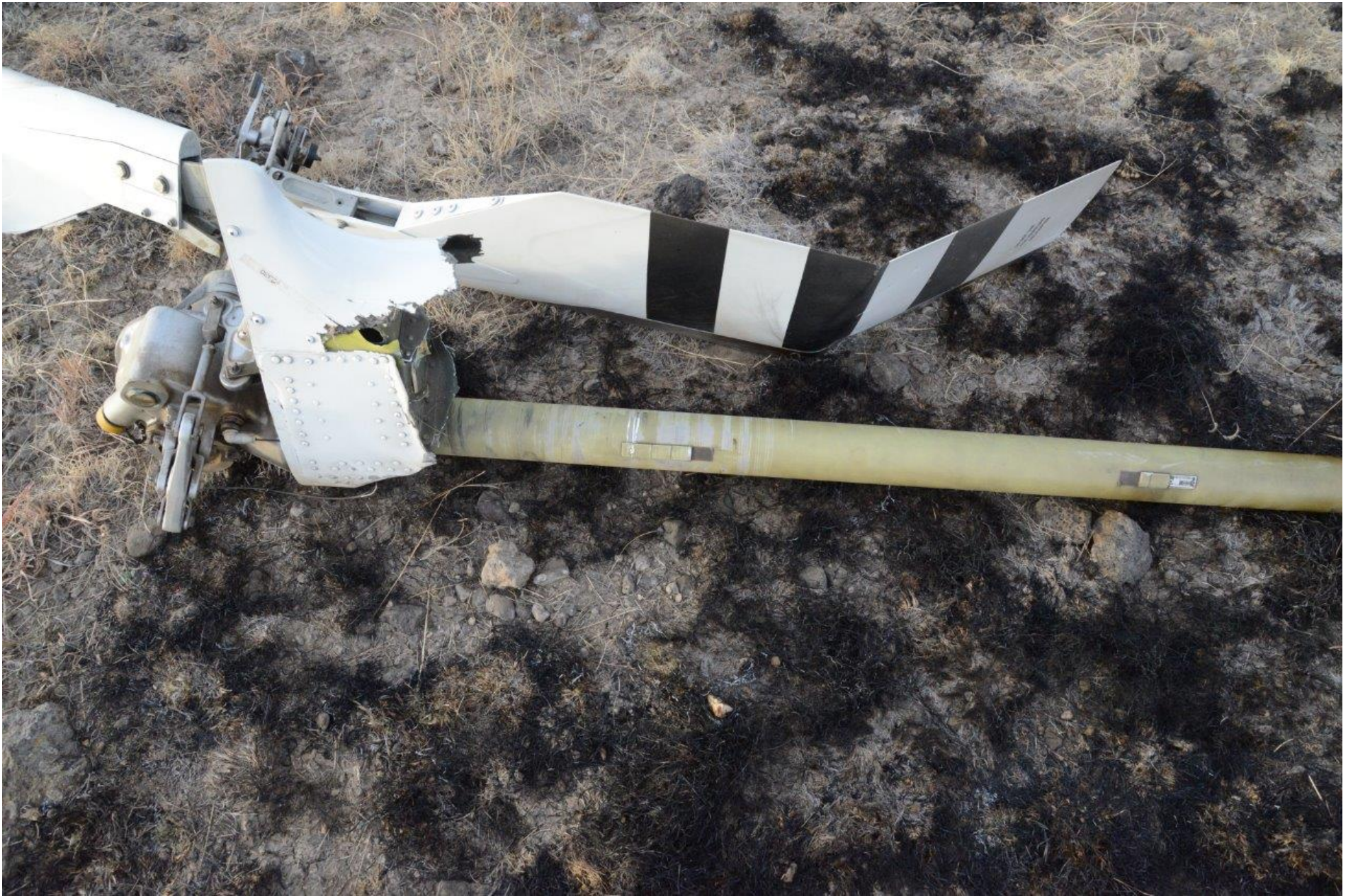
Photo 20 - View of the tail rotor gear box, a tail rotor blade, and tail rotor drive shaft.