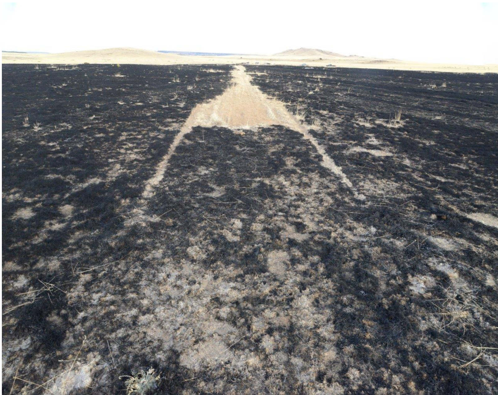
Photo 2 - Close-up view looking towards the initial impact site.