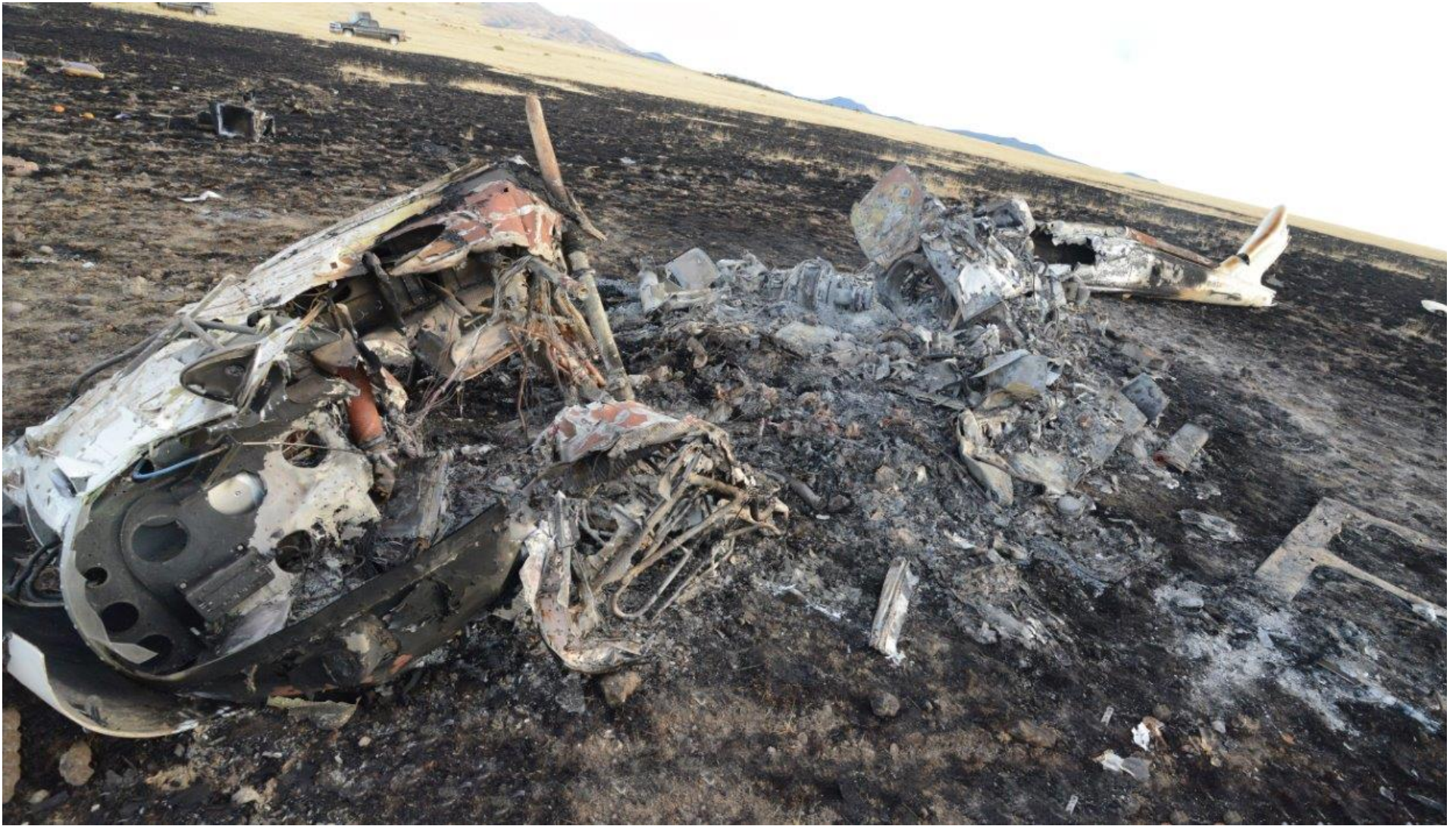
Photo 10 - View of the main wreckage.