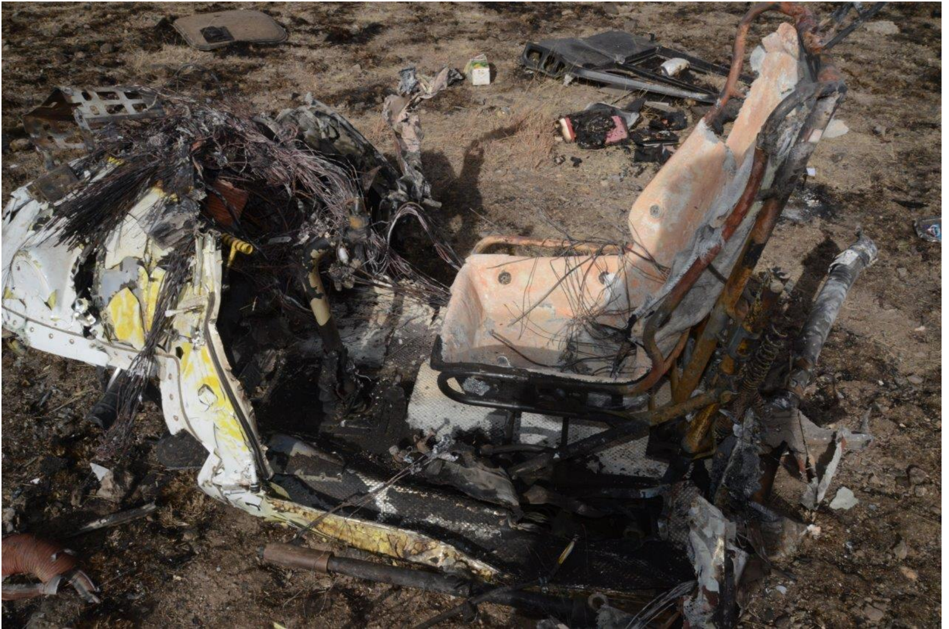
Photo 18 - View of the left cockpit seat during recovery.