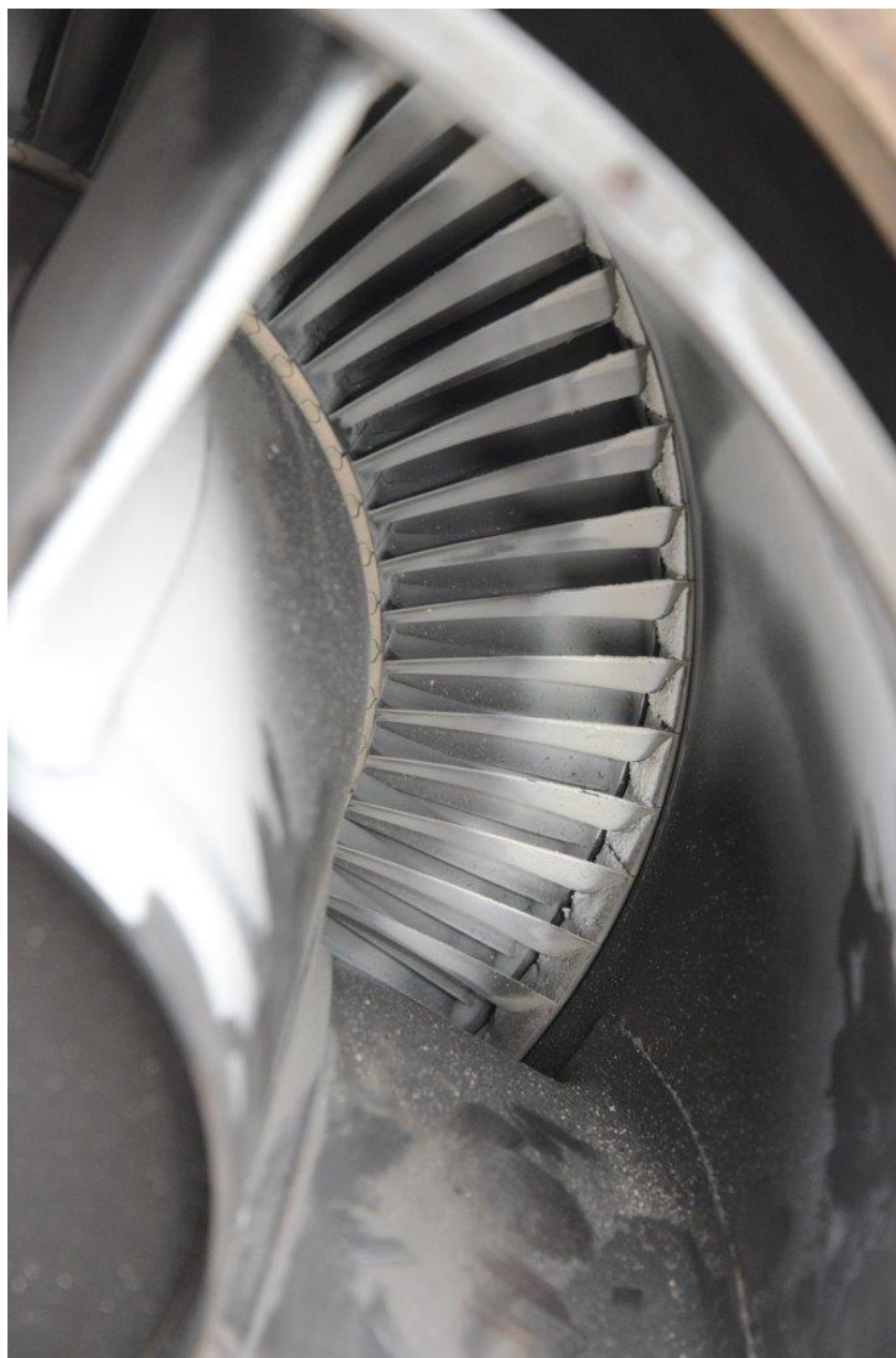
Photo 14 - View of engine turbine blades.