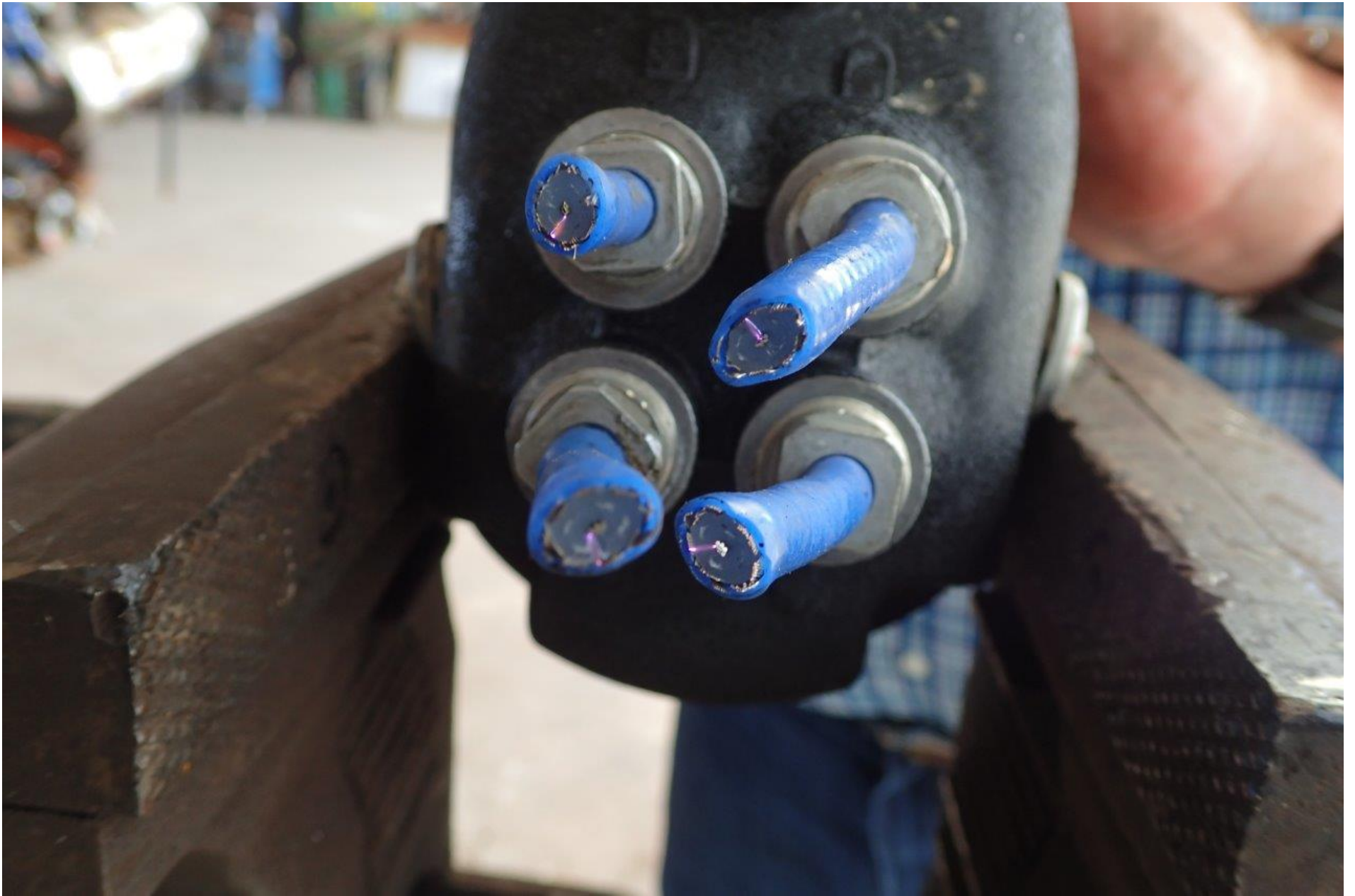
Photo 7 - View of a magneto exhibiting spark at all leads.