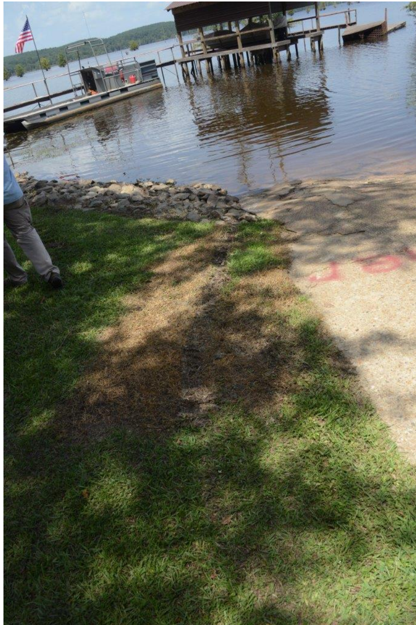
Photo 8 - View of the boat ramp area where blight was present.