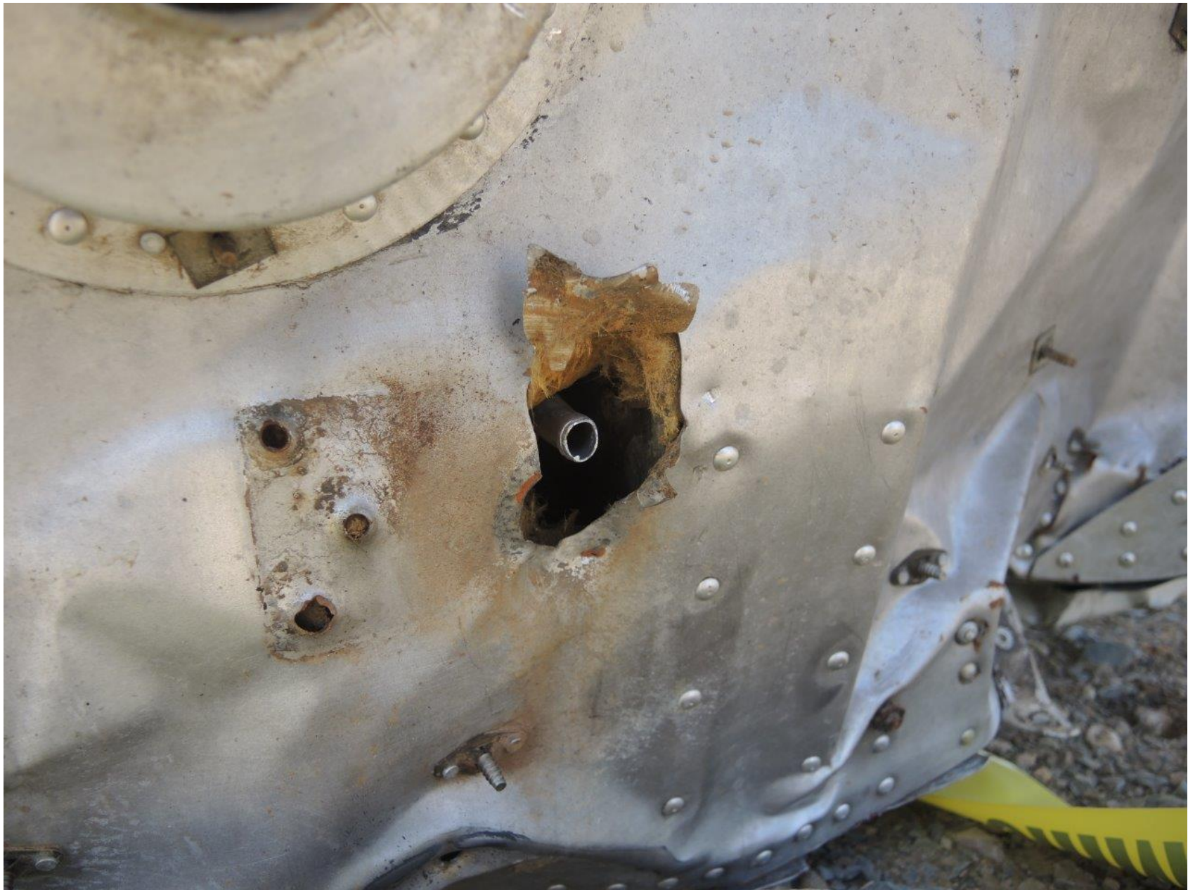
Photo 5 - View of the fuel line where pressurized air was applied.