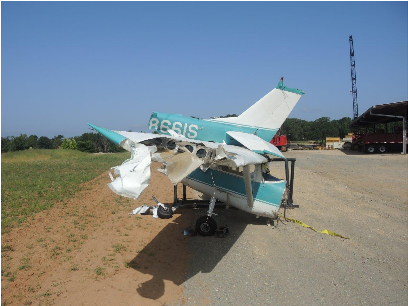
Photo 2 - View of the right side of the airplane.