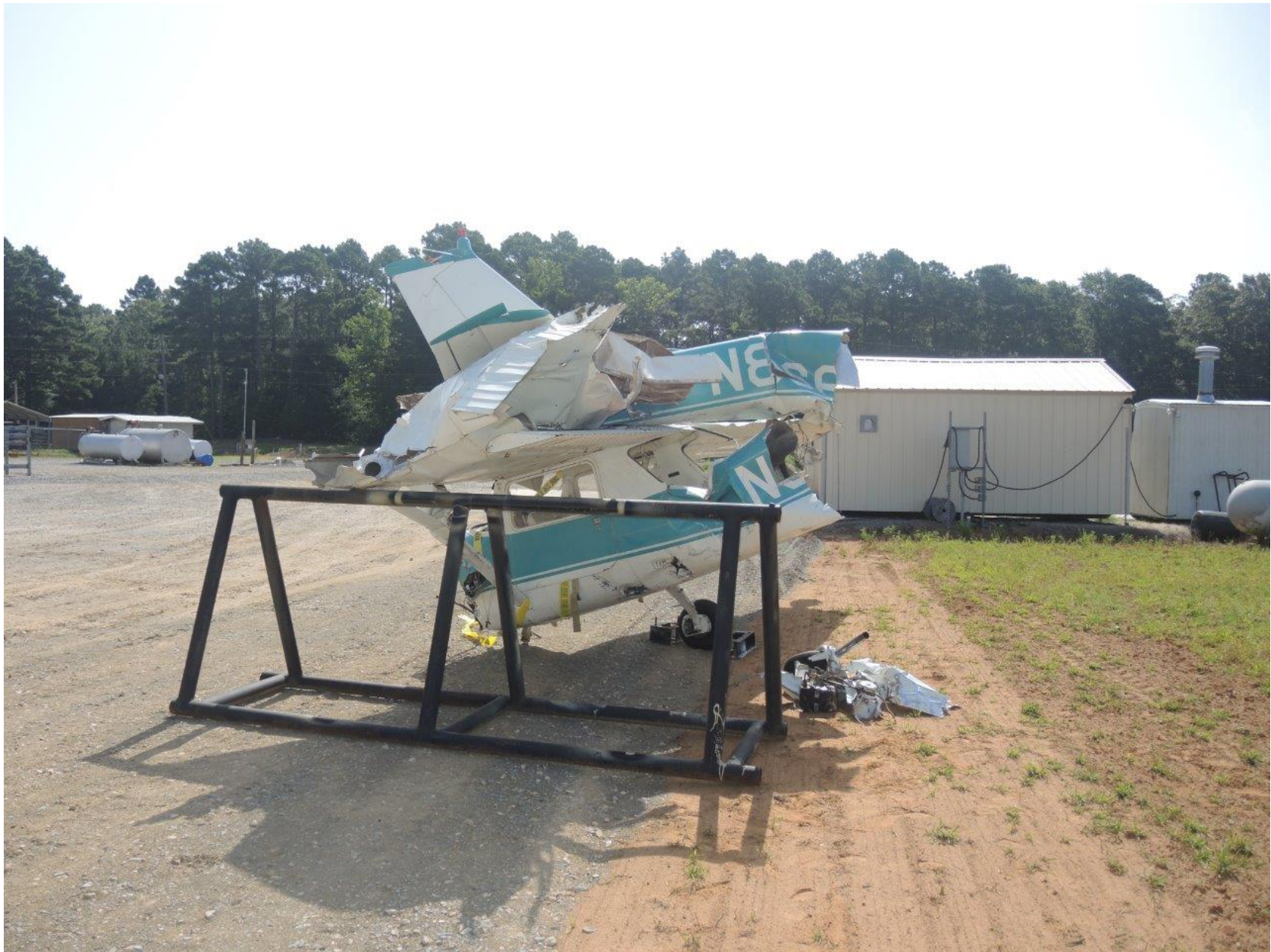
Photo 4 - View of the left side of the airplane.