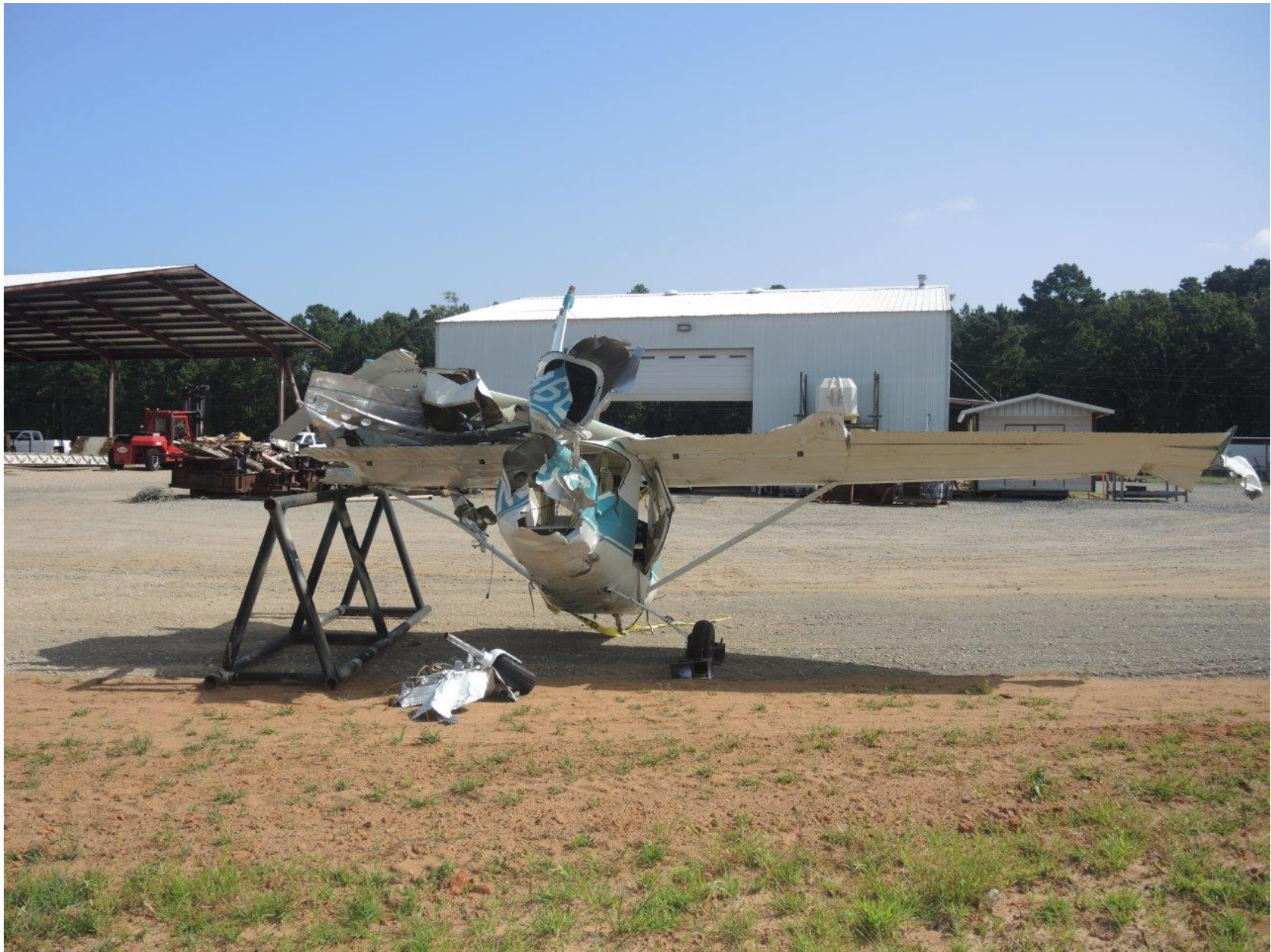
Photo 3 - View of the rear side of the airplane.