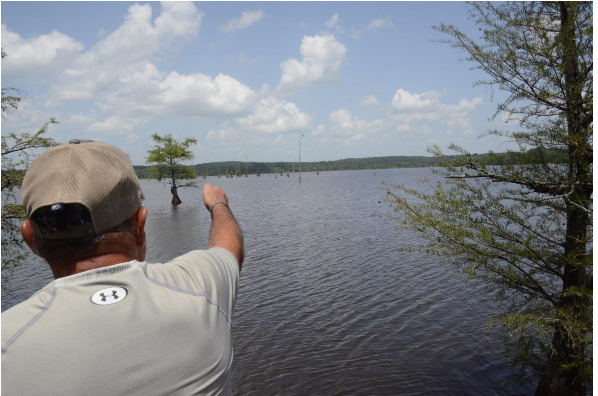
Photo 9 - View of a witness pointing to where the airplane impacted the lake.