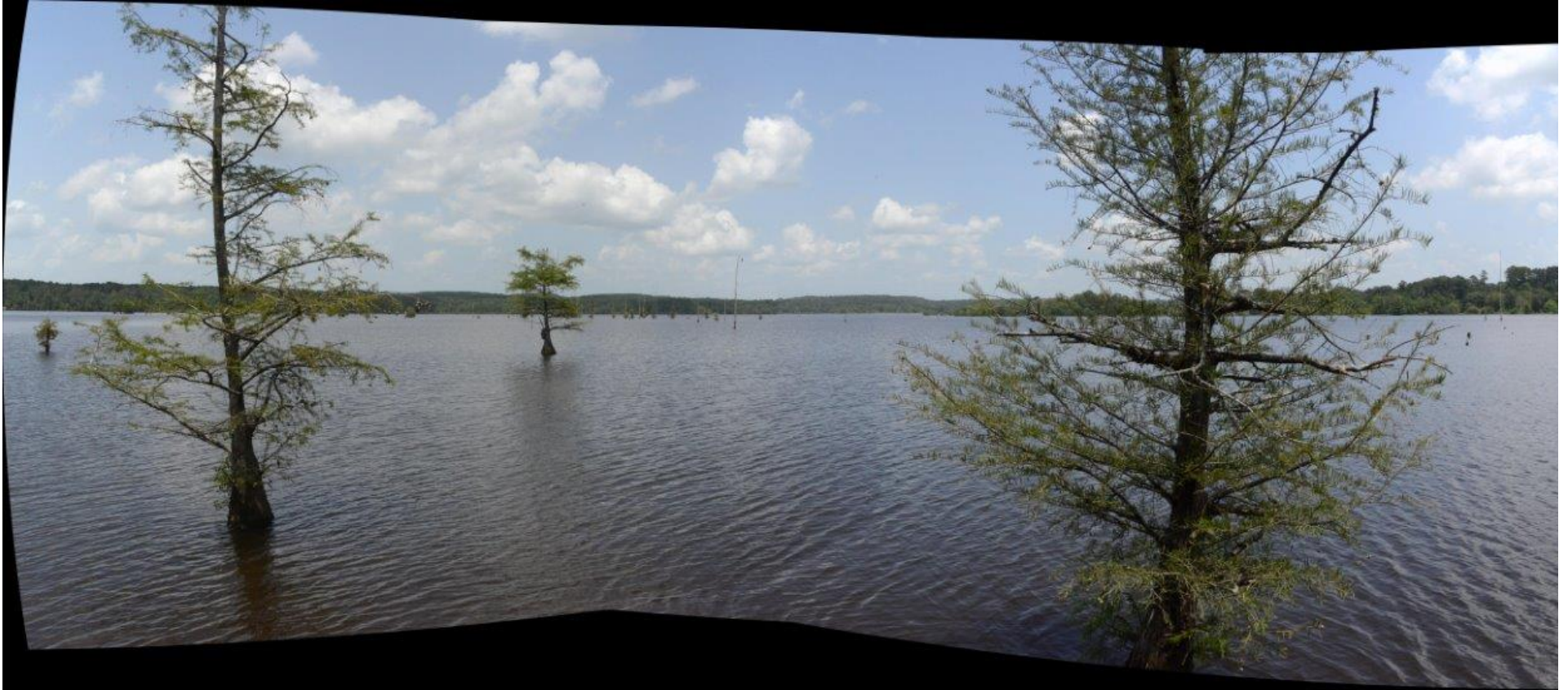
Photo 10 - Wide angle view of the lake where the airplane impacted.