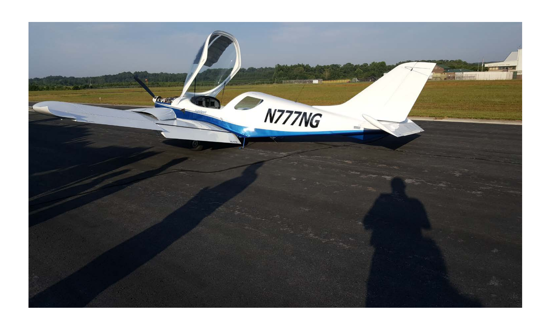
Photo 2 – View of canopy without pull down handle