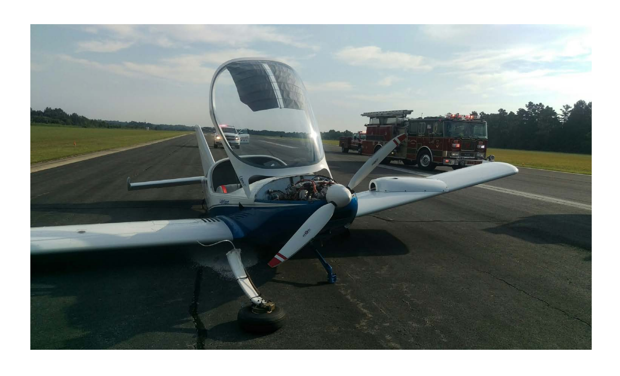
Photo 1-View of airplane without the nose and right main landing gear