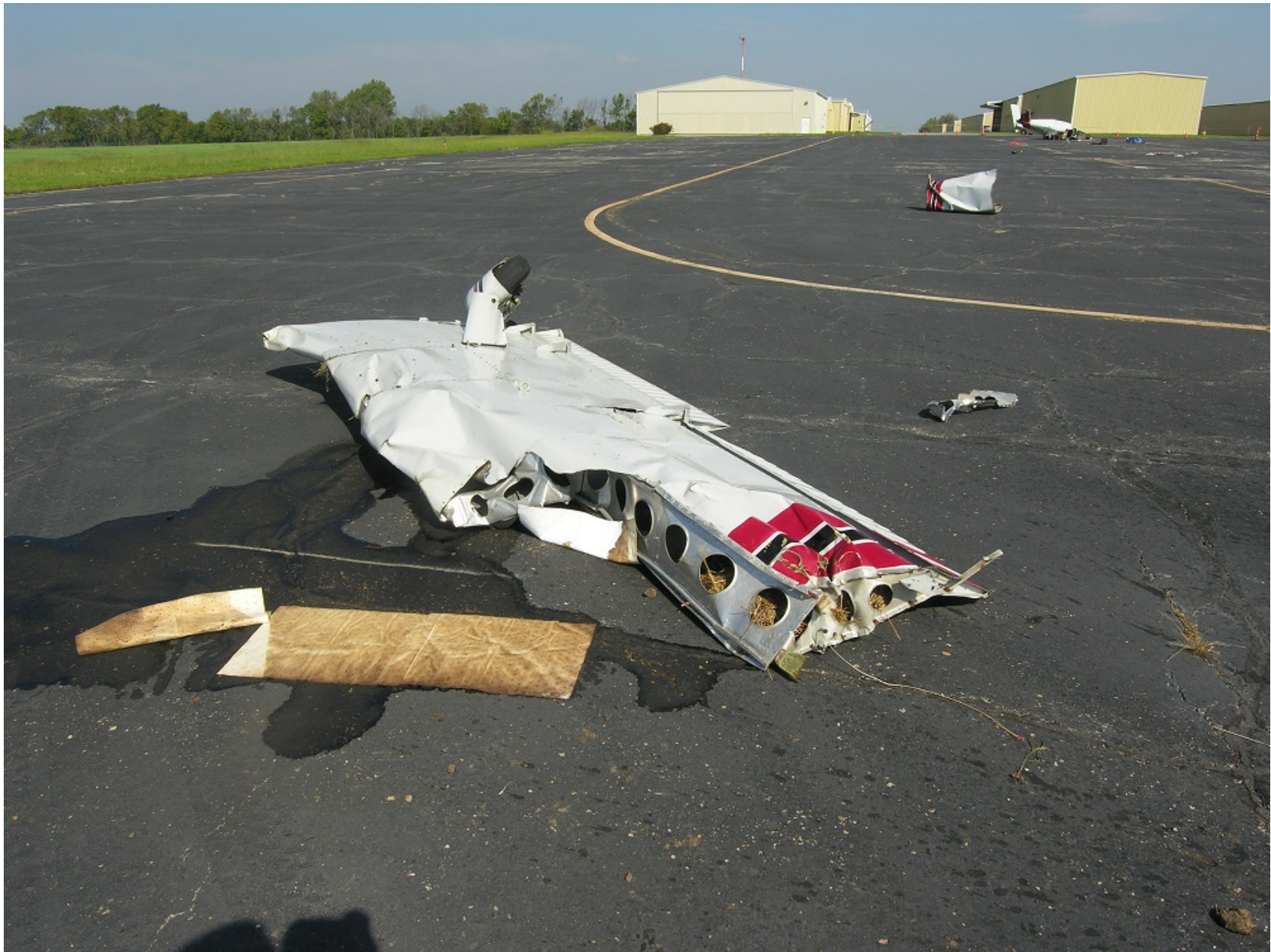
Photo 3 - Wing