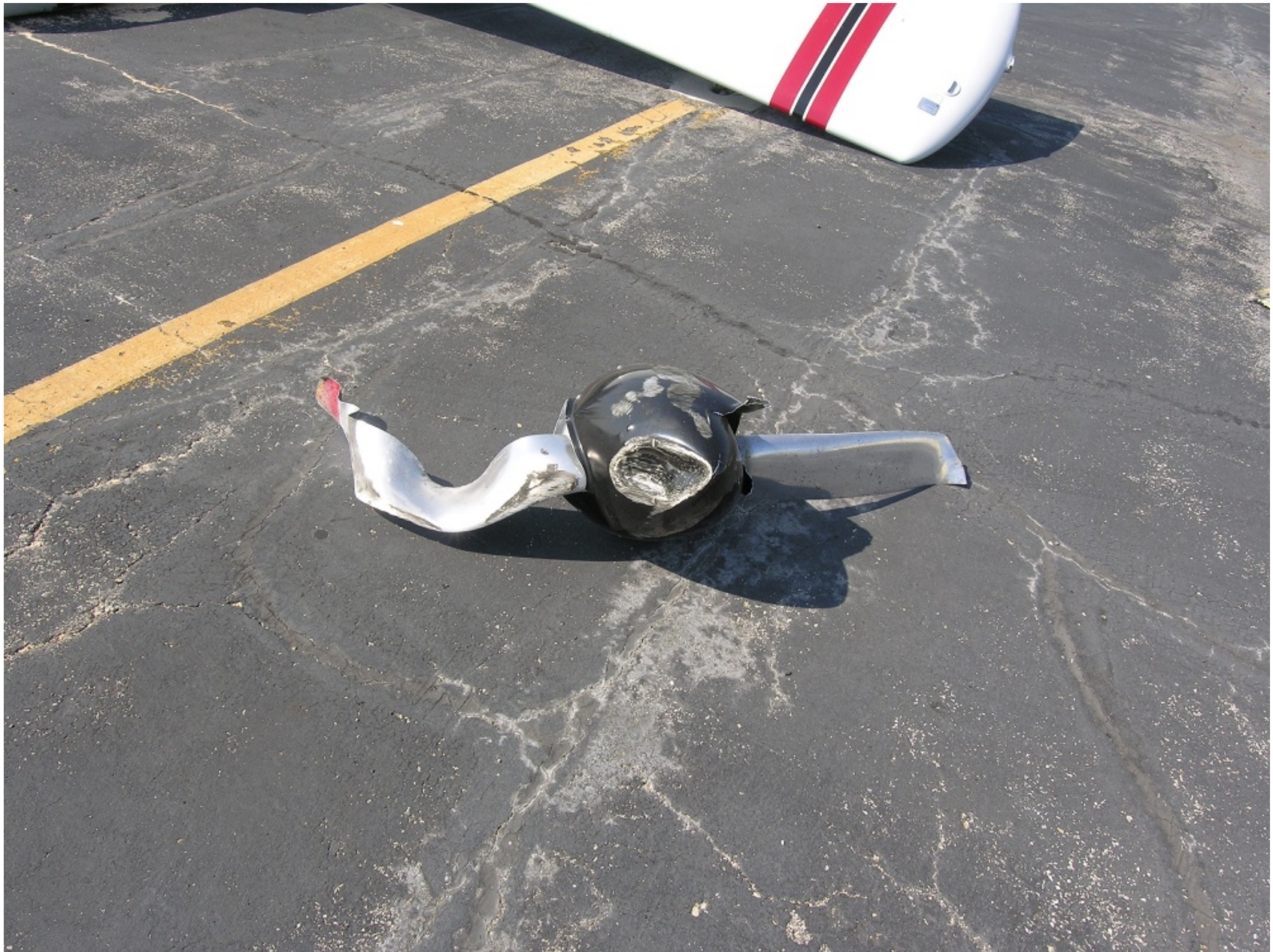
Photo 5 - Propeller