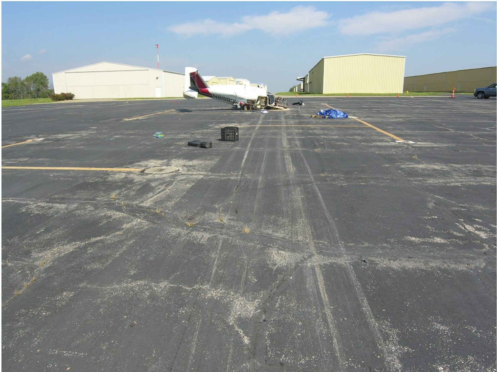
Photo 2 - Wreckage path