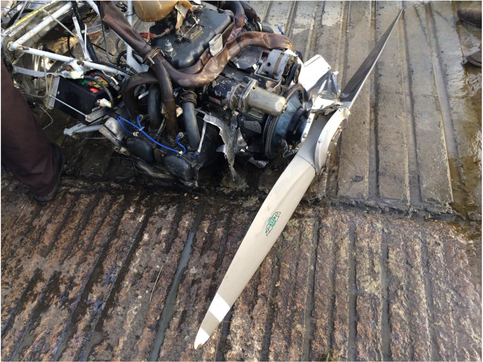
Photo 3 - Engine