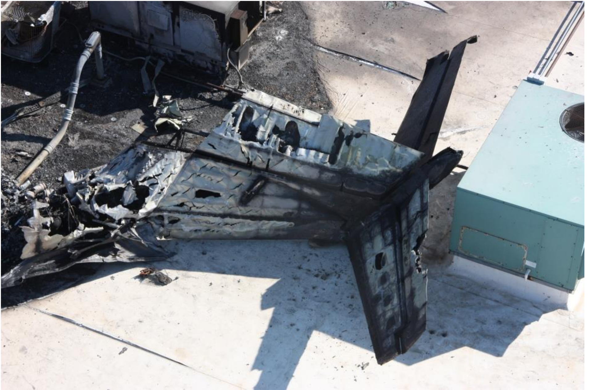
Photo 10 - Tail