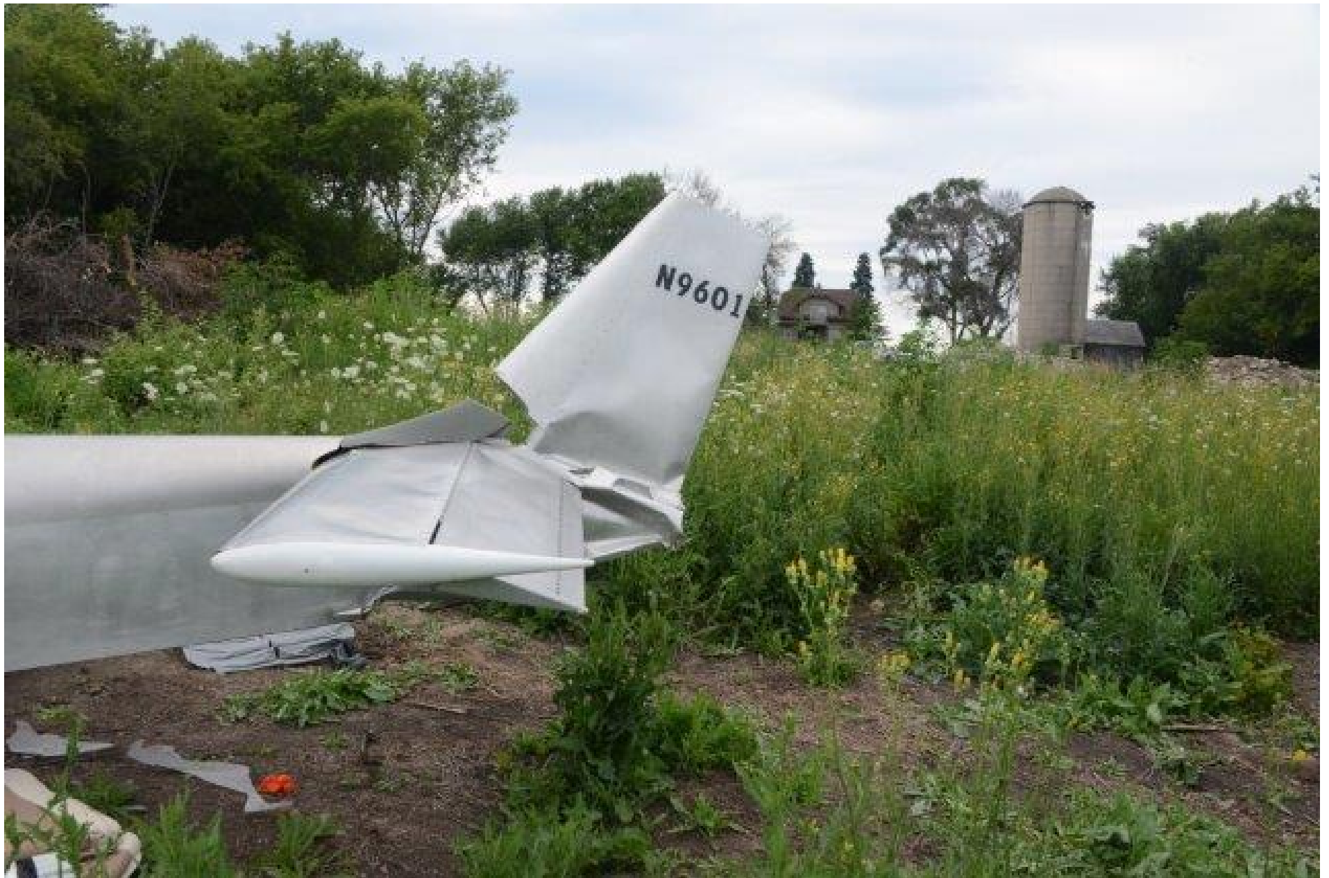
Photo 3 - View of the left side of the empennage.