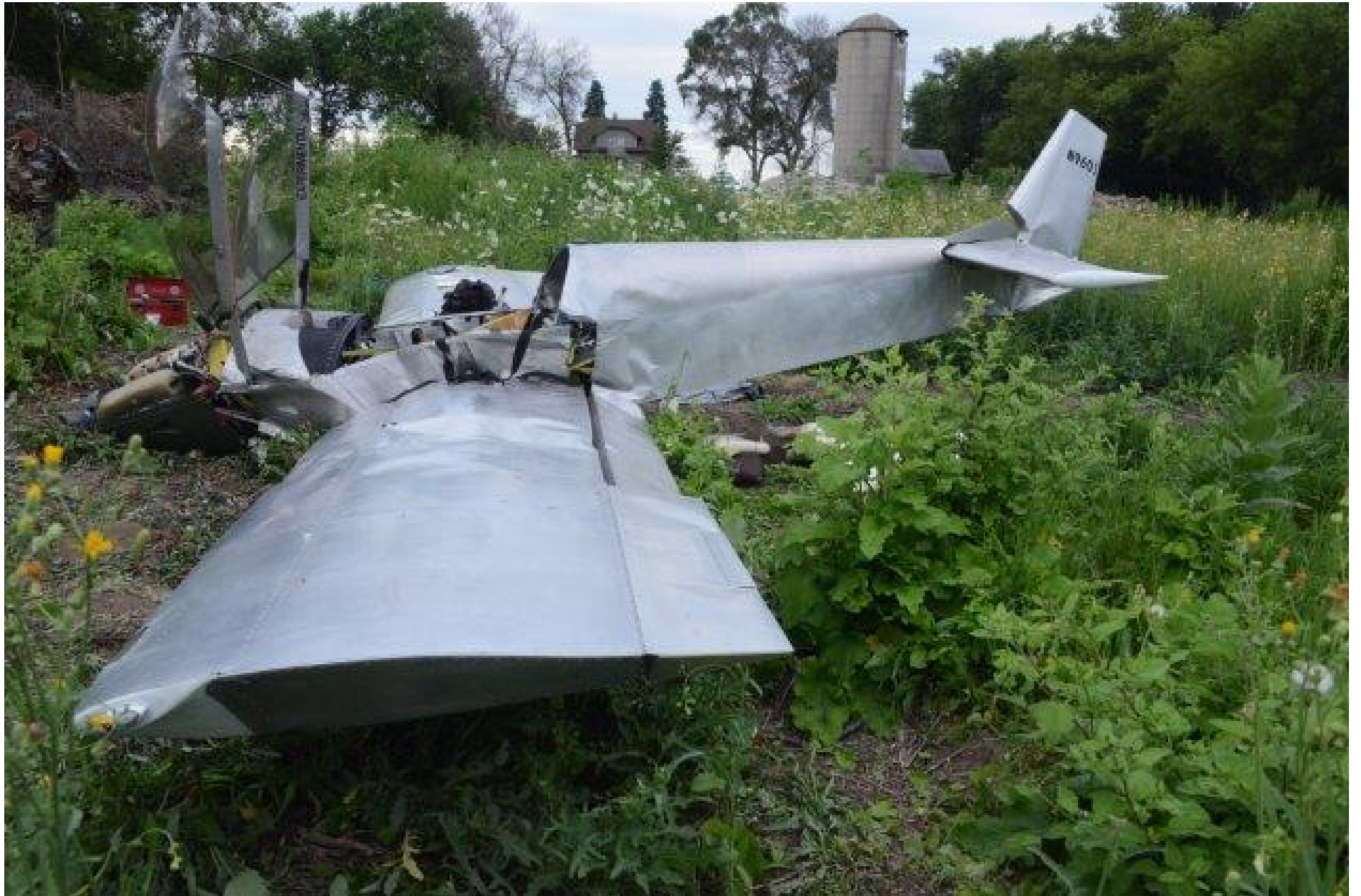
Photo 5 - View of the left side of the airplane.