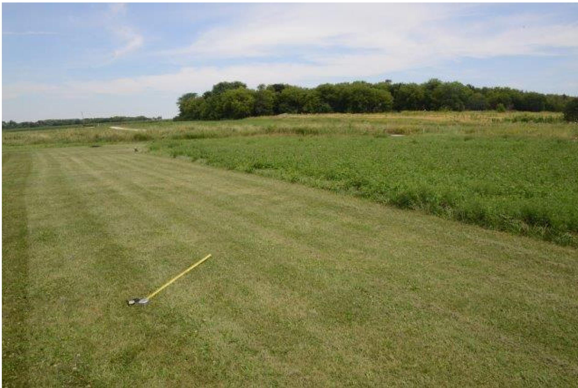
Photo 7 - View from a nearby runway towards the accident site.