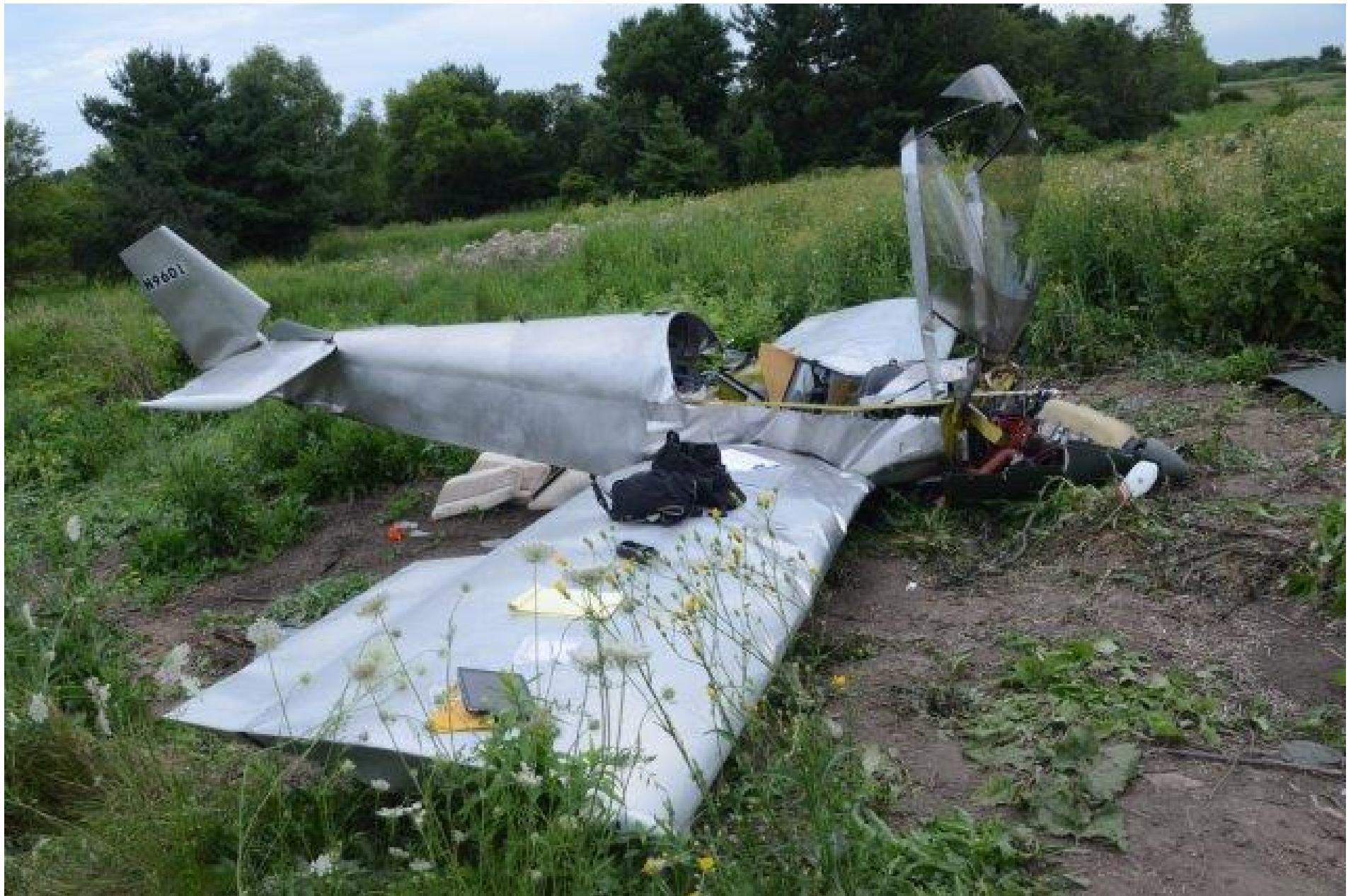
Photo 4 - View of the right side of the airplane.