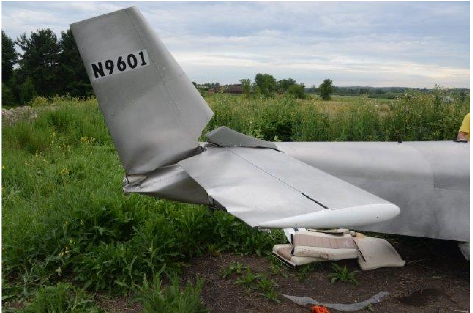
Photo 2 - View of the right side of the empennage.