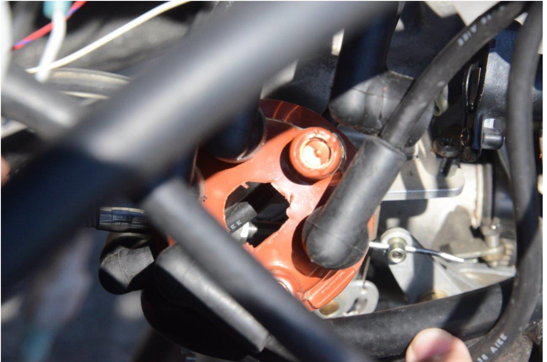
Photo 11 - View of the distributor cap with the separated center tower.