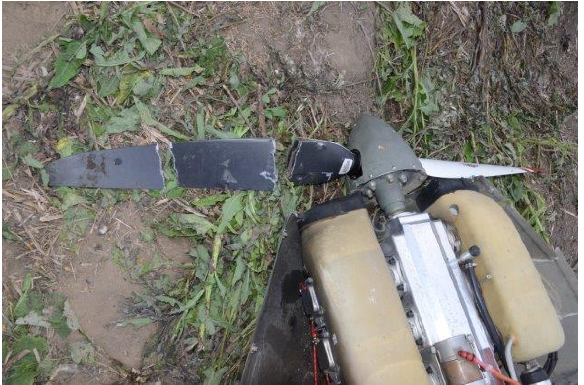
Photo 6 - View of the propeller.