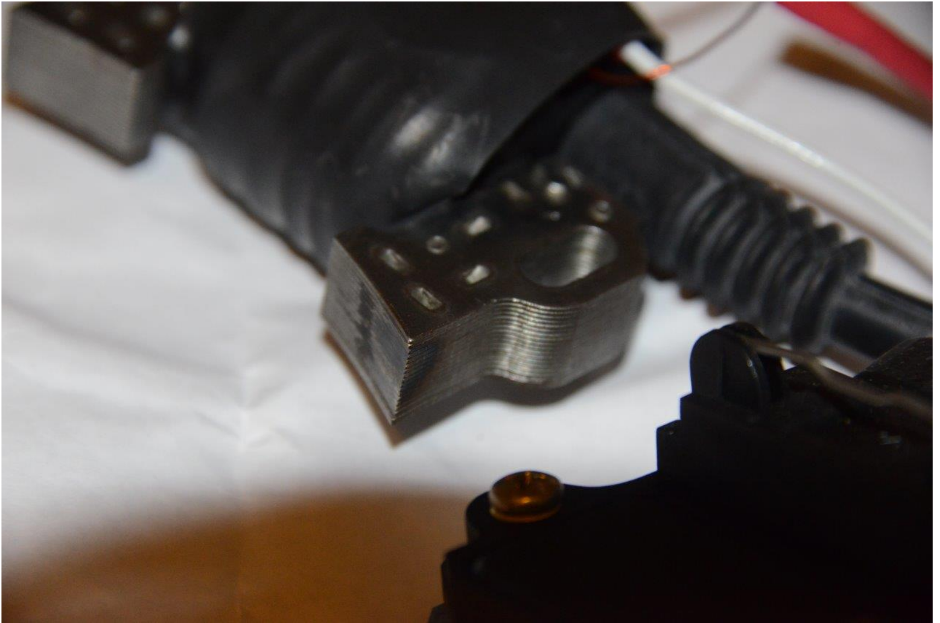
Photo 9 - View of a magneto reported to have been installed on the accident airplane.