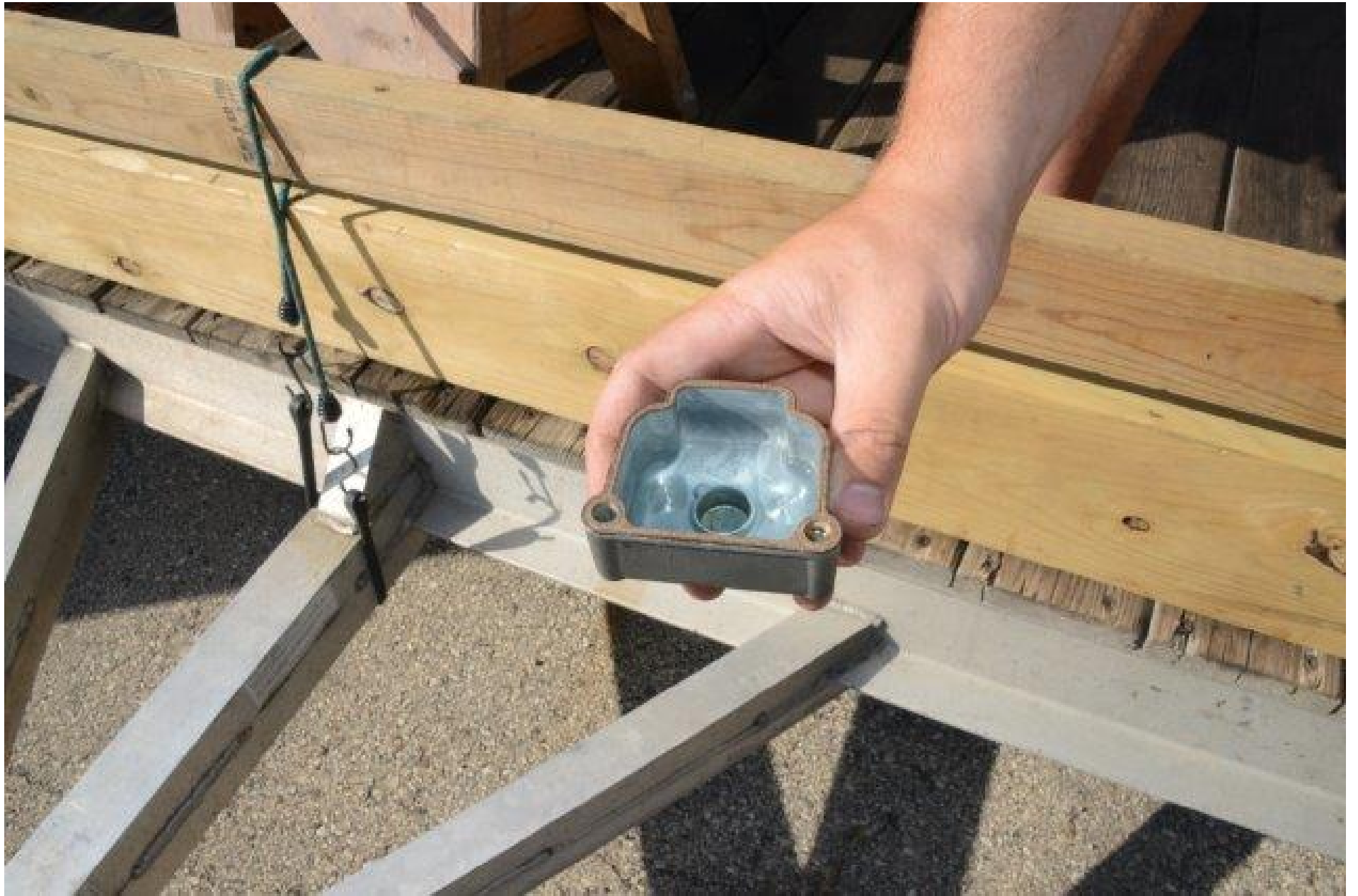
Photo 8 - View of the carburetor bowl with a blue liquid in it.