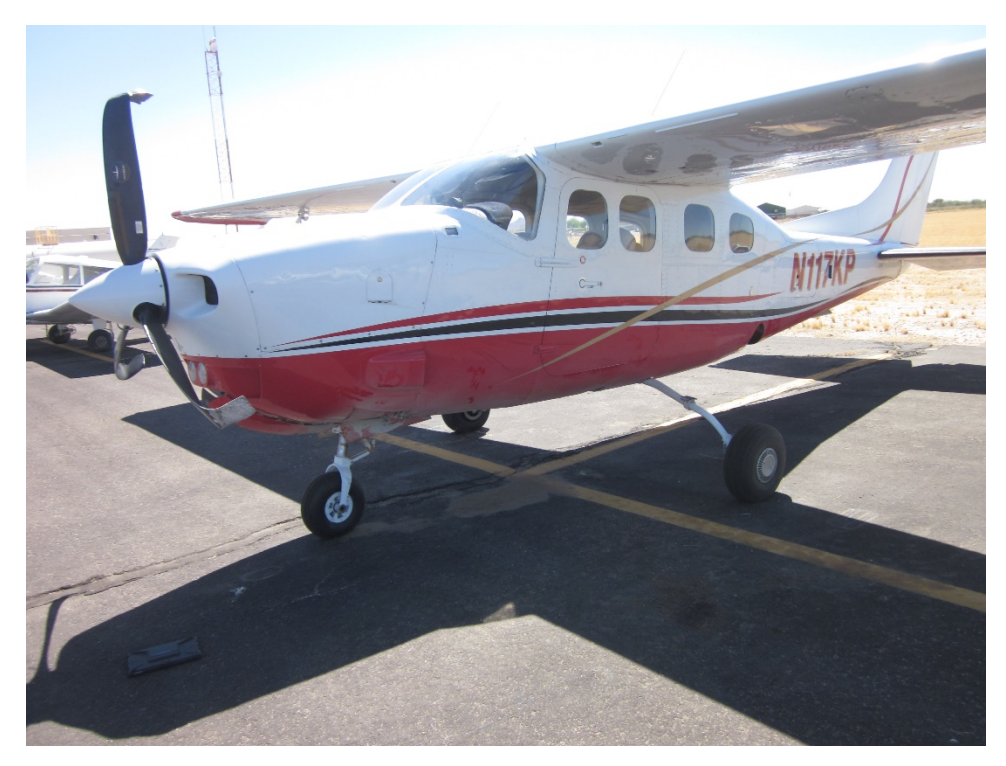
Figure 2: Left side of Engine