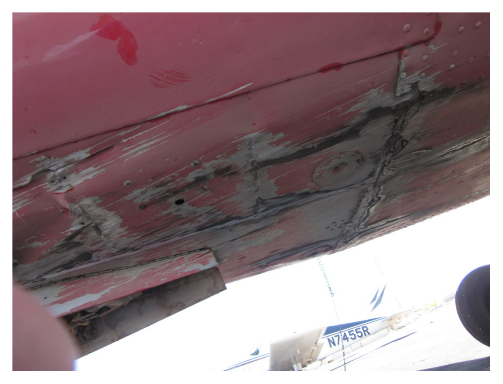
Figure 4: Belly Damage just aft of the Nose landing gear