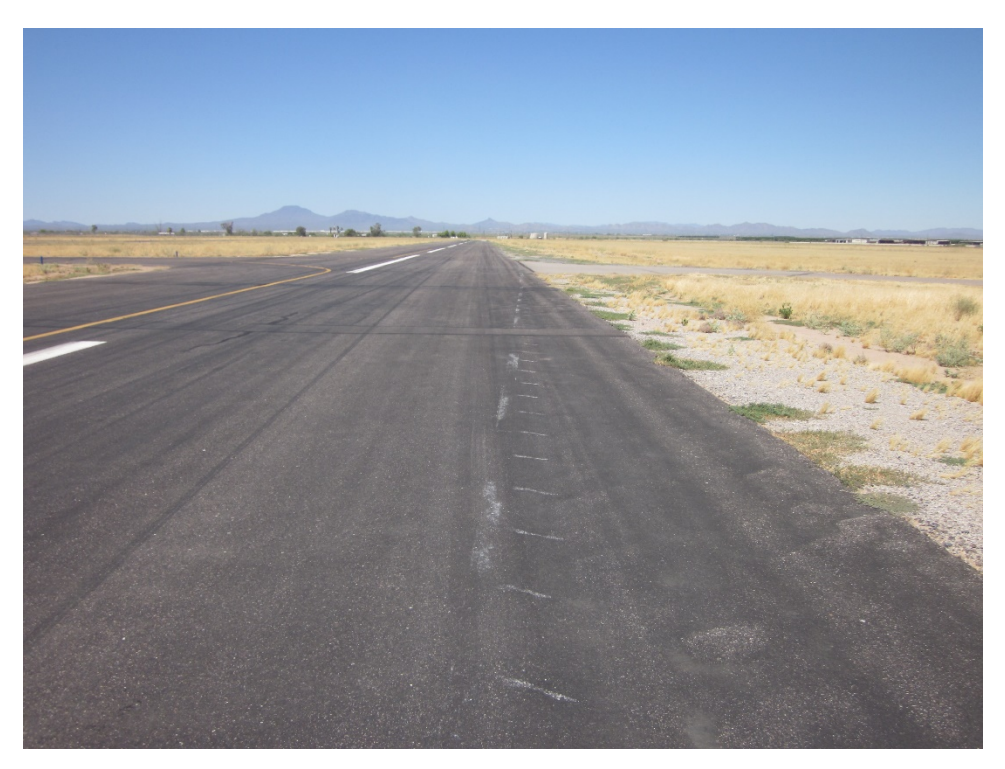
Figure 6: Runway Markings