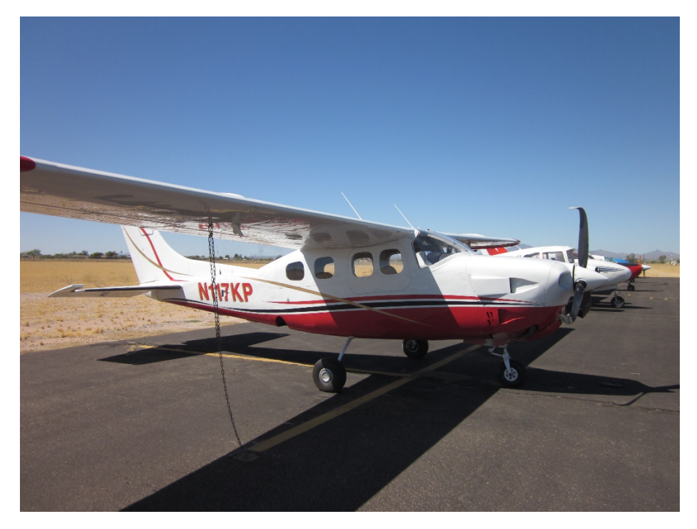
Photographs of N117KP