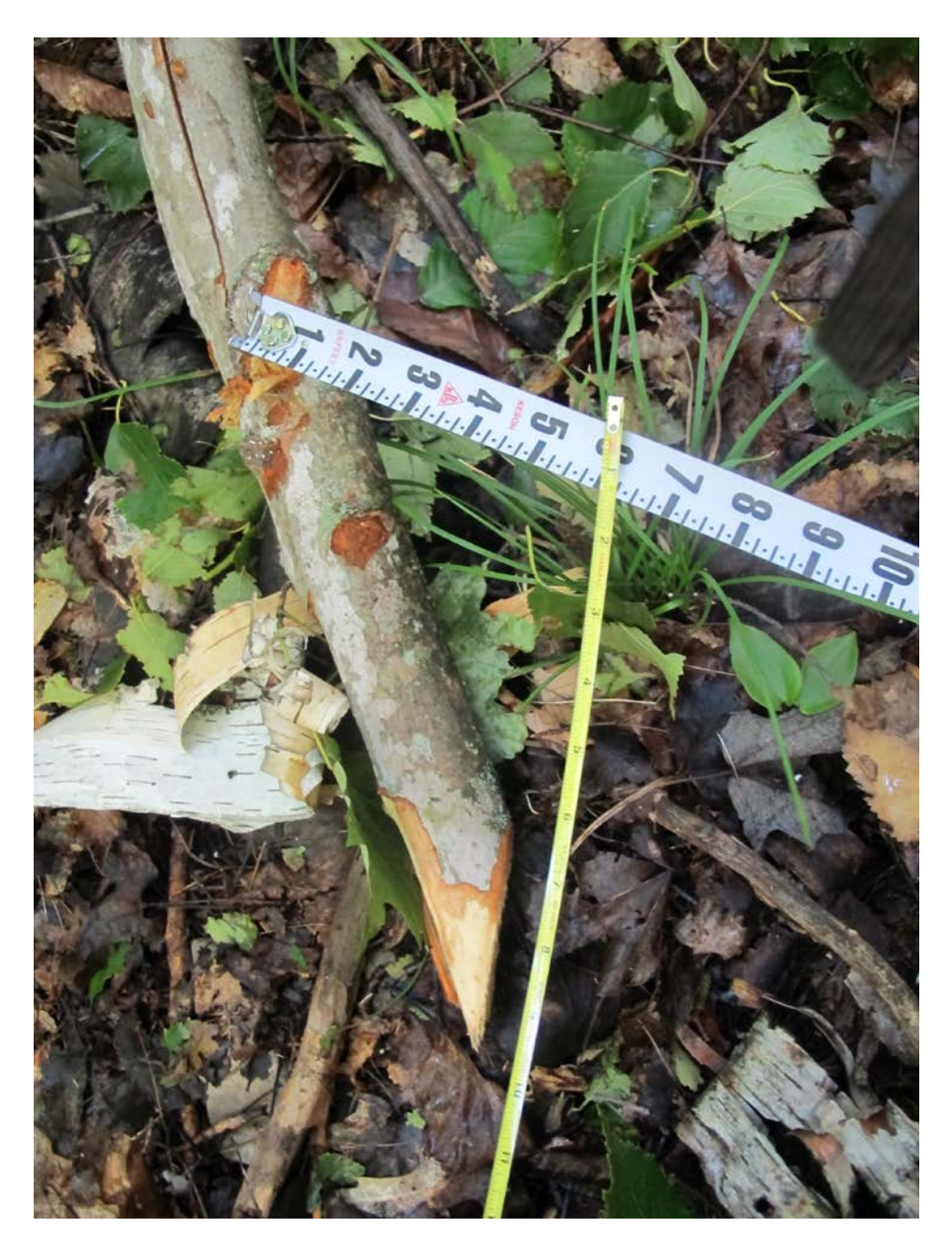
Photo 7 – One of several tree branches which were cut by propeller