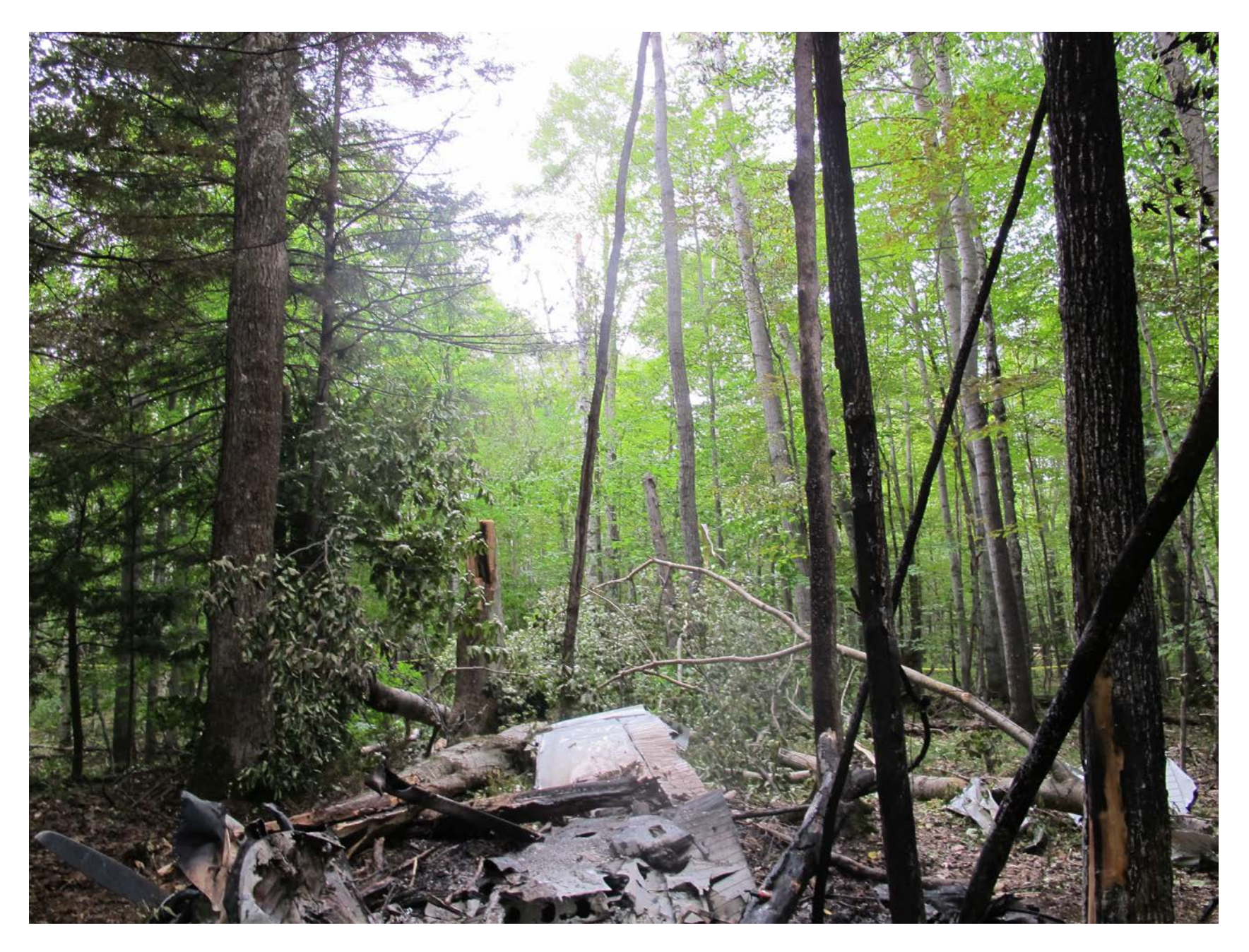
Photo \ 3-View \ of \ accident \ site \ looking \ back \ toward \ the \ airplane's \ descent \ through \ the \ trees