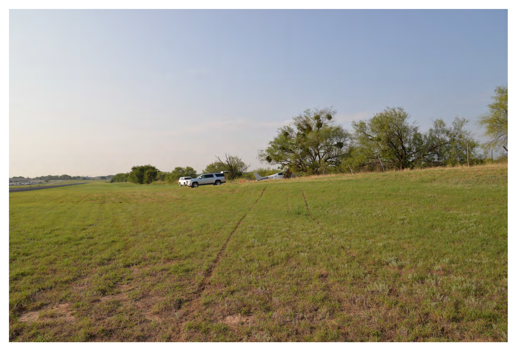
Photo 11 - View of ground scars in the grass looking towards the wreckage.