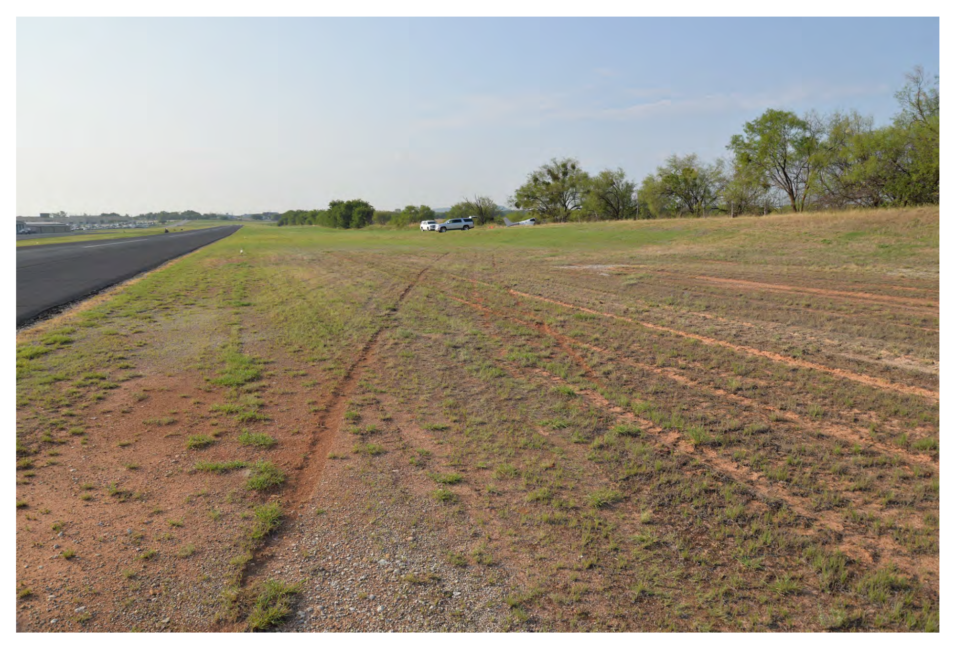
Photo 10 - Close-up view of ground scars in the grass near the runway edge looking towards the wreckage.