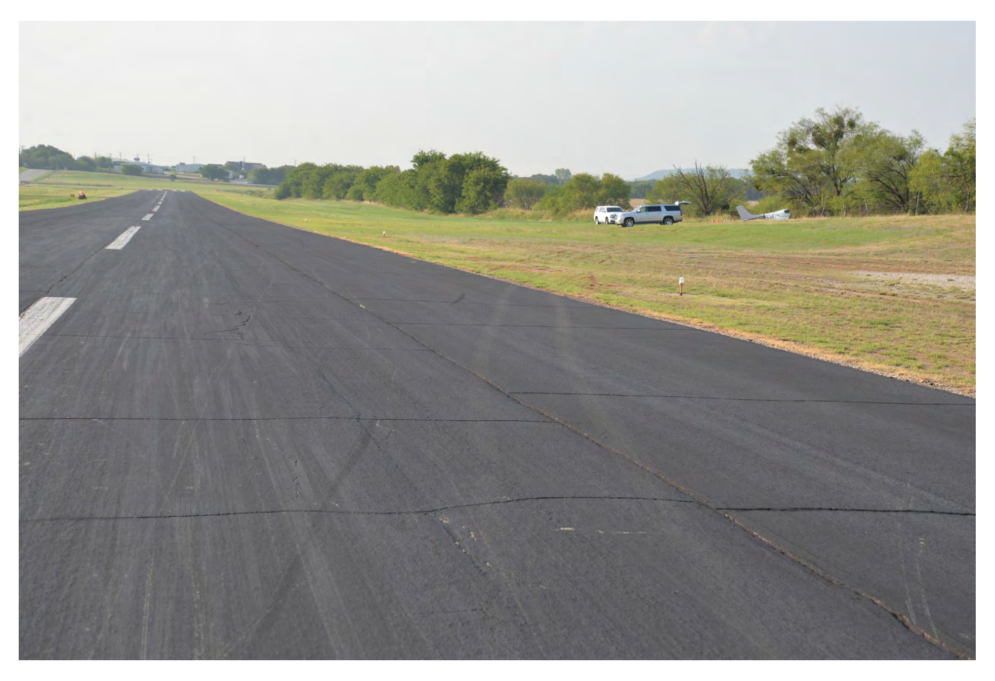
Photo 7 - Close-up view of the runway looking towards the wreckage.