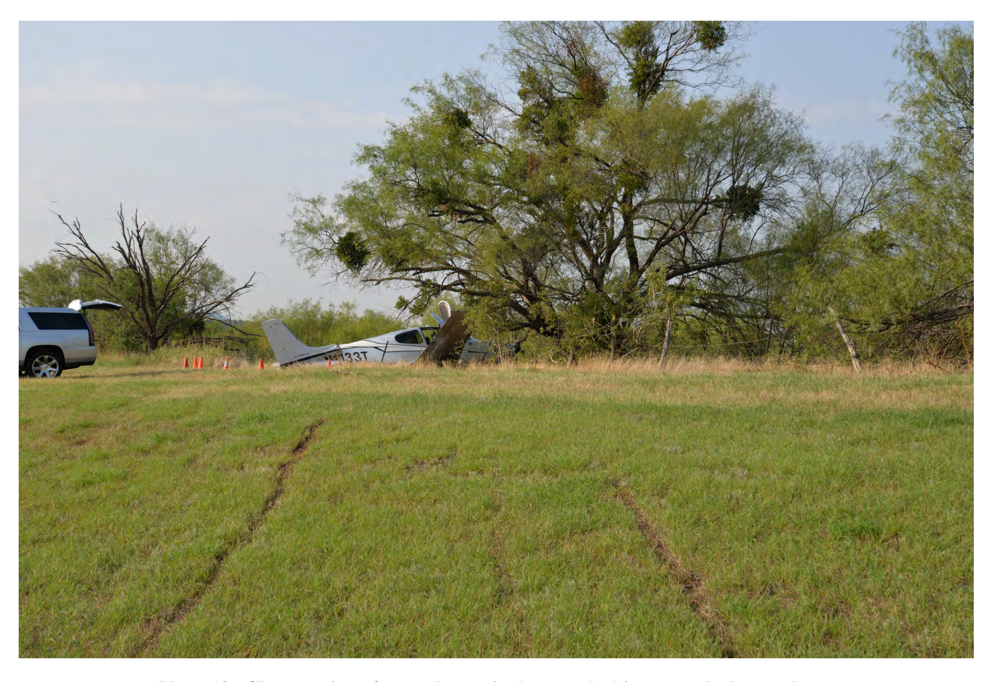
Photo 12 - Close-up view of ground scars in the grass looking towards the wreckage.