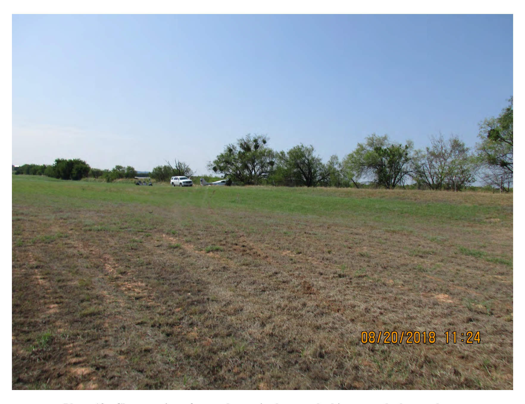
Photo 13 - Close-up view of ground scars in the grass looking towards the wreckage.