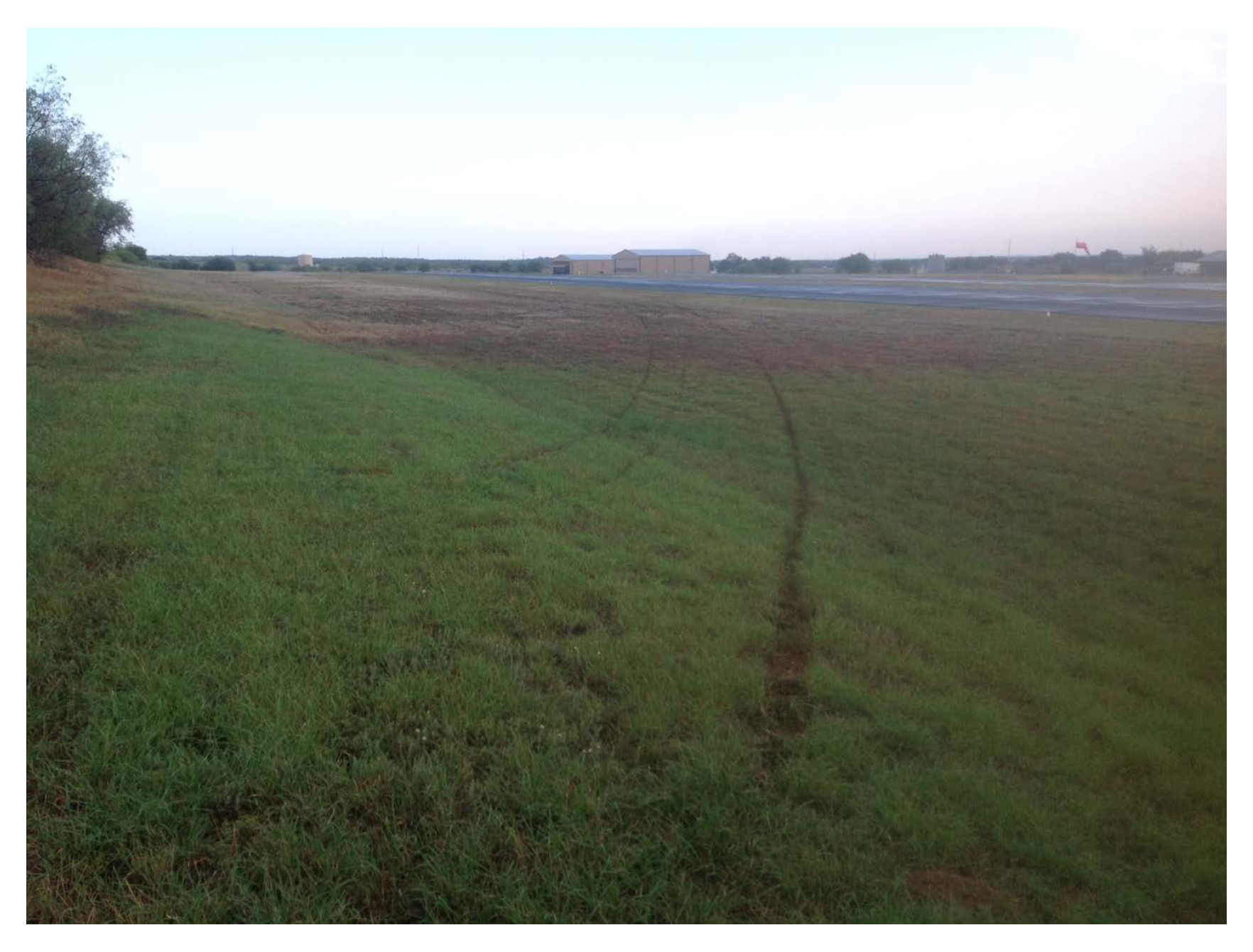
Photo 1-View\ of\ the\ ground\ scars\ through\ the\ grass\ with\ the\ runway\ in\ the\ background.