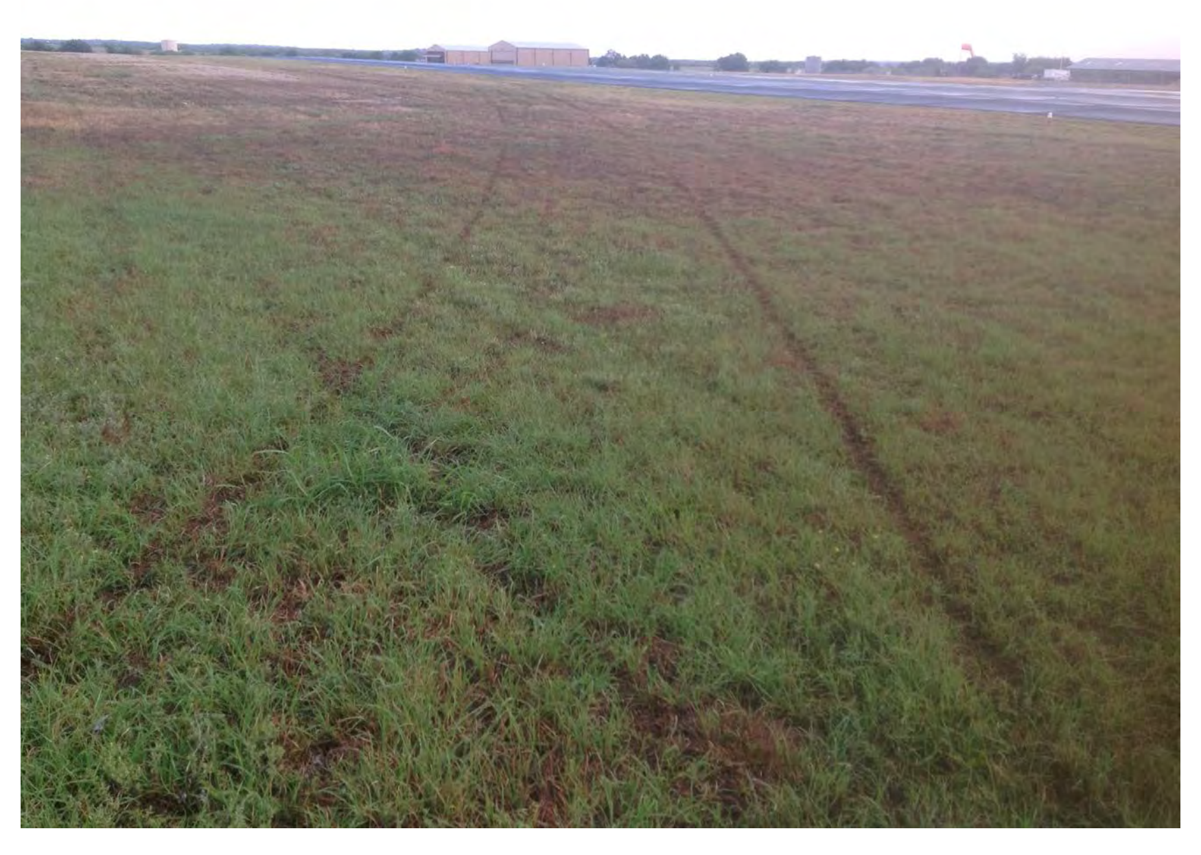
Photo 2 - View of the ground scars through the grass with the runway in the background.