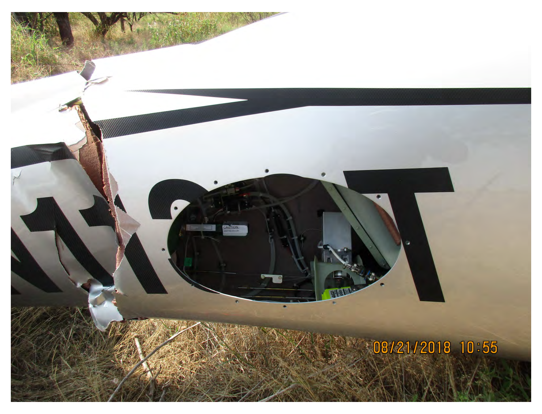
Photo 14 - View of an open fuselage panel. The yaw damper servo is inside the panel opening.