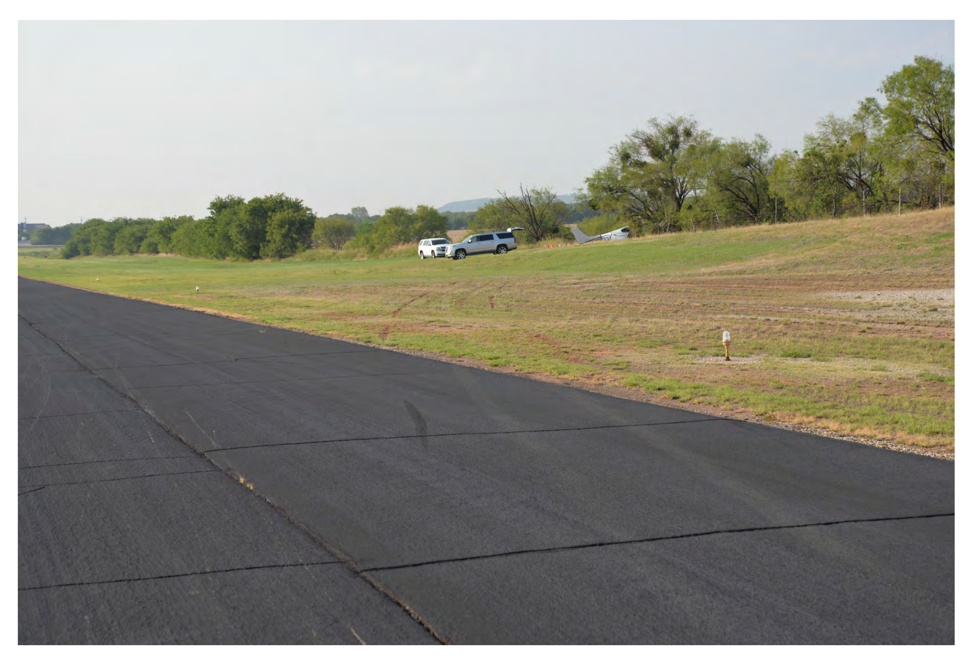
Photo 8 - Close-up view of the runway looking towards the wreckage.