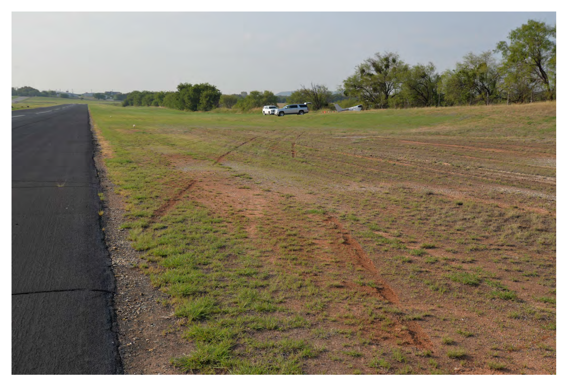
Photo 9 - Close-up view of ground scars in the grass near the runway edge looking towards the wreckage.