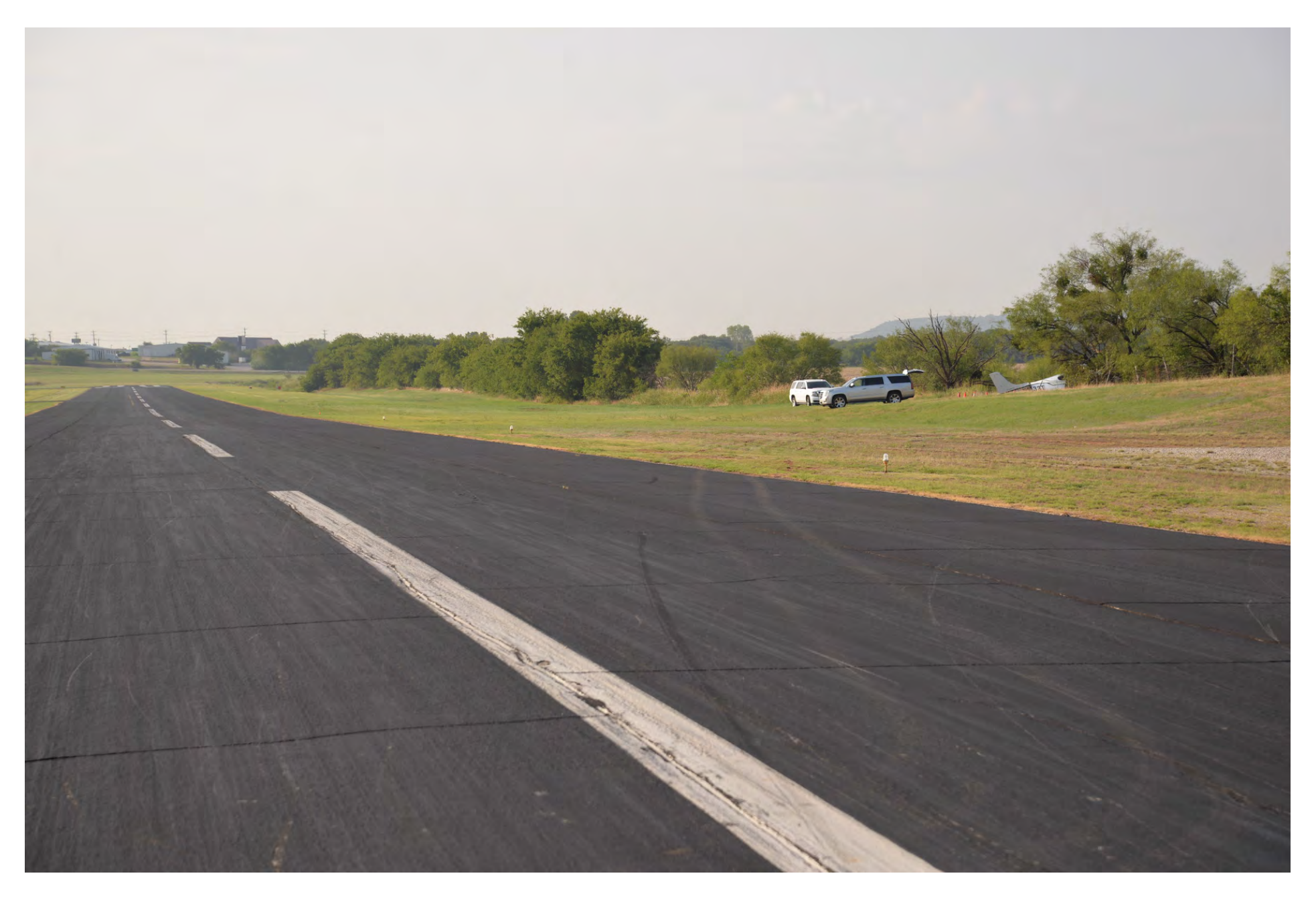
Photo 6 - Close-up view of the runway looking towards the wreckage.