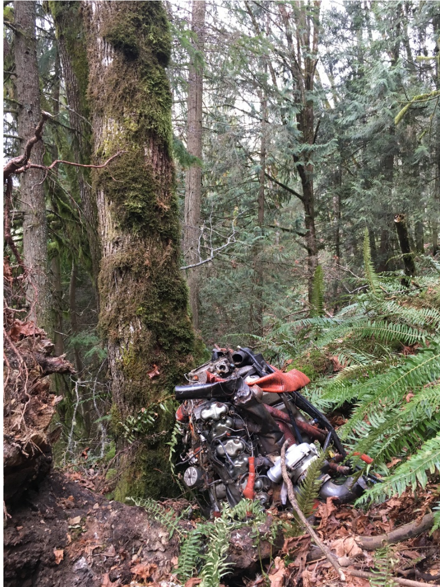
Photo 8 - Engine separated from the wreckage, leaning against a tree at the end of the debris field.