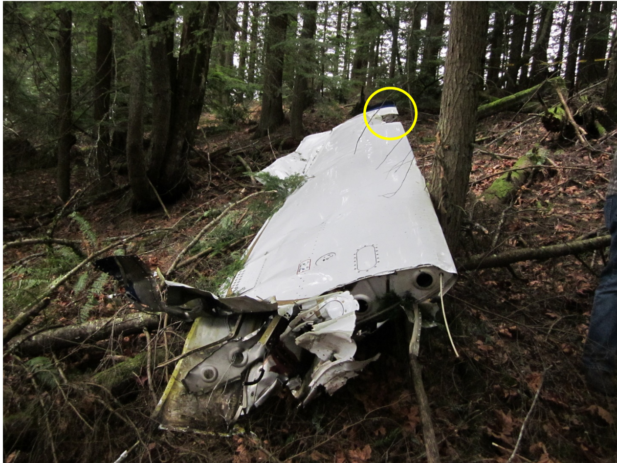
Photo 4 - Left wing exhibiting tree strike at outer section.