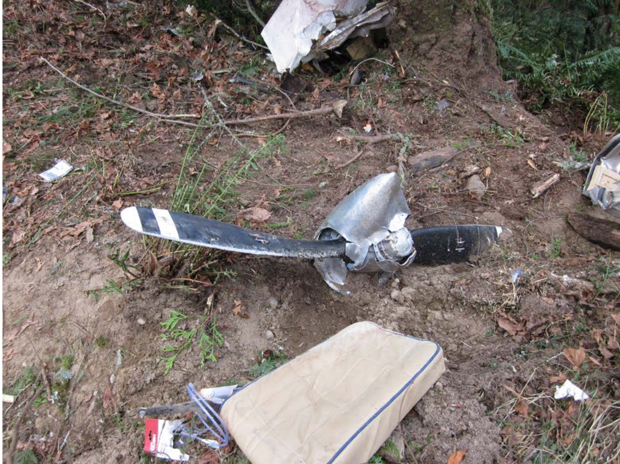
Photo 3 - Propeller