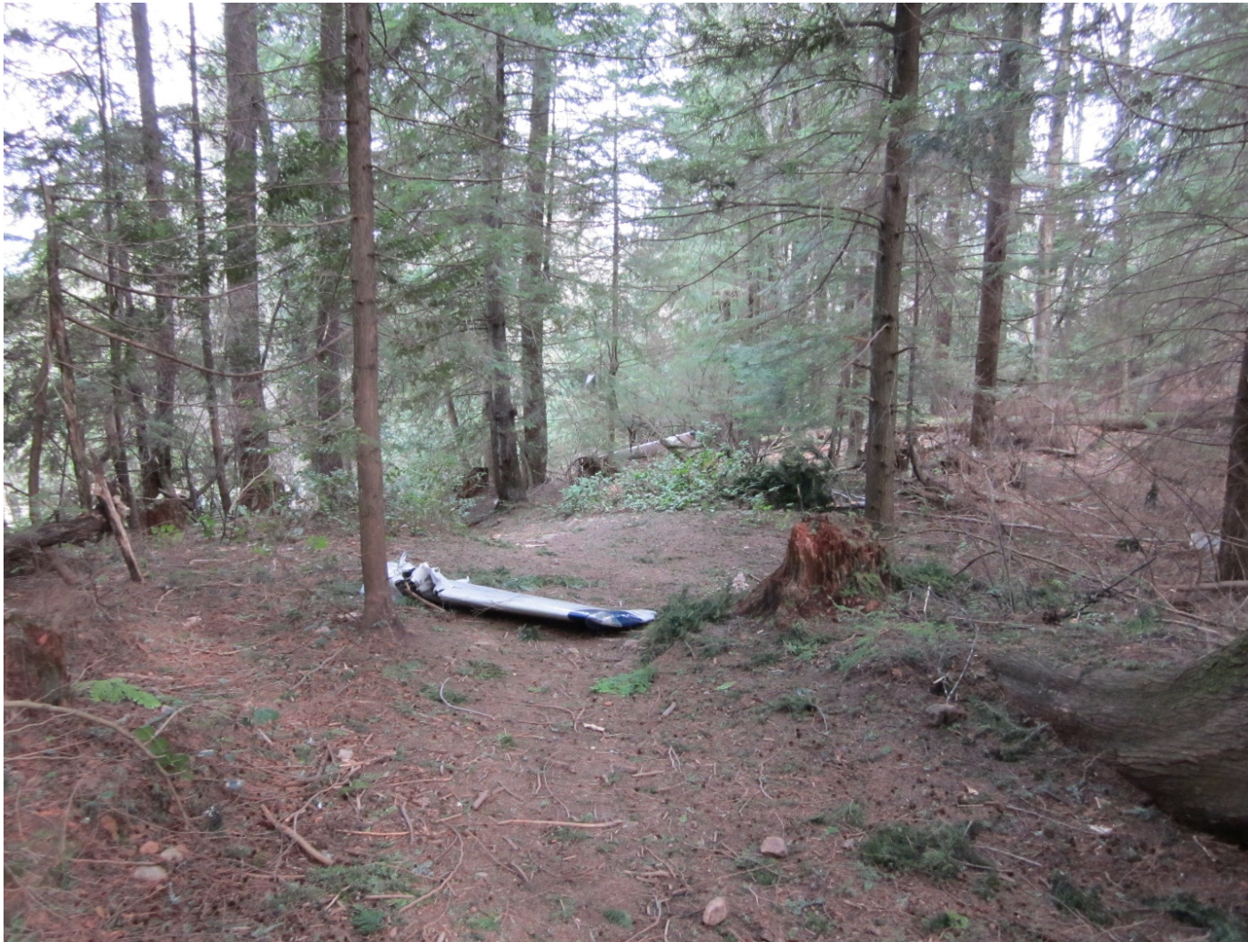
Photo 7- Right separated outboard wing near initial impact site.