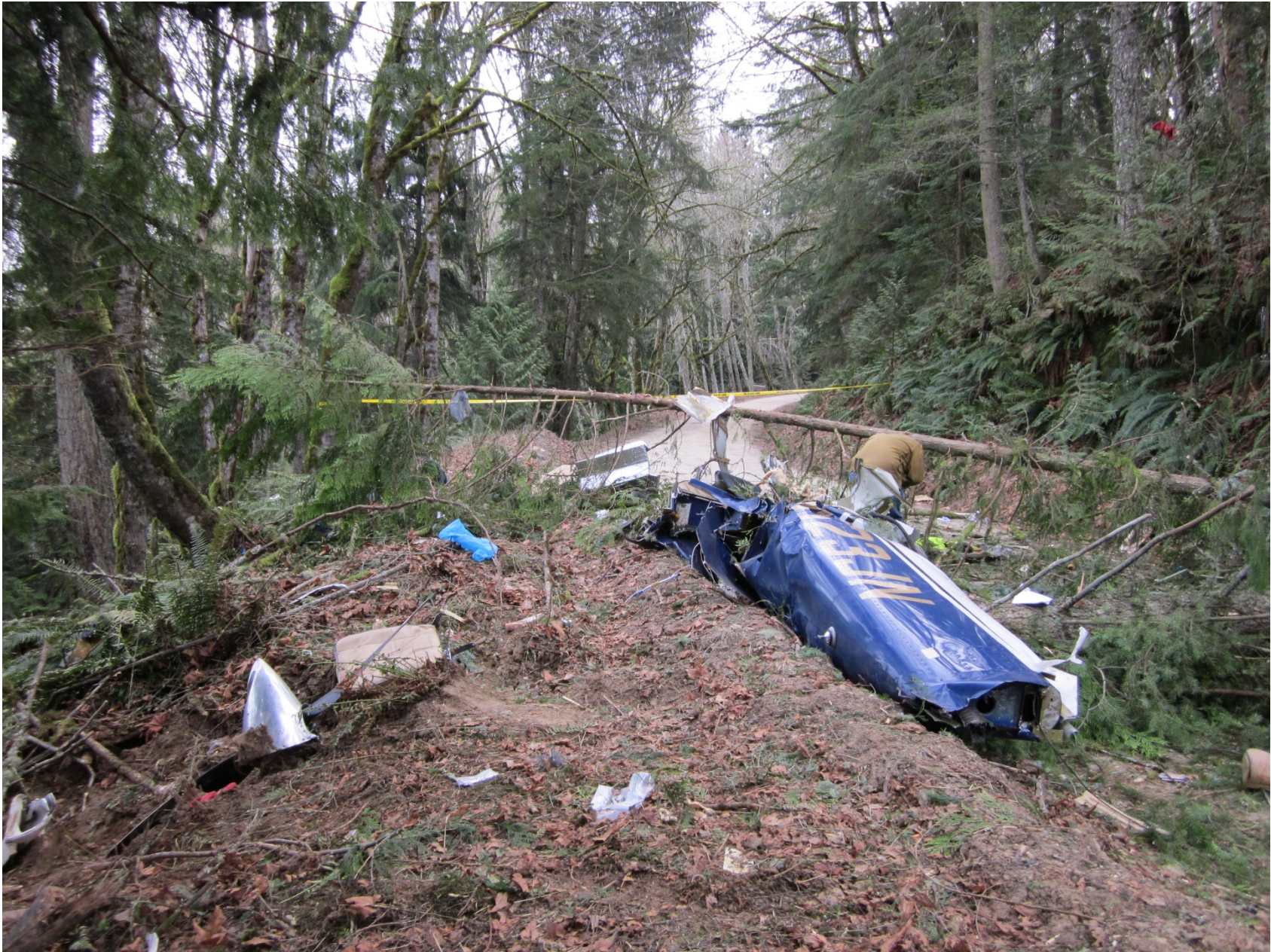
Photo 2 - Main wreckage site indicating aft fuselage and propeller.