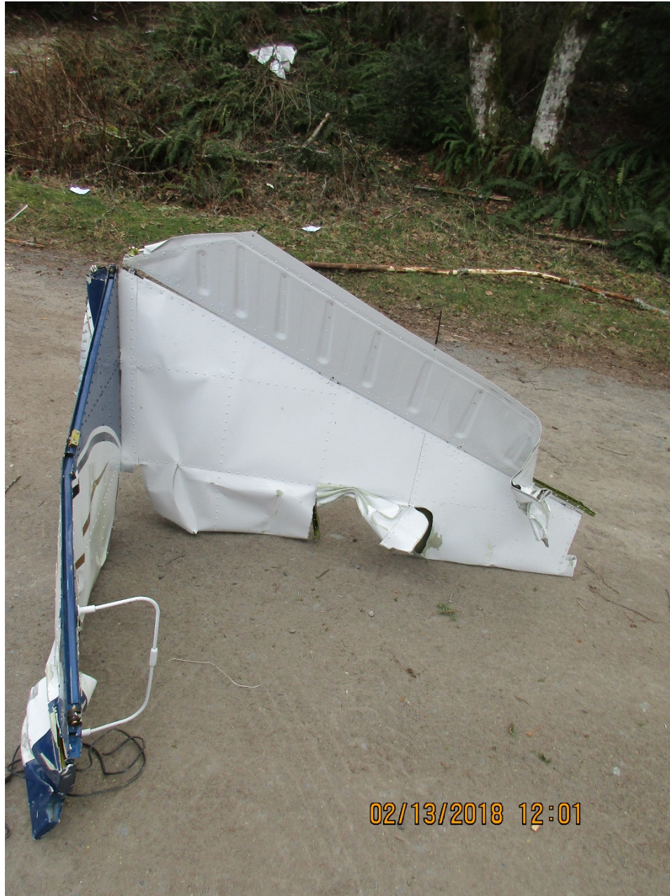
Photo 5 - Vertical and left horizontal stabilizer.