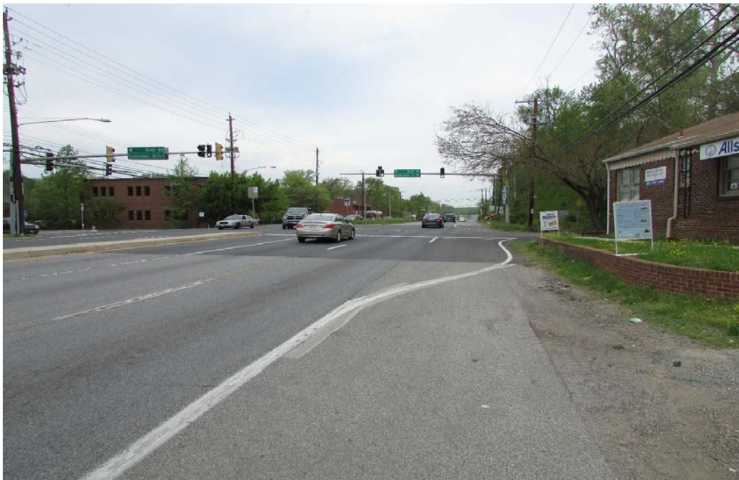
Photo #8: Daytime photo showing the direction of travel of striking vehicle and approach to the crash intersection.