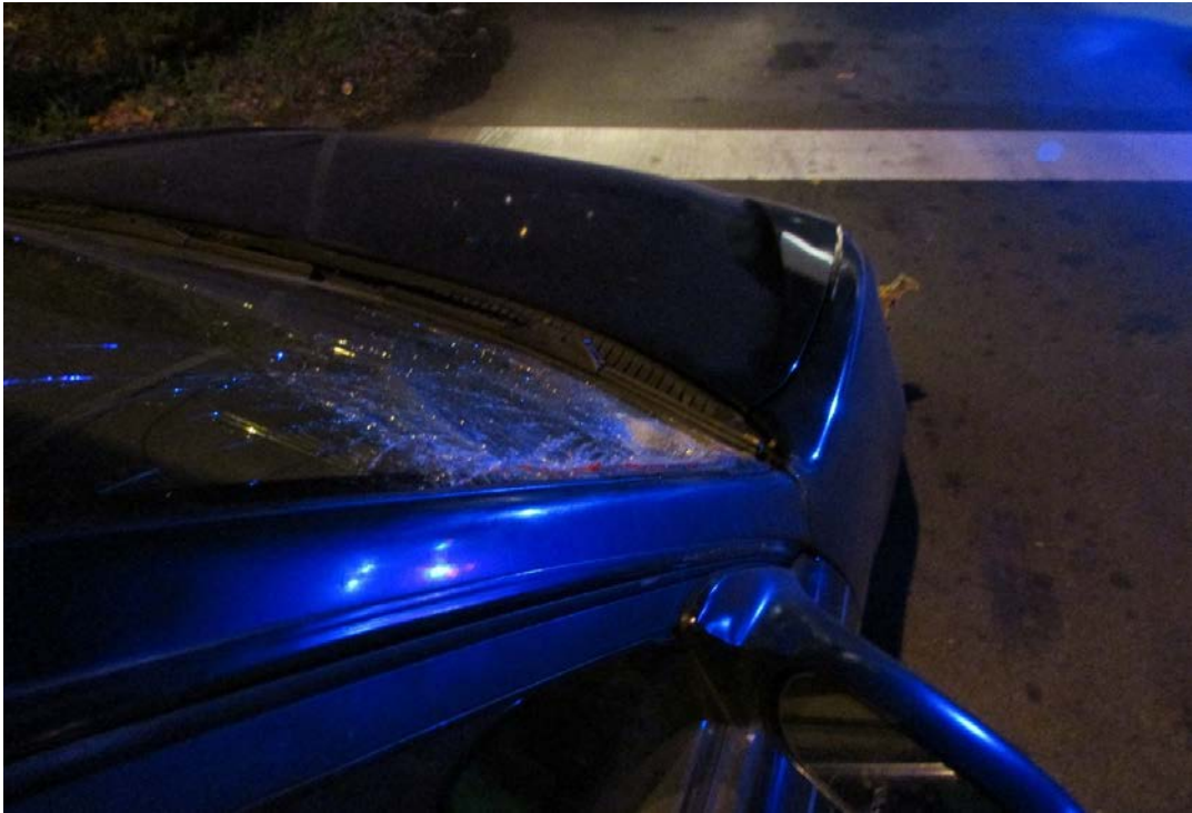
Photo #3: Overhead view of damage to windshield caused by impact with pedestrian