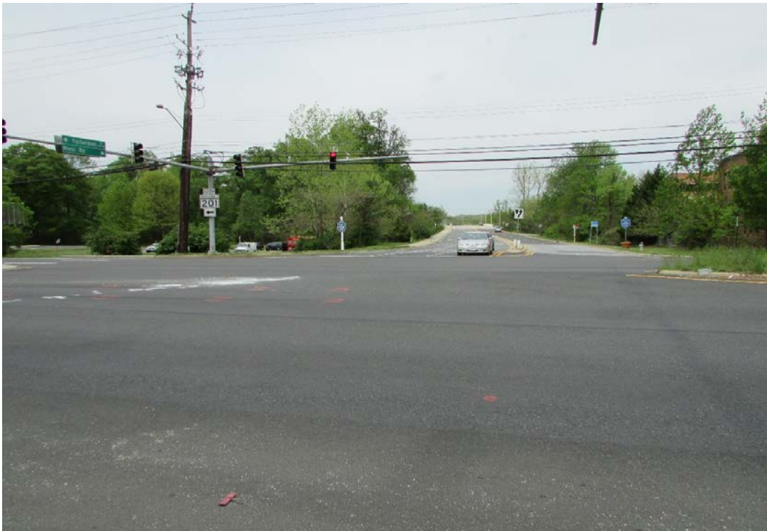
Photo #9: Daytime photograph of the intersection showing the direction of the approach of the pedestrian.