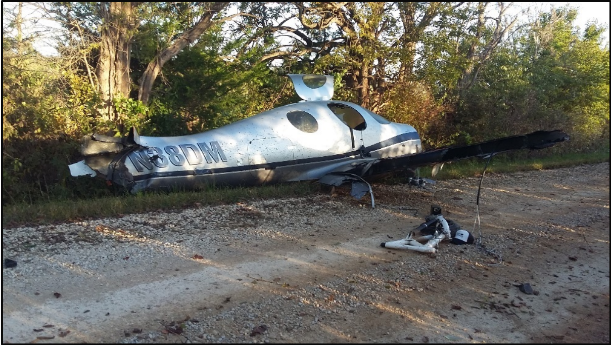
Figure 1: Airplane at the Accident Site, as Viewed from the Right Side