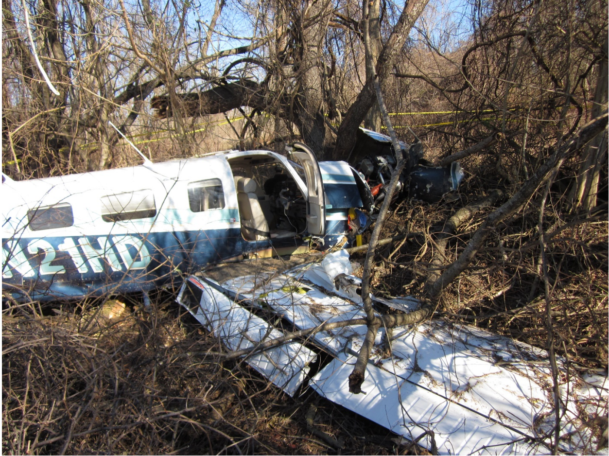
Figure 1 Right side view of the wreckage