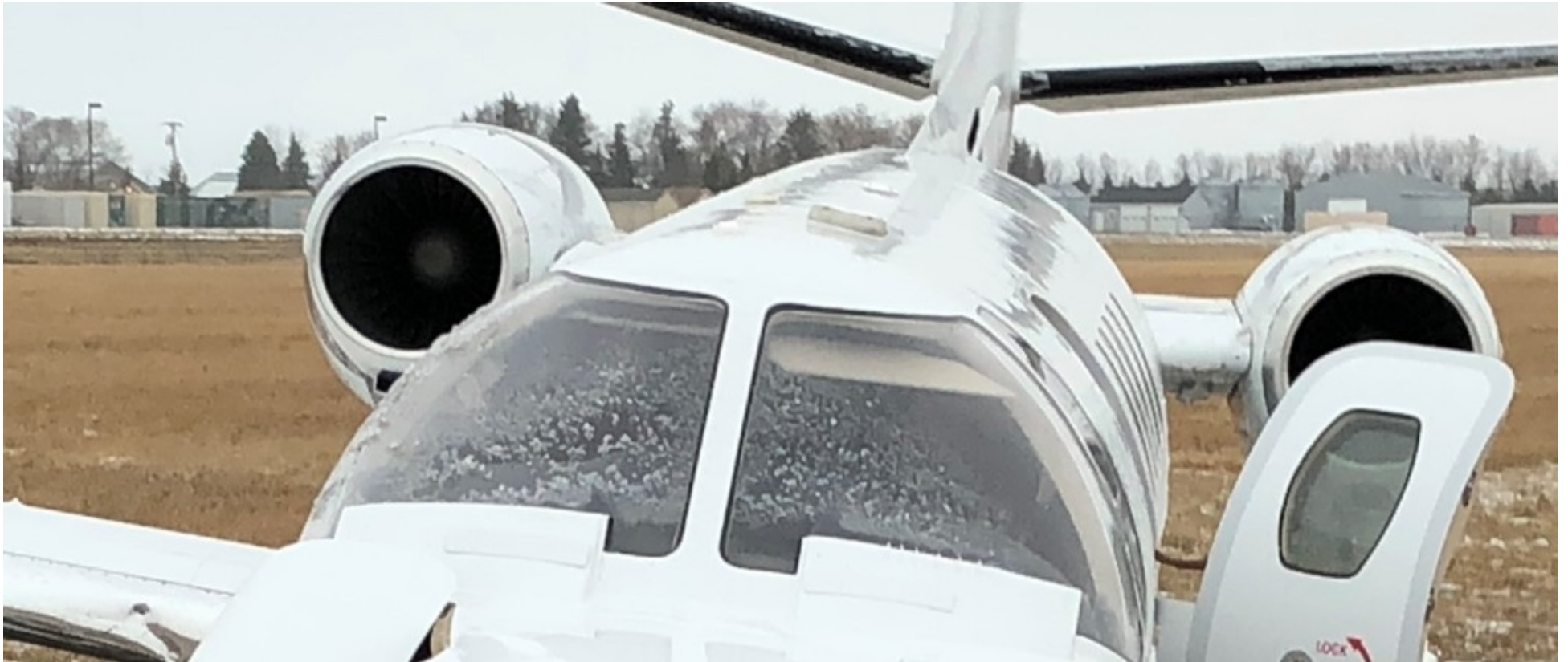
Photo 5 – View of the ice build-up on the airplane’s windshield