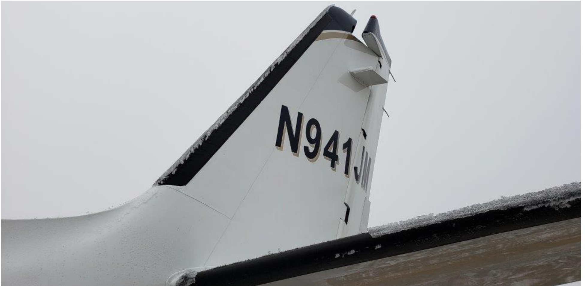
Photo 13 – View of ice build-up of left horizontal and vertical stabilizer