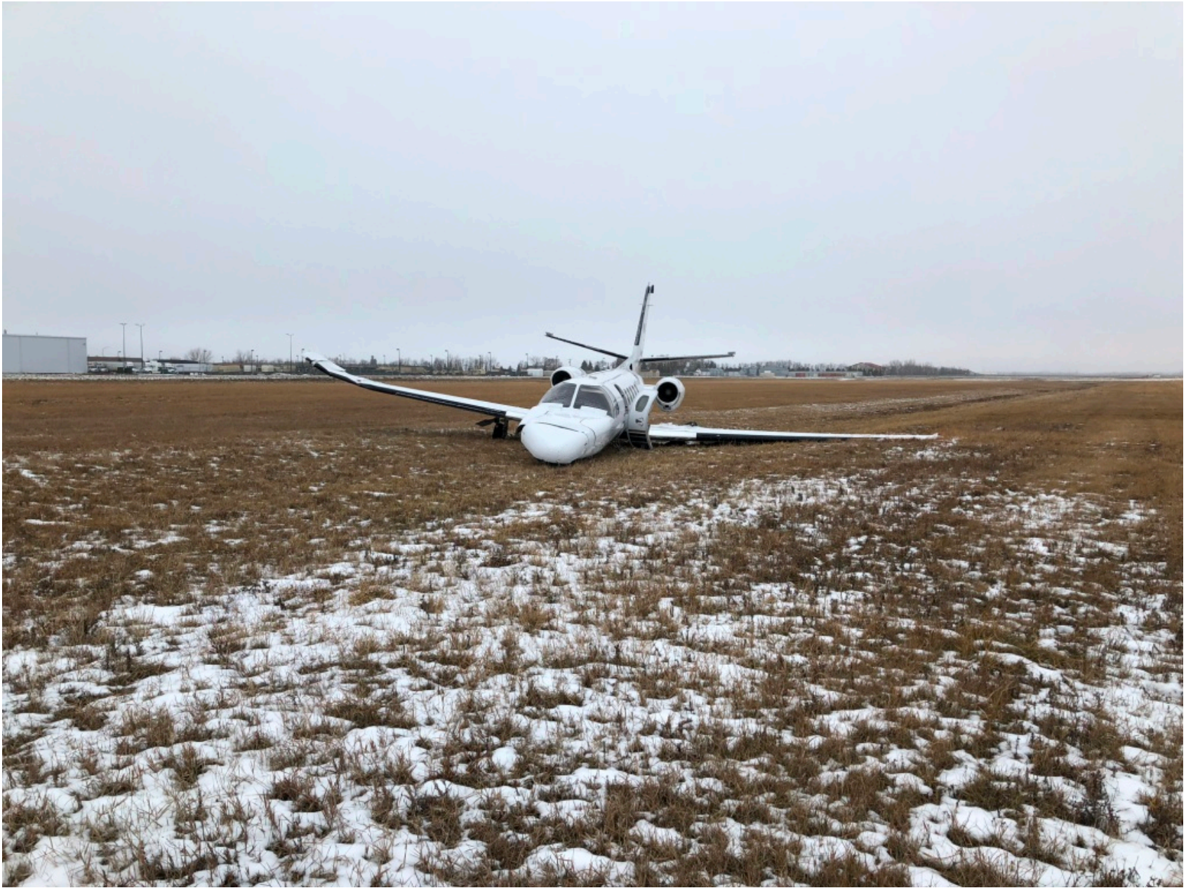
Photo 3 – View of the accident site from the front of the airplane