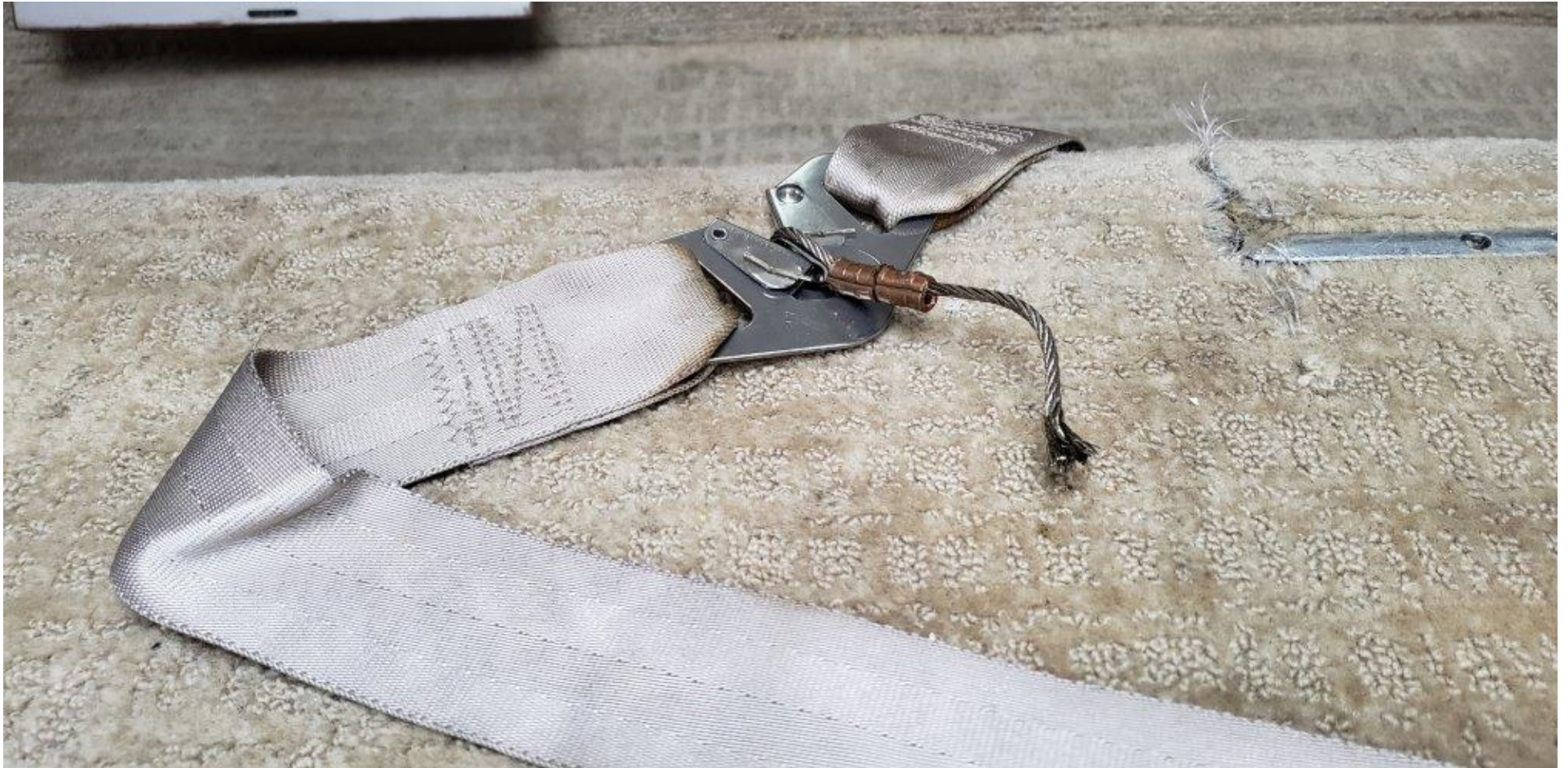
Photo 20 – View of couch seatbelt with broken steel cable