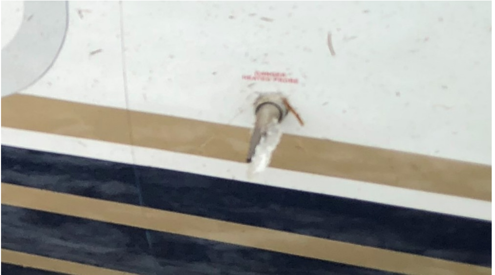
Photo 9 – View of ice build-up on the AOA probe