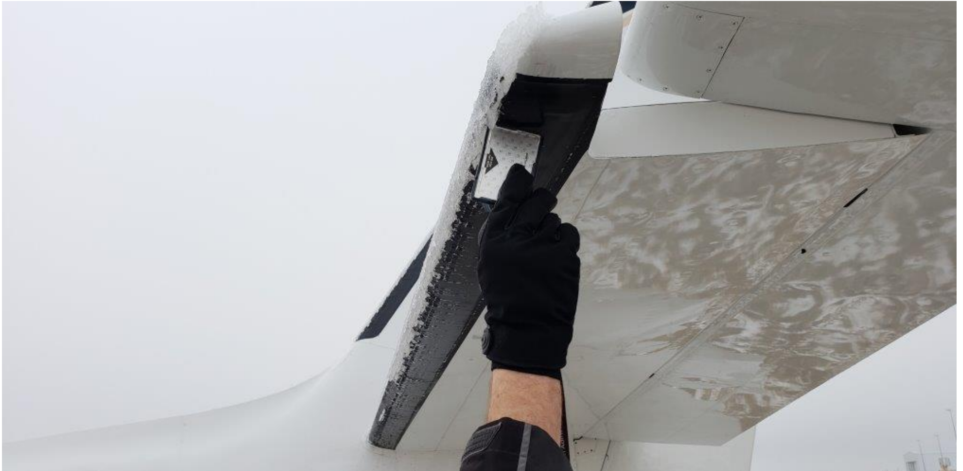
Photo 12 – View of ice build-up on left horizontal stabilizer