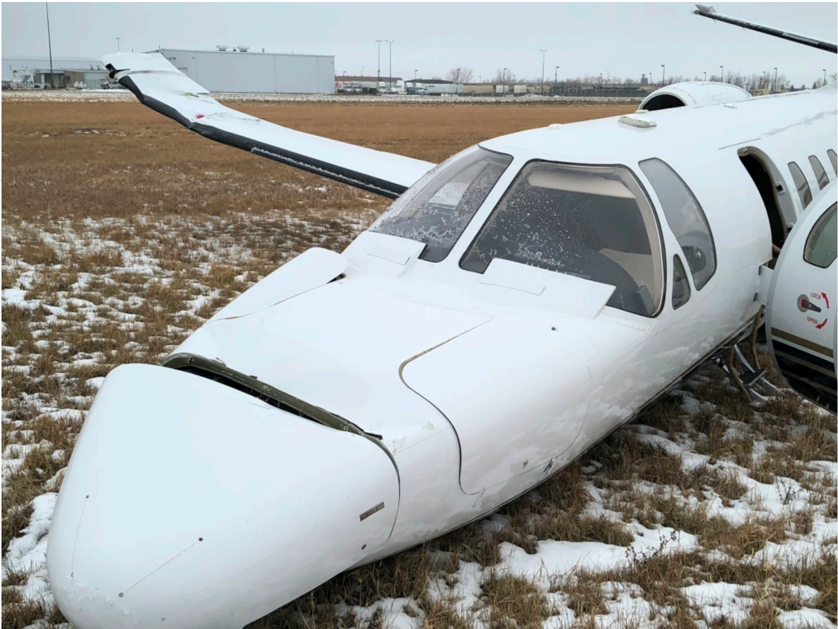
Photo 6 – View of the airplane and damage to the right wing