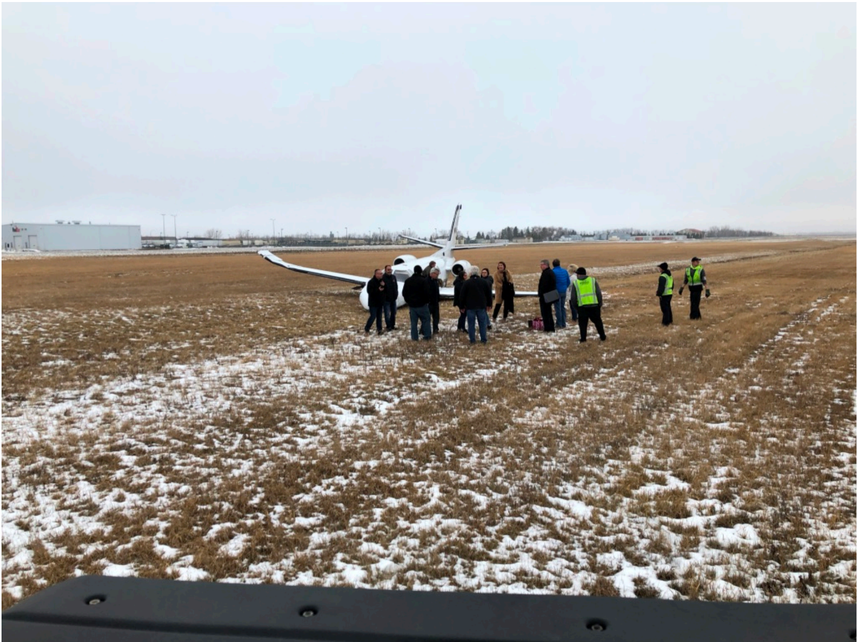
Photo 1 – View of passengers and first responders near the accident airplane