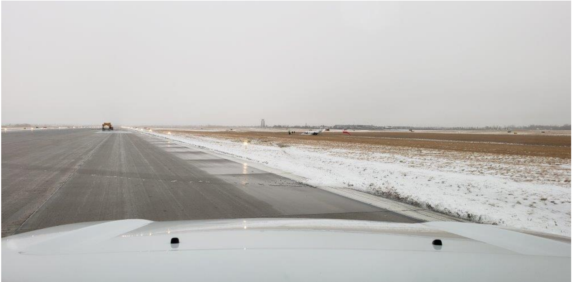
Photo 10 – View of runway and the airplane in the grass infield