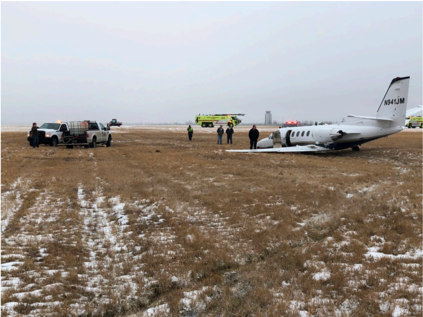
Photo 2 – View of emergency personnel and first responders at accident site