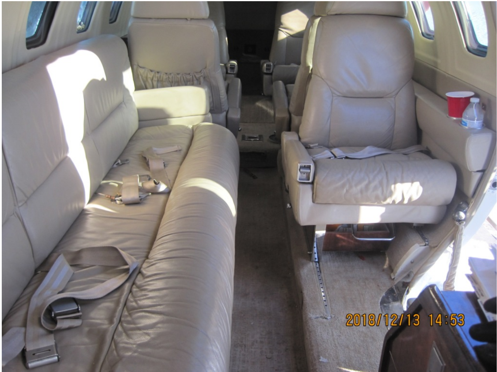
Photo 18 – View of couch, cabinet, seats from the front of the cabin