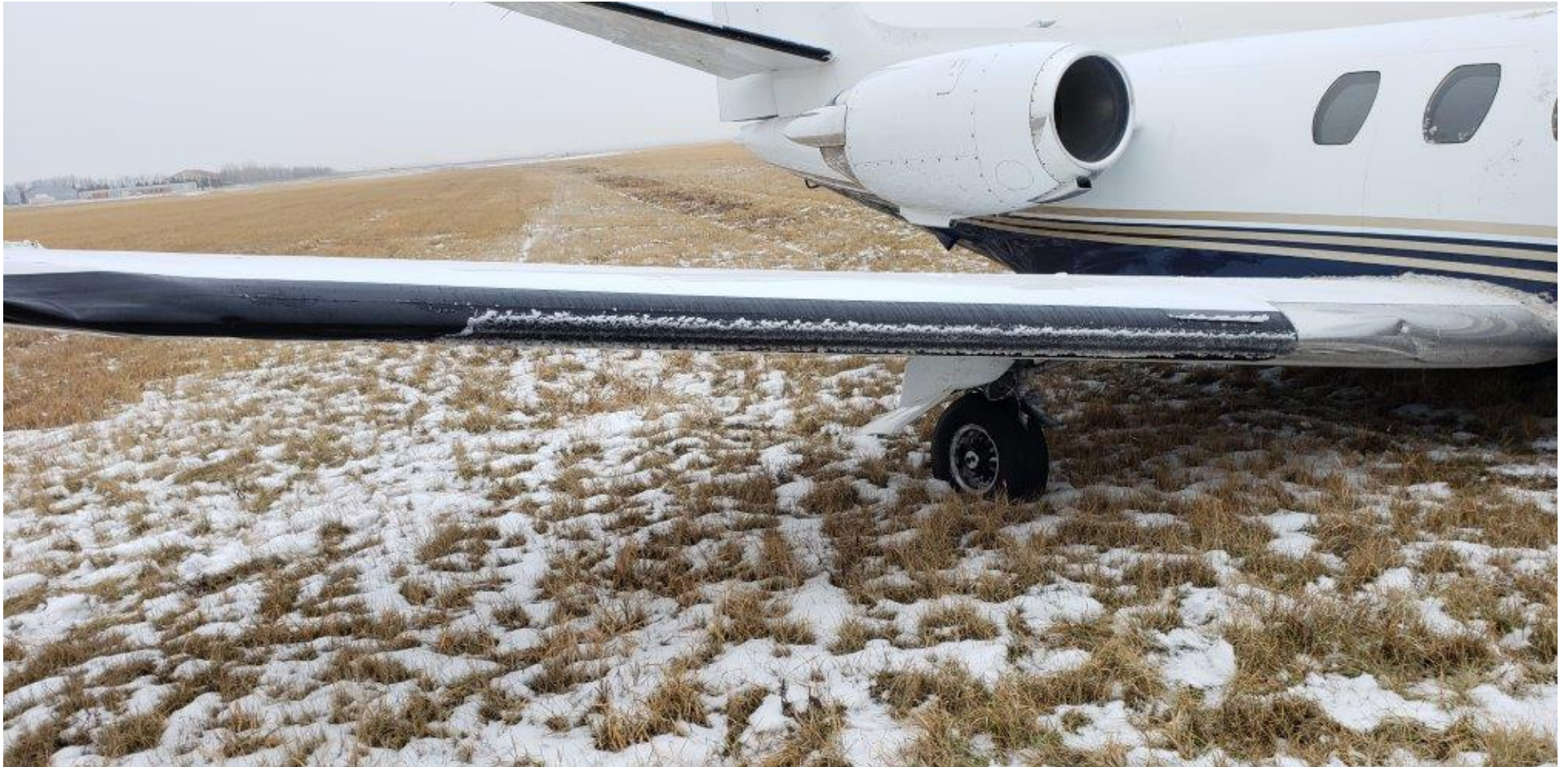
Photo 11 – View of the ice build-up on the leading edge of the right wing