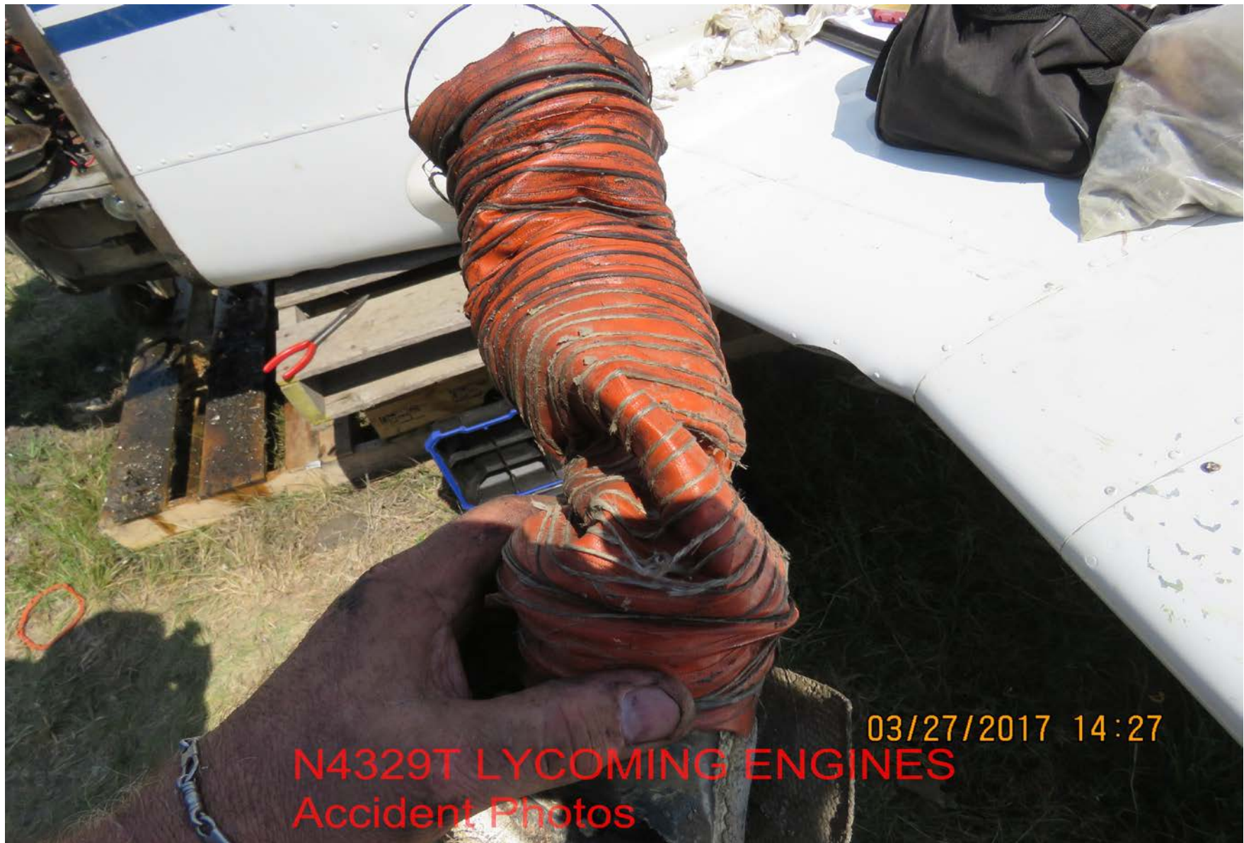
Photo 9 - Scat Host Used for Air Intake Hose to Carburetor