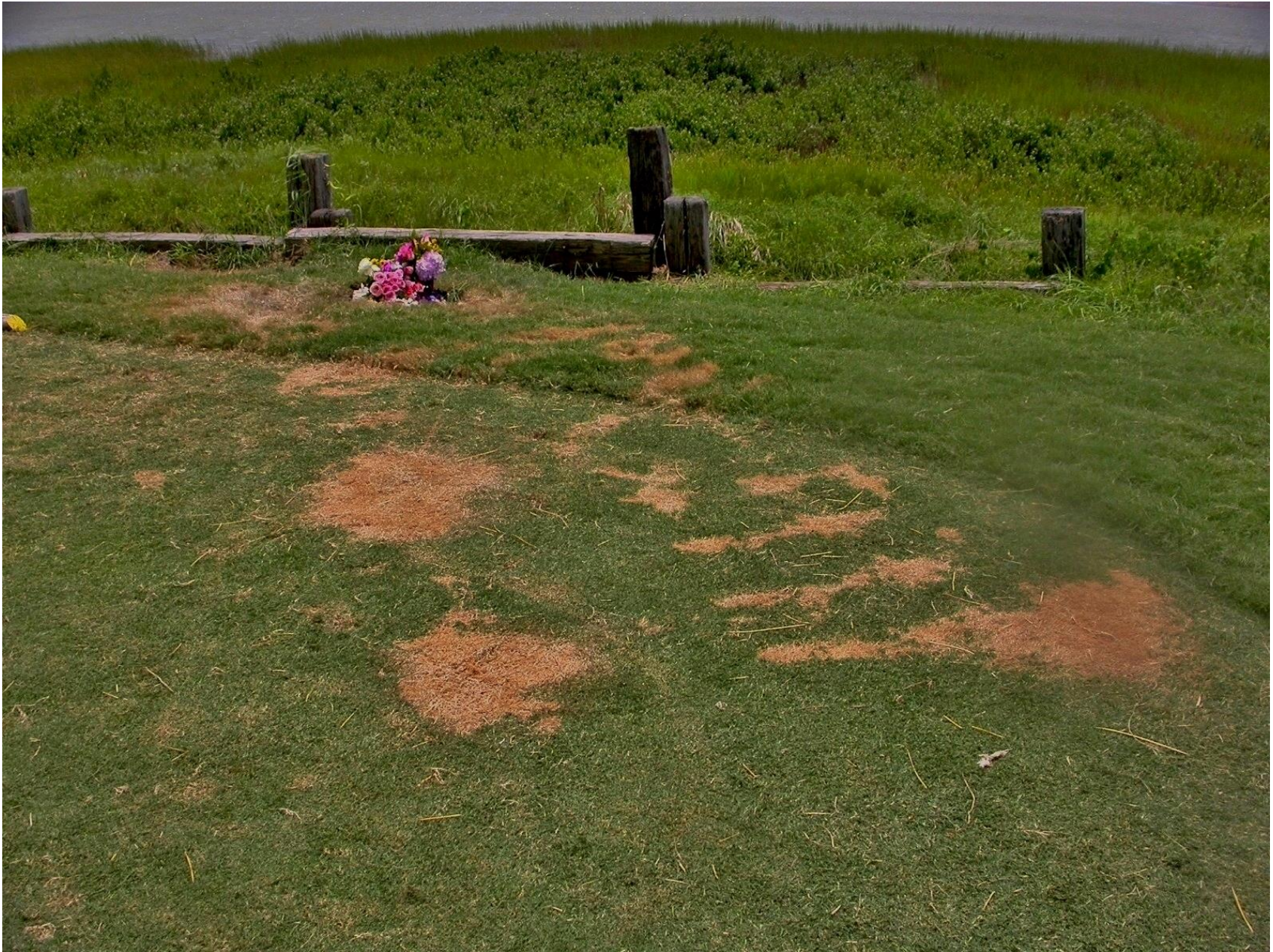
Photo 6 – View of the grass at the accident site two days after the accident occurred