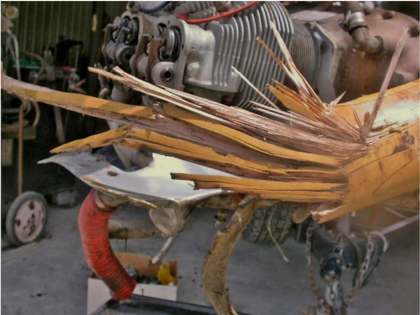
Photo 10 – View of the wooden propeller blade that was broken and splintered.