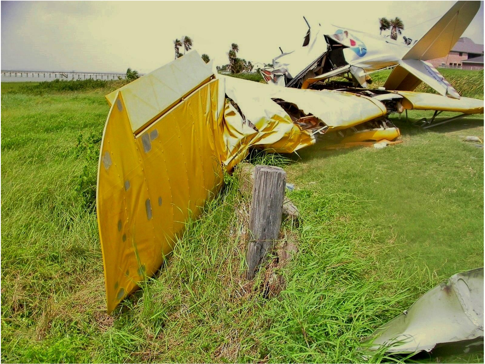
Photo 3 – View of the wreckage taken from the tip of the right wing