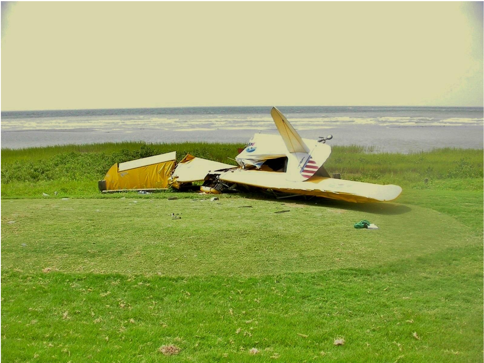
Photo 4 – View of the airplane on the 16th T-box with the bay in the background