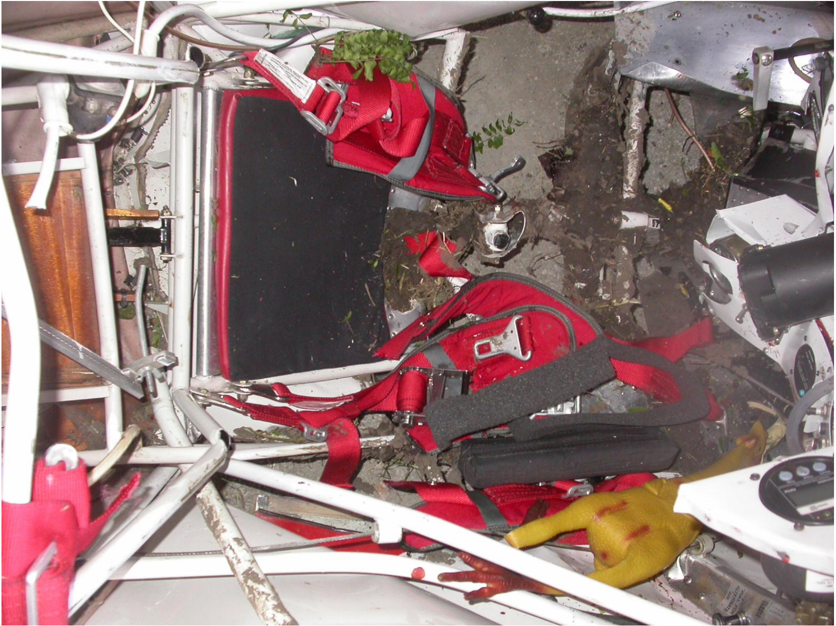
Photo 12 - Overhead view of front cockpit