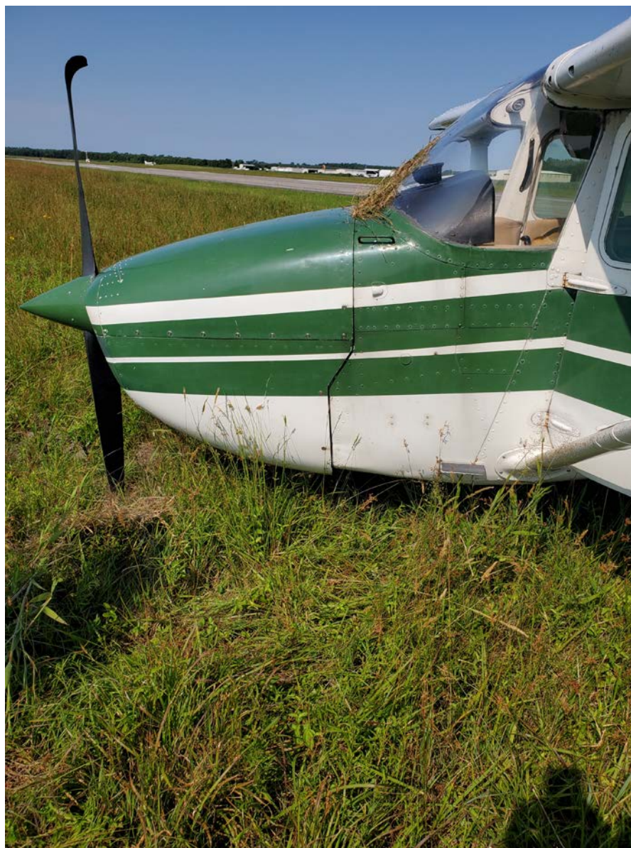
Photo 1 – Left front view of airplane in grass.