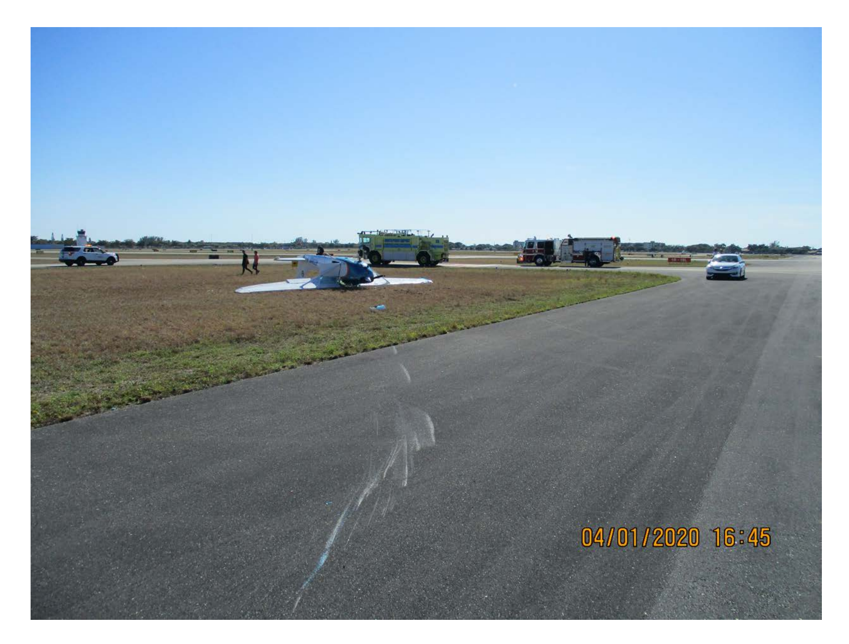
Photo 1 – Runway scrapes leading up to airplane off the side of the runway; airplane is upside down.