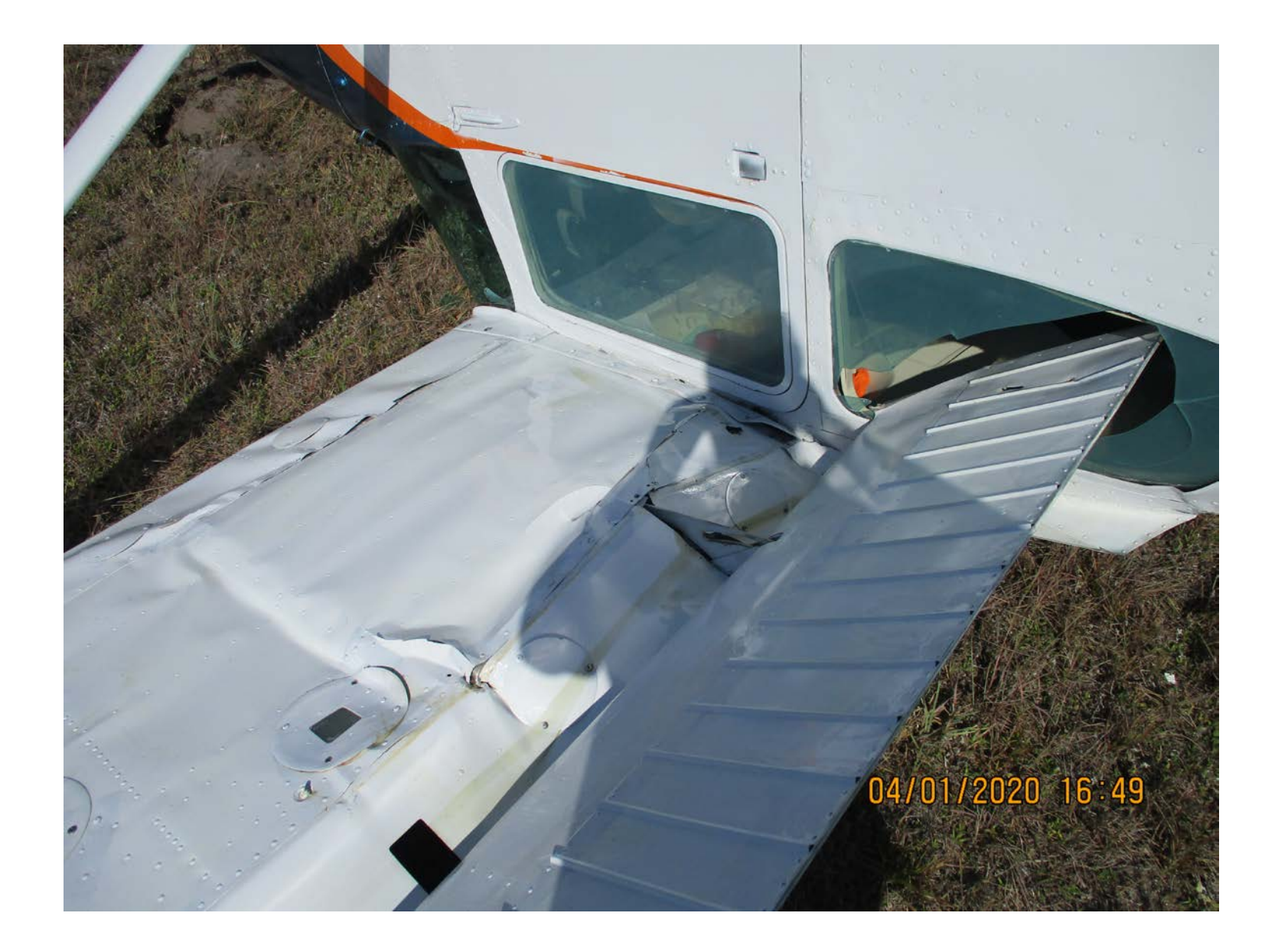
Photo 3 – Wrinkles and tears in bottom of right wing.