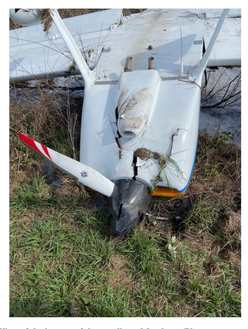
Photo 3 – View of the bottom of the nacelle and fuselage.