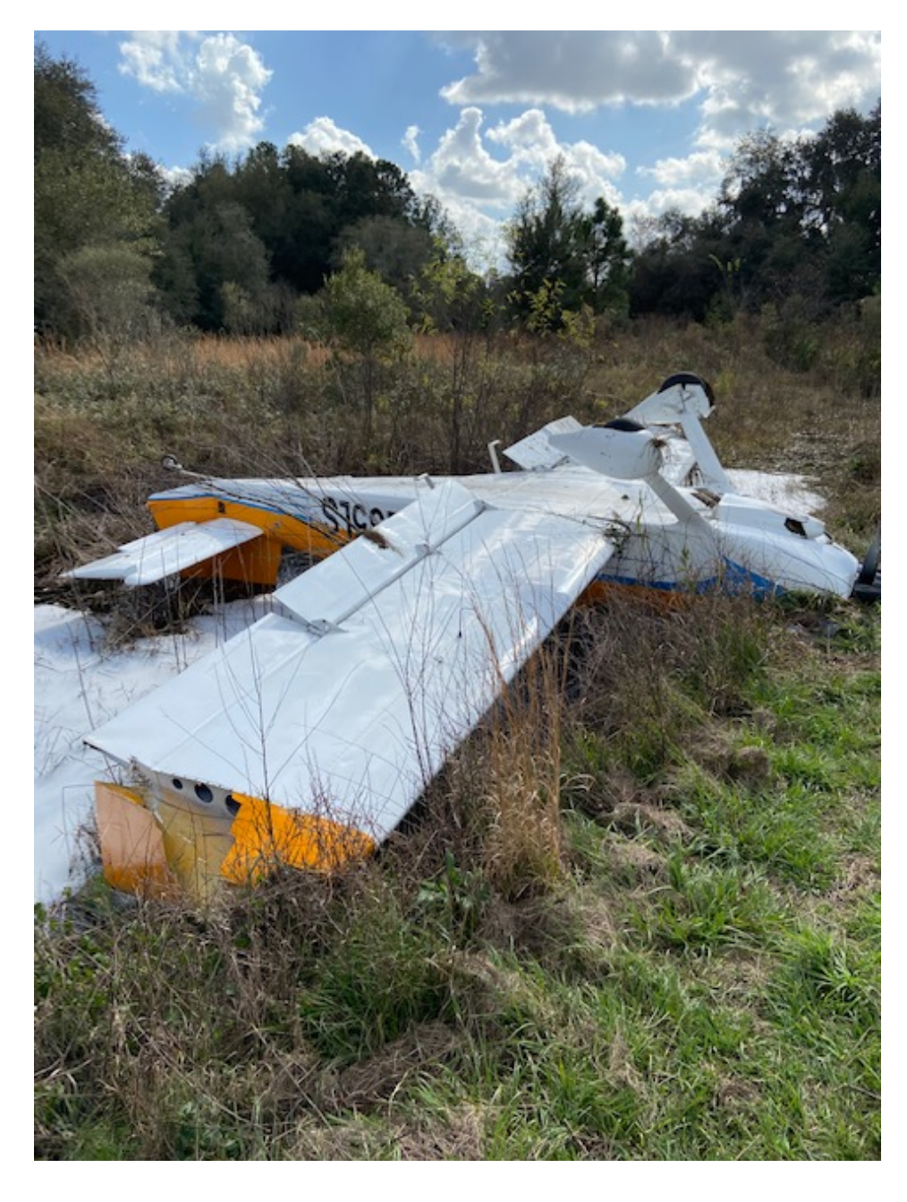
Photo 2 - View of the left side of the airplane as it came to rest inverted.