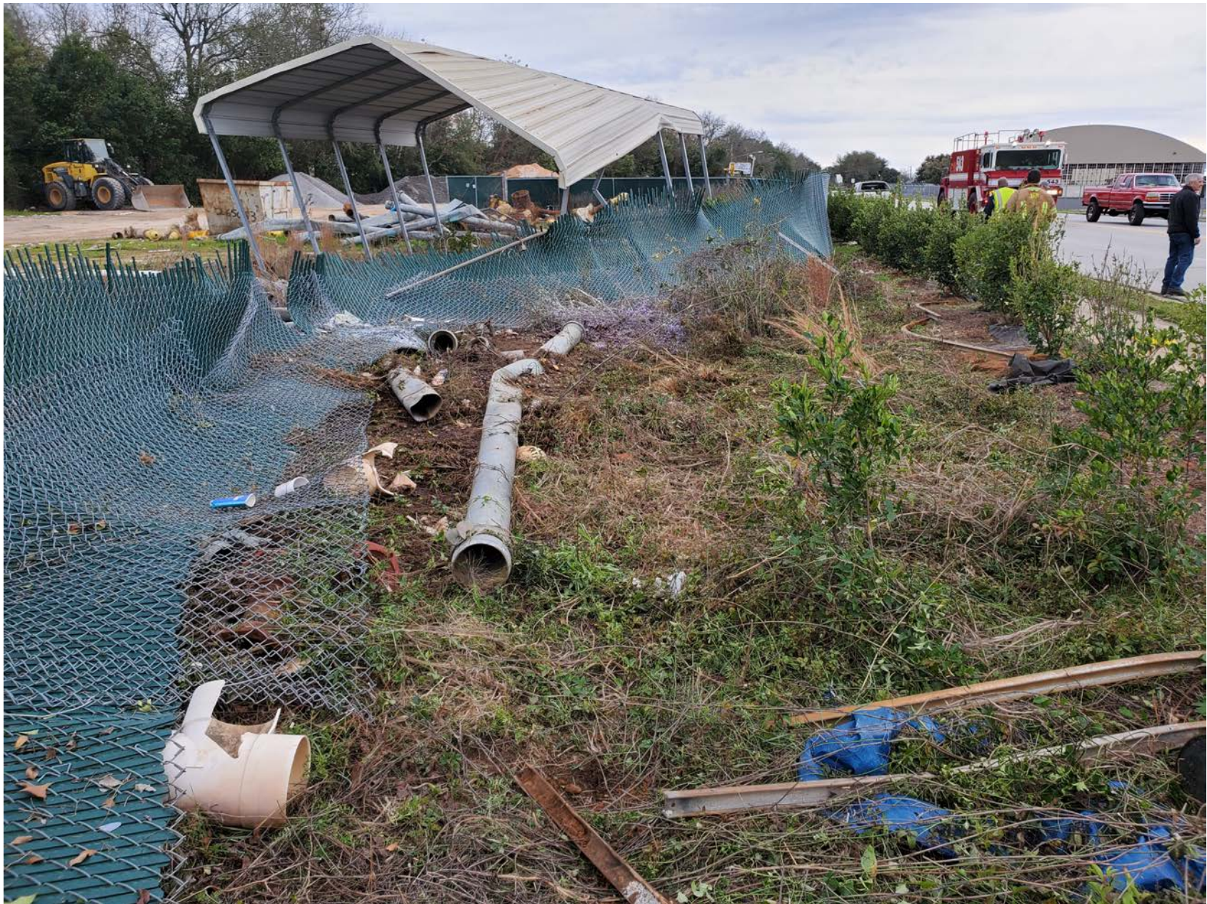
Photo 11 – Accident Site After Wreckage Recovery