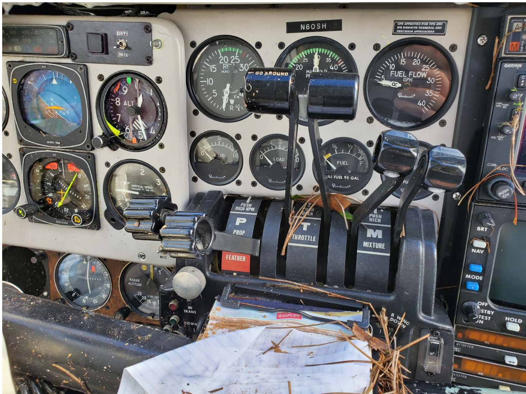
Photo 8 – Propeller, Throttle, and Mixture Levers