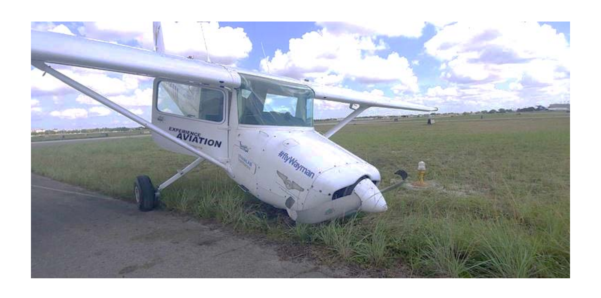
Photo 1-View of accident airplane at the accident site