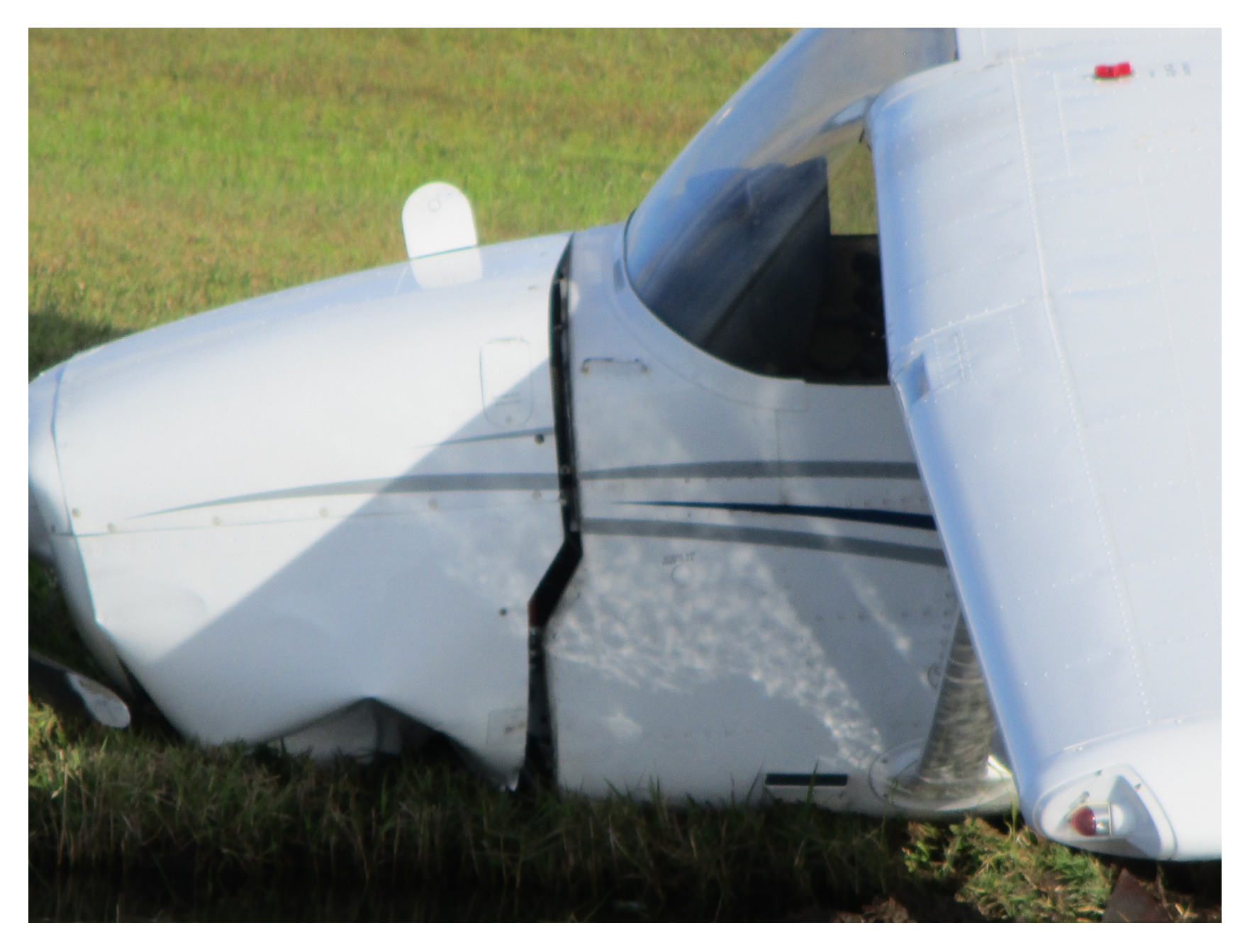
Photo 1- View of nose of airplane on right side showing buckling of fuselage