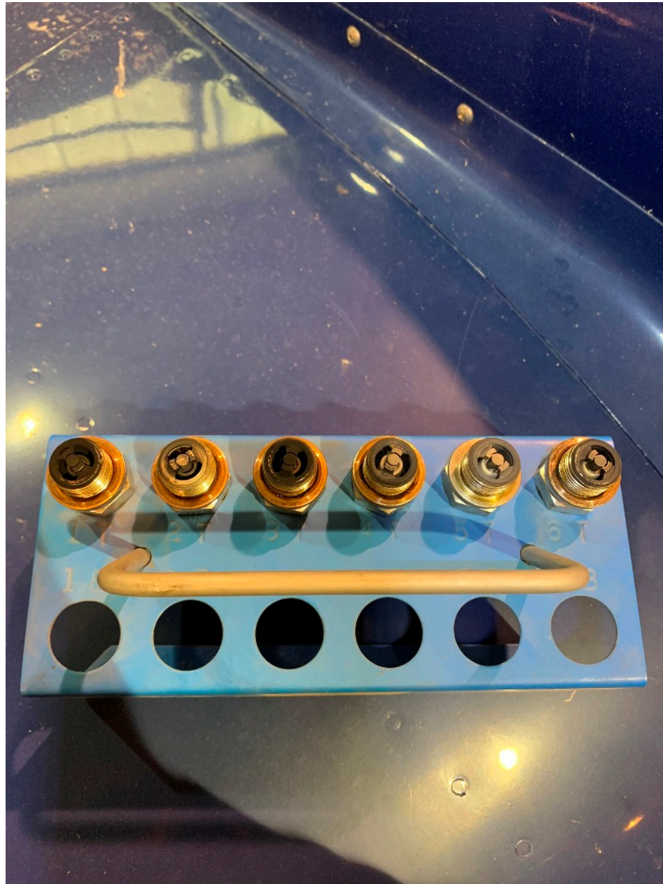
Photo 5 - Right Engine Top Spark Plugs