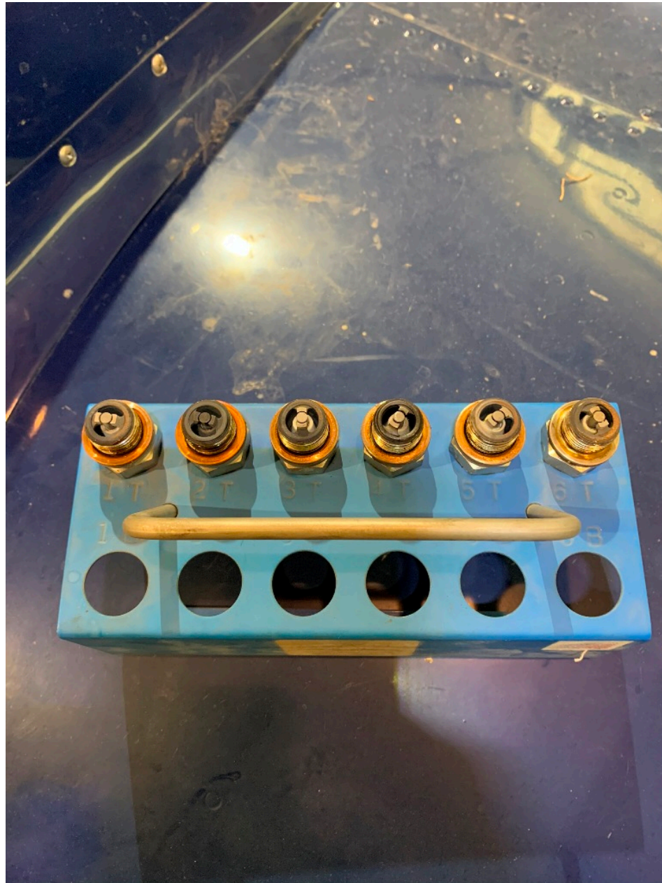
Photo 4 – Left Engine Top Spark Plugs