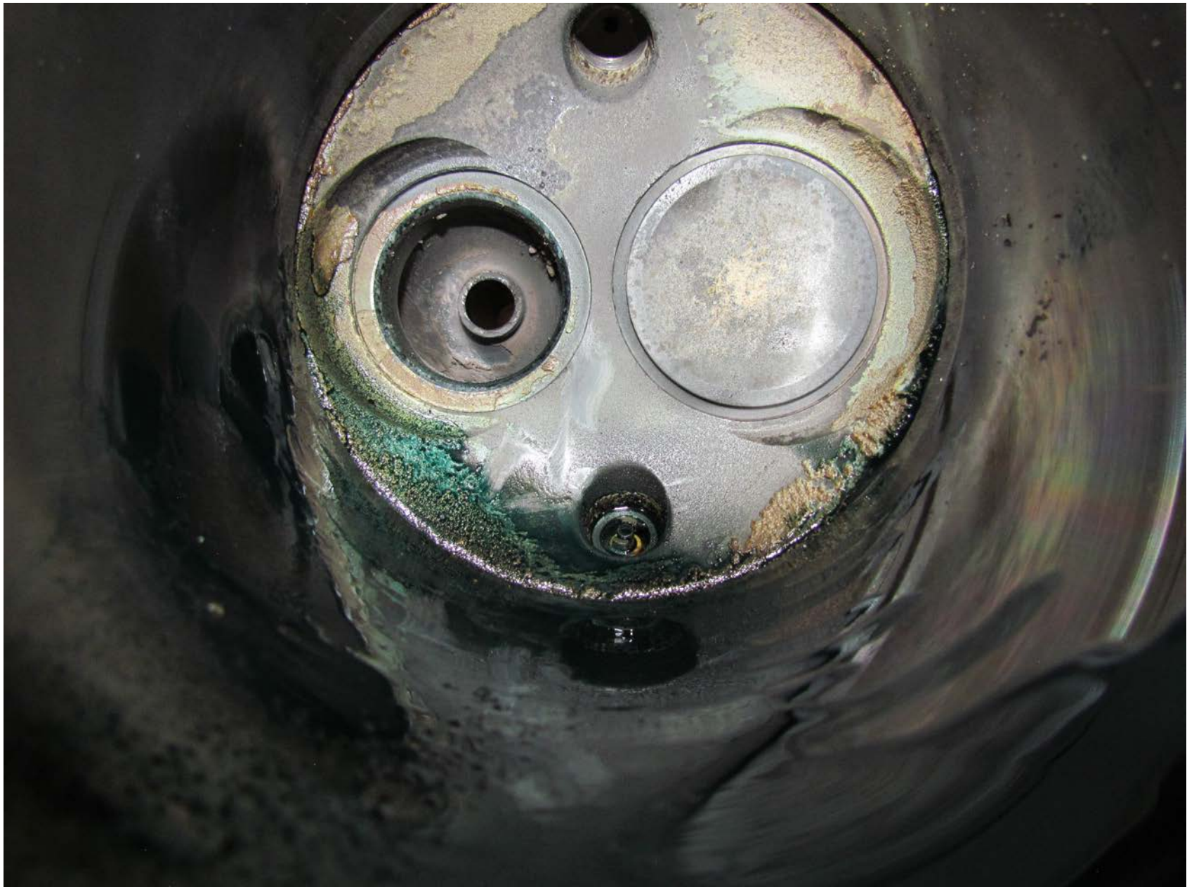
Photo 13 – No. 4 Cylinder with Exhaust Valve Removed