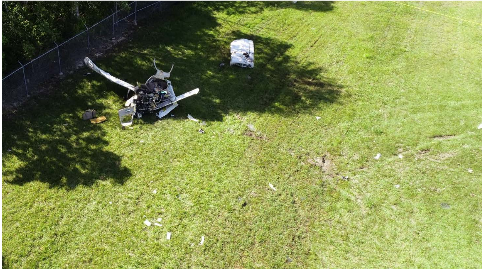
Photo 1 – View of Airplane Wreckage and Debris Path