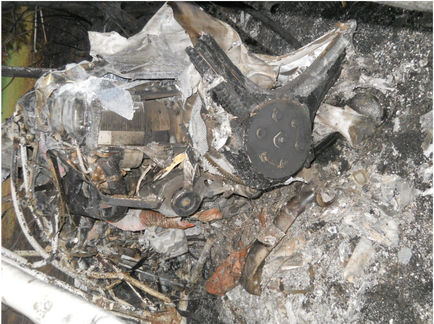
Photo 3 - Engine