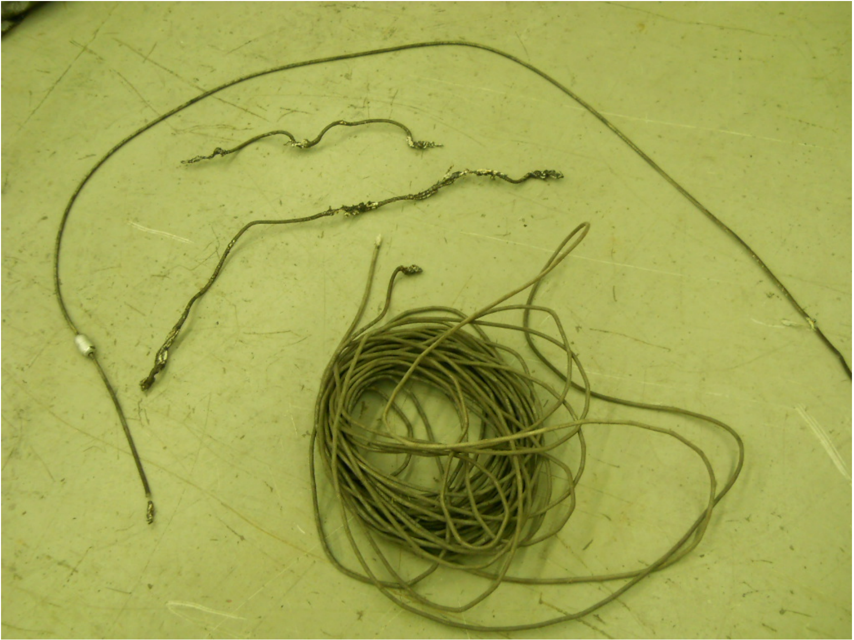
Photo 6 - Towrope